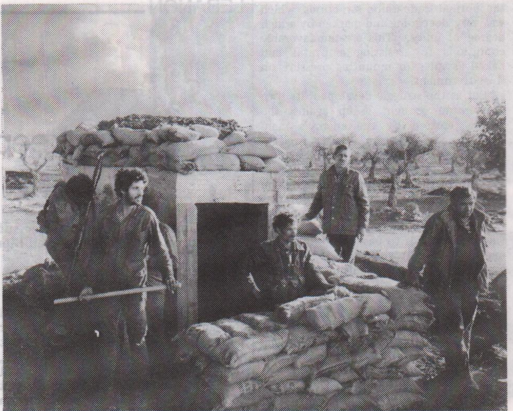
PLO guerrilla fighters (DR)

It was a betrayal worked out between Syrian Foreign Minister Khaddam and Israeli Minister of Defense Shimon Peres, culminating in the Israeli-Syrian siege of Tal al Zataar. The troops of Assad protected the militia of Bashir Gemael and the Tiger Brigade of Camille Chamoun as they slaughtered Palestinian civilians in a brutal prelude to Sabra and Shatila.