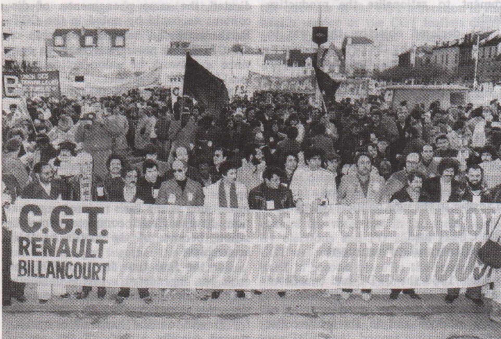
CGT support for Talbot strike before agreement with government (DR)

Despite its numerical weakness and its youth, the CFDT section in Talbot-Poissy was thrust onto the national scene by the activity of its militants, who became the leaders of the dispute. They, with the agreement of the rank and file representatives of the CGT who had broken with the line of their leadership, promoted the formation of a short-lived strike committee.