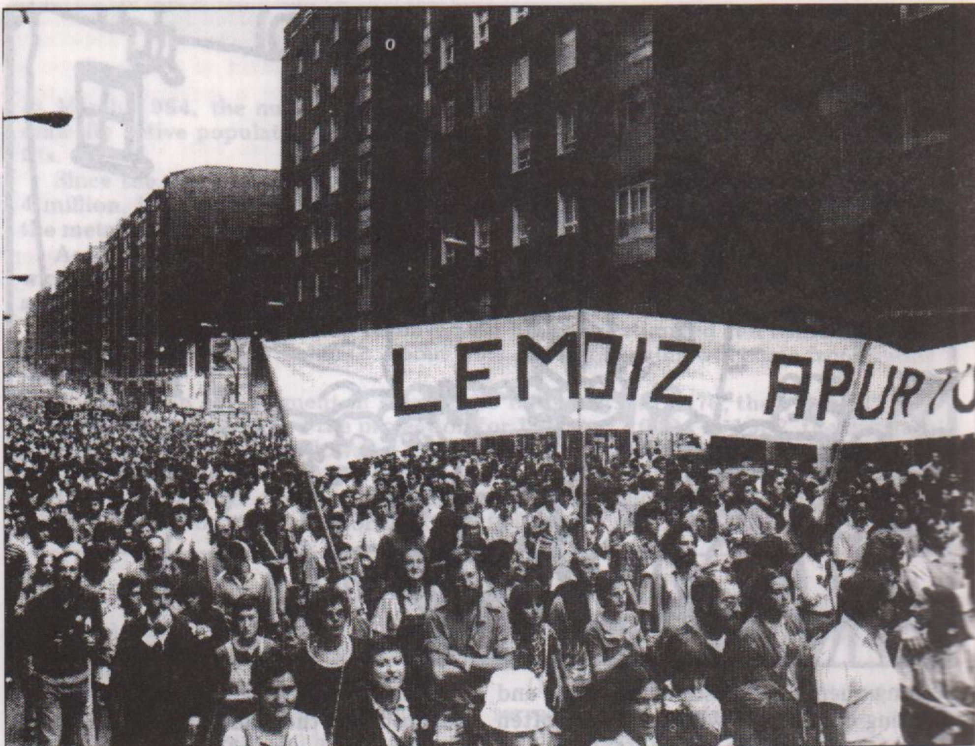
One successful struggle by workers in the Spanish state — against the Lemoniz nuclear power station in the Basque country

In these conditions, at the end of February, the government launched its final offensive against Sagunto. Yet another