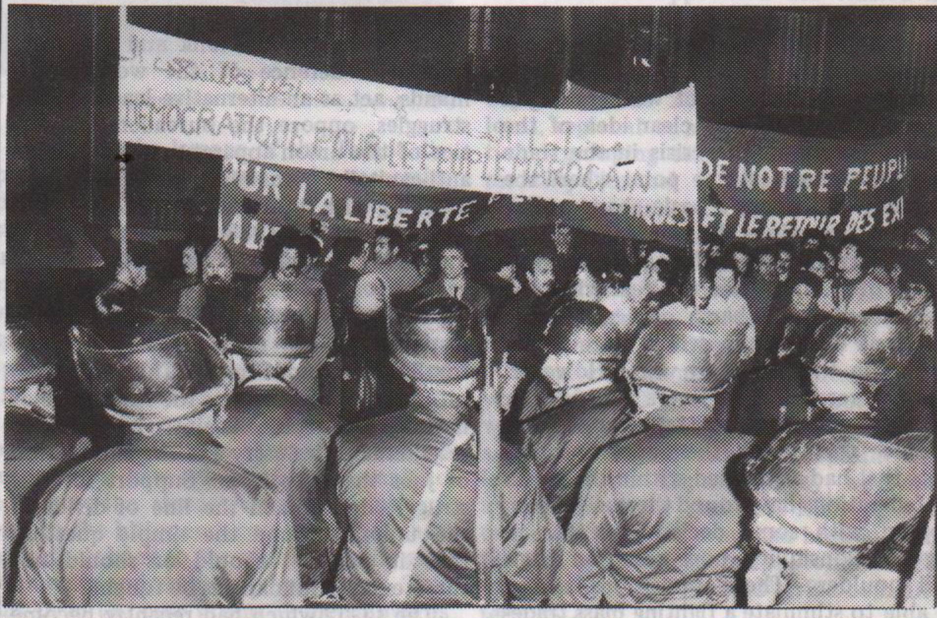
January 1984 hunger riots in Morocco

United Secretariat of the Fourth International June 7, 1984