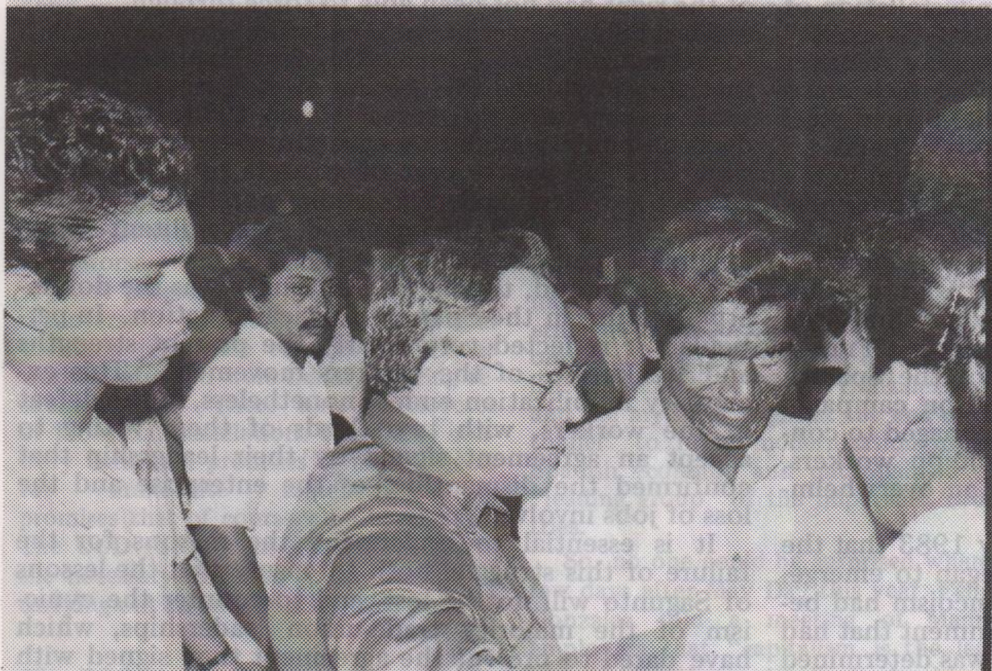
FSLN leader Tomas Borge with Miskito Indians

So, first the war has to end, and then it should be considered whether talks with the Miskitos and Creoles in exile might not be the only way to avert a long-drawn out guerrilla war. ■