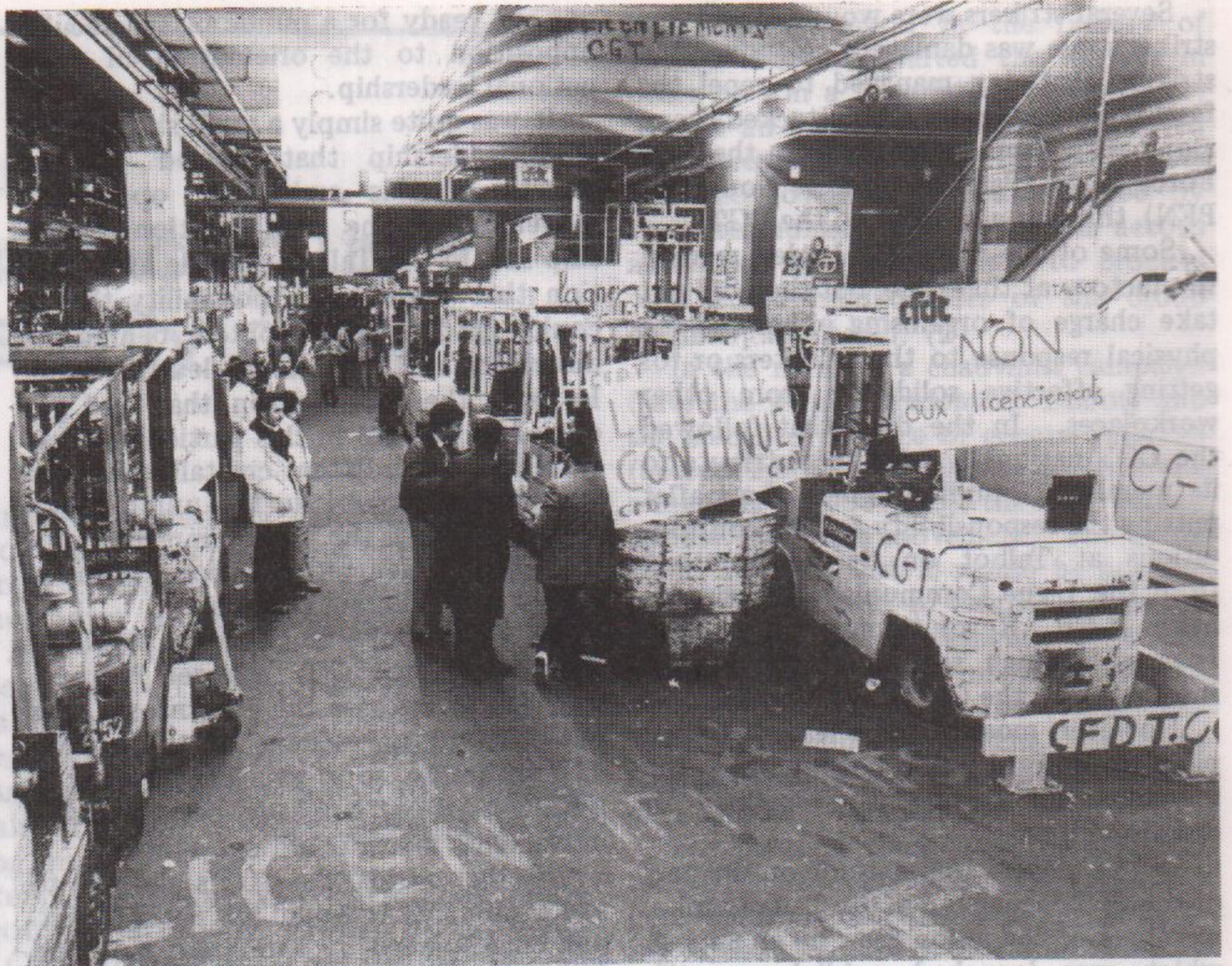
The CFDT continued to fight alongside the immigrant workers

The ambition of the CFDT national leadership was to reproduce within the union movement what the SP had achieved on May 10, 1981. That is, it wanted to put the CGT in a minority as the CP had been. The project of the CFDT leaders was thus to make their confederation the centre of a broad recomposition of the union movement. They saw this as taking place around the political axis of adapting the orientation, practice and even the structure of the trade unions to the present situation marked by econom-