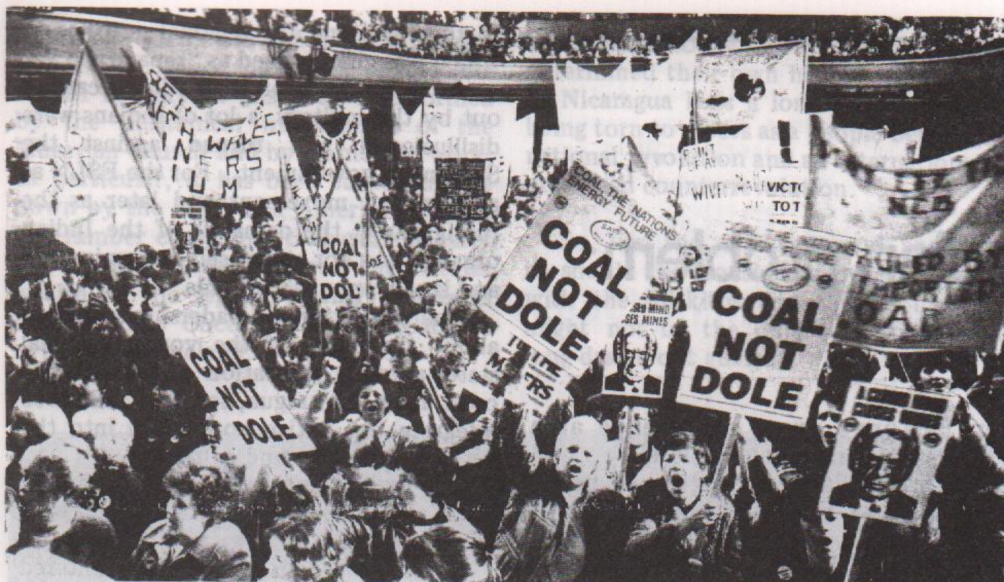
Miners' wives at Barnsley rally

assets in a matter of weeks. So the result of Thatcher's decision is that we are facing real hardship; families are now going hungry.