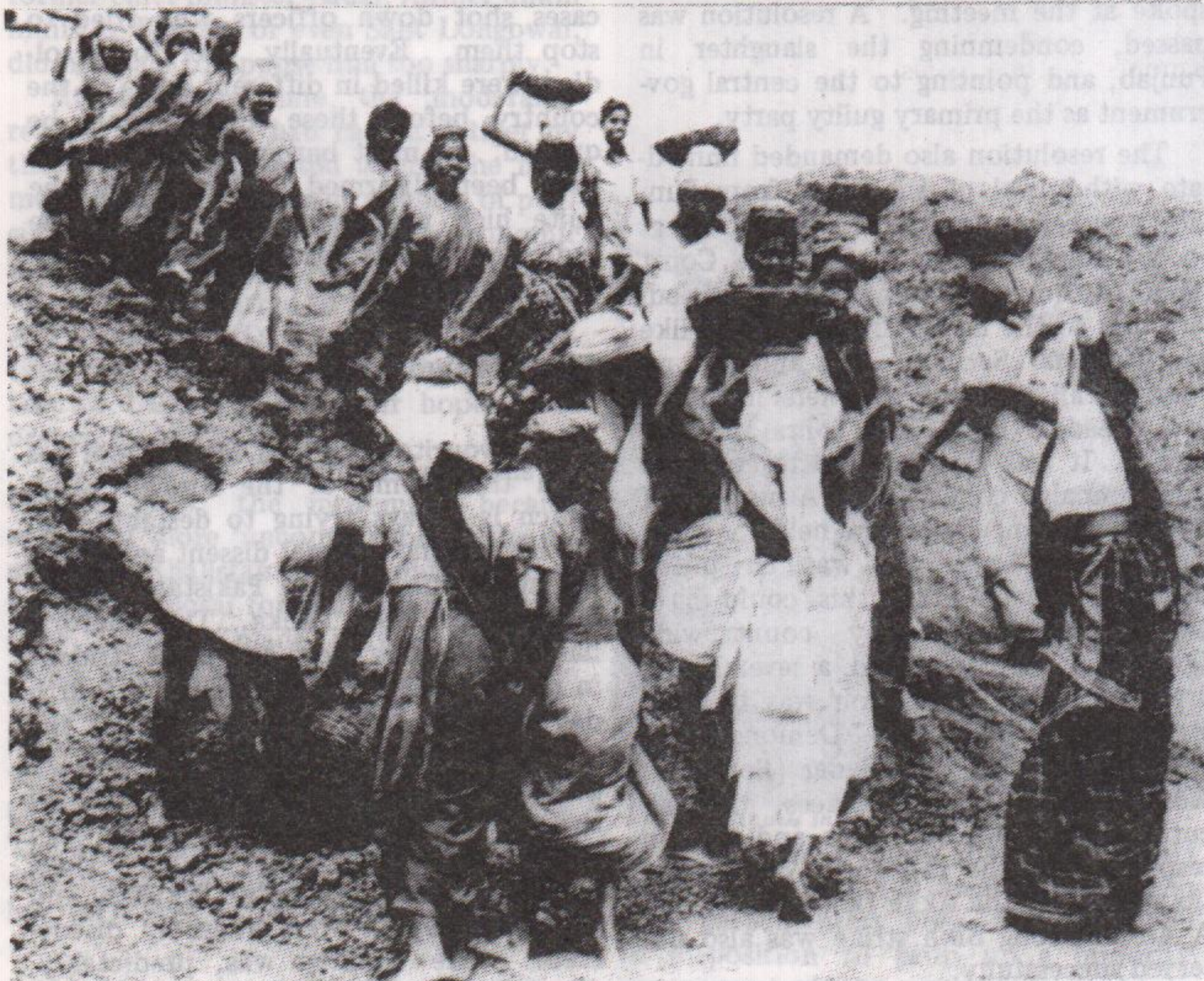
Indian women building a dam (DR)