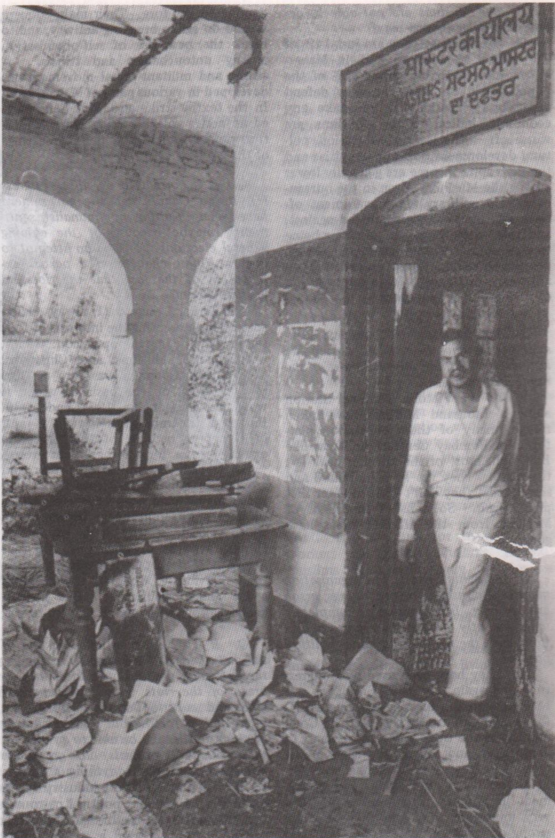
A railway station destroyed by riots

A. With a demoralisation and defeats of the working-class movement, communalist, castist and regionalist forces will come to the fore. There are working-class struggles, but at present I see it as a period of demoralisation and defeat for the working-class struggle, because the traditional left parties are just not interested in doing even any token work related to this struggle. And the far-left groups at present are in a process of reorganisation. This has just started, so they themselves are still con-