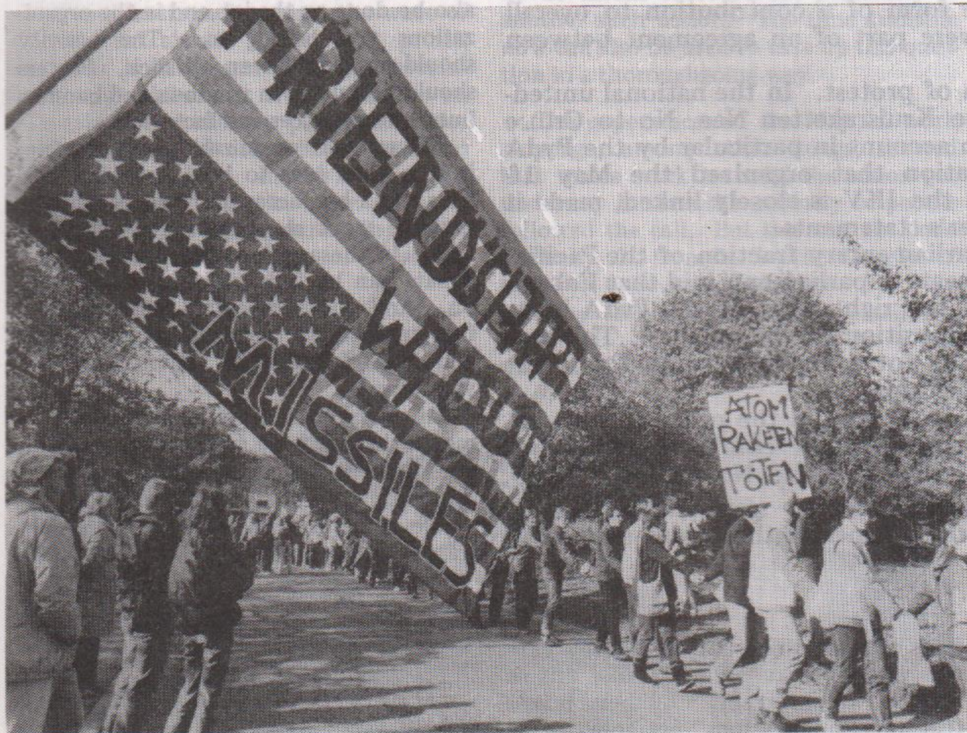
200,000 West German protestors formed a human chain in October 1983

There is nothing to be feared in the verdict of really democratic assemblies of the peace movement, any more than there is any reason to worry about majorities making 'unrealistic' decisions. Quite the contrary, we should rely entirely on those who are mobilised in the fight for peace, on the workers and youth, to exercise a check on the choices that the capitalist governments are trying to impose on us. As for those who are making so much noise about 'democracy' — provided it does not go too far — they will resolve nothing. Everyone can put forward their point of view, make their proposals for action and be judged by those who have worked to build the peace movements and their work, and who represents its gains.