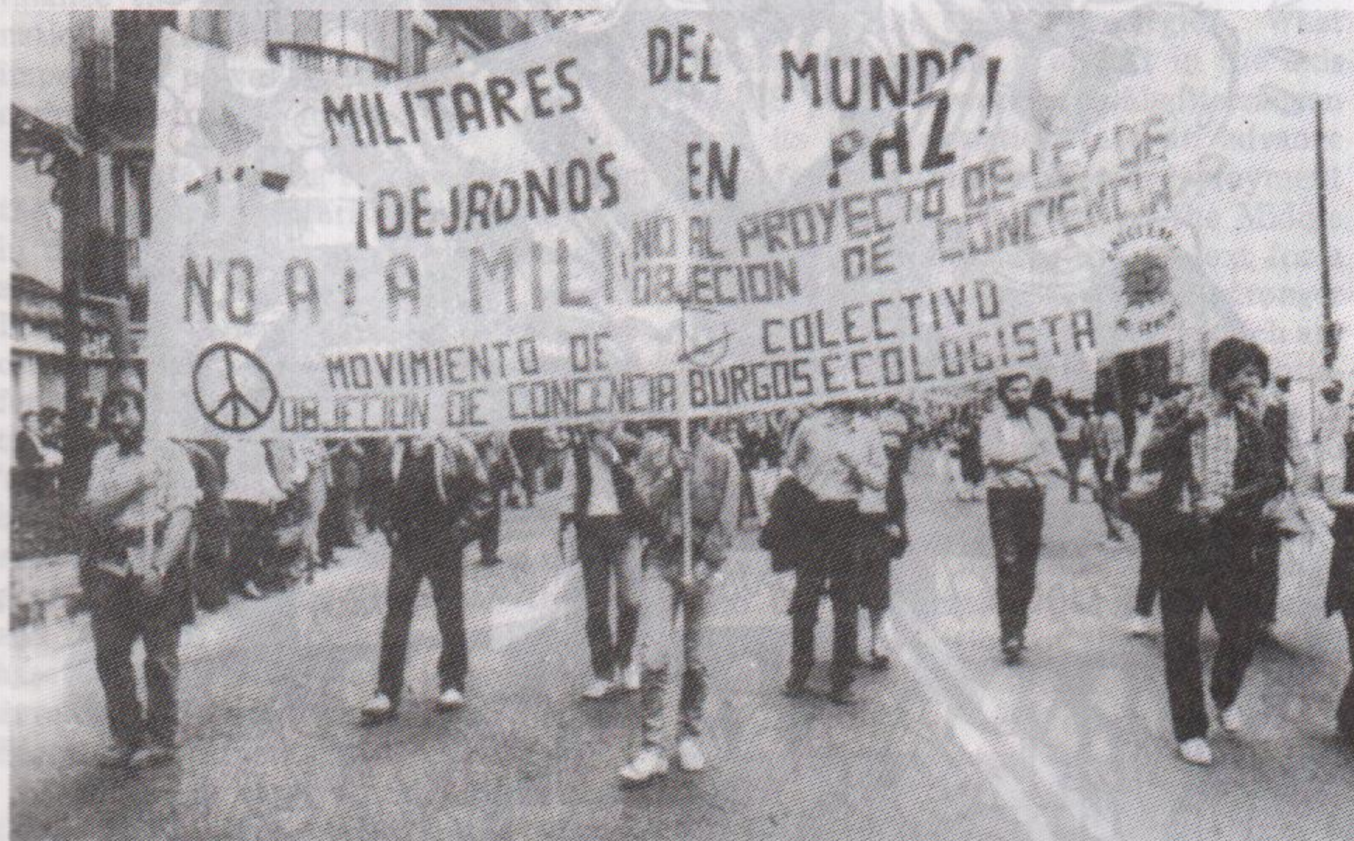
The Spanish peace movement focuses on opposition to Nato and US bases (DR)

The practical significance of this orientation for a Central European theatre of operations has been analysed several times. The 'Airland Battle' doctrine projects the United States launching a preventive attack and a forward battle deep behind the Soviet lines at the same time, combining nuclear, conventional and nuclear attacks along the Soviet lines. In fact, this doctrine leads to an inescapable logic of a rapid escalation of every military conflict, in which the threat of a holocaust is counter-balanced by the, indeed illusory, hope that the Soviet bureaucracy can be forced to throw in the towel by a decisive blow at the start of the hostilities. The consequence of such a military orientation can only be to strive for a decisive advantage in all aspects of weaponry, in order to regain a sufficient 'margin of safety' for the imperialist aggressor in all areas, even if this is at the price of an unprecedented stepup in the arms race. There is no doubt that the main impetus to the present arms race comes from the deep