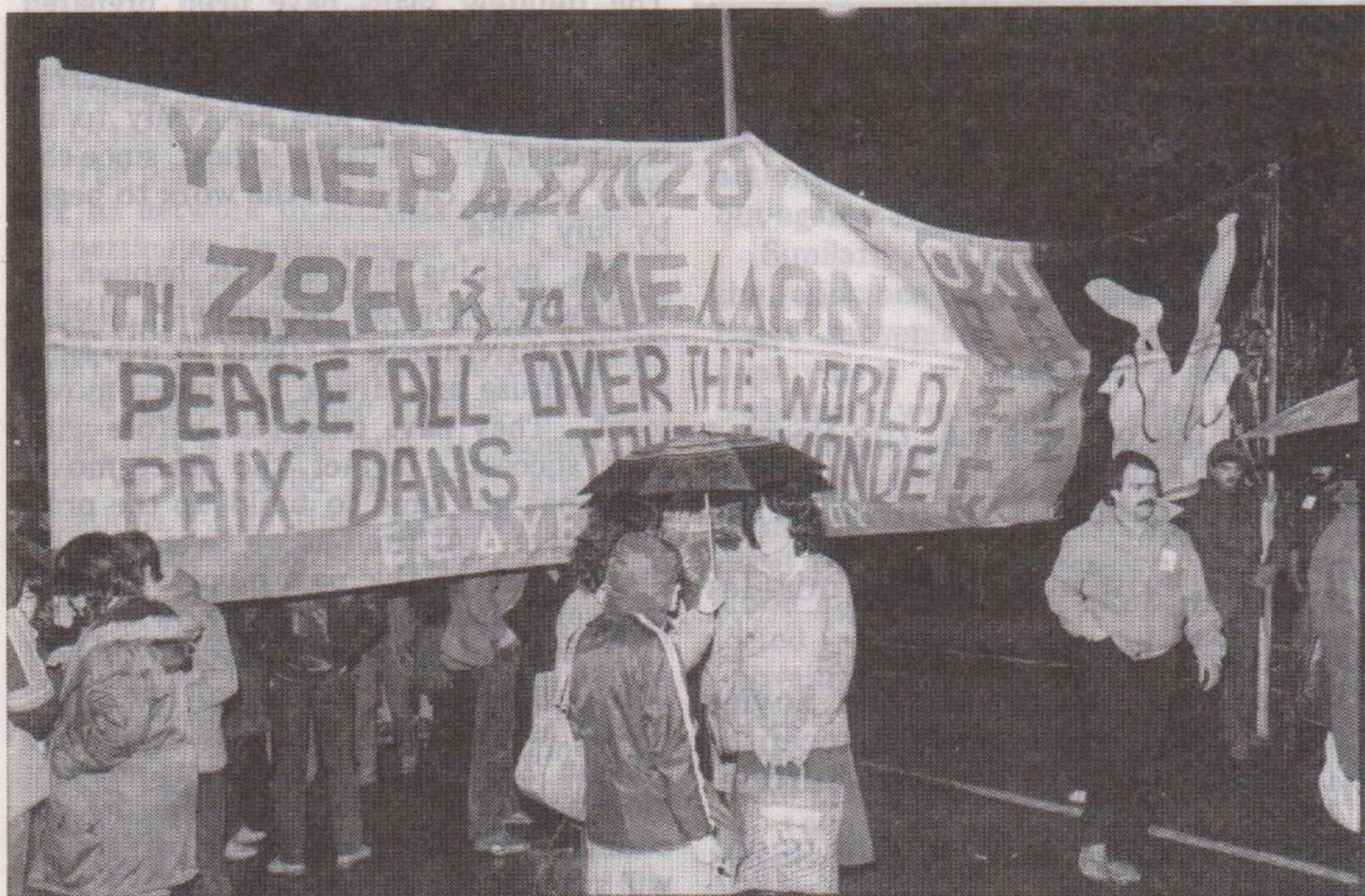
Anti-missiles protest in Athens during European summit in December 1983

stage of activity and debate there are different answers.