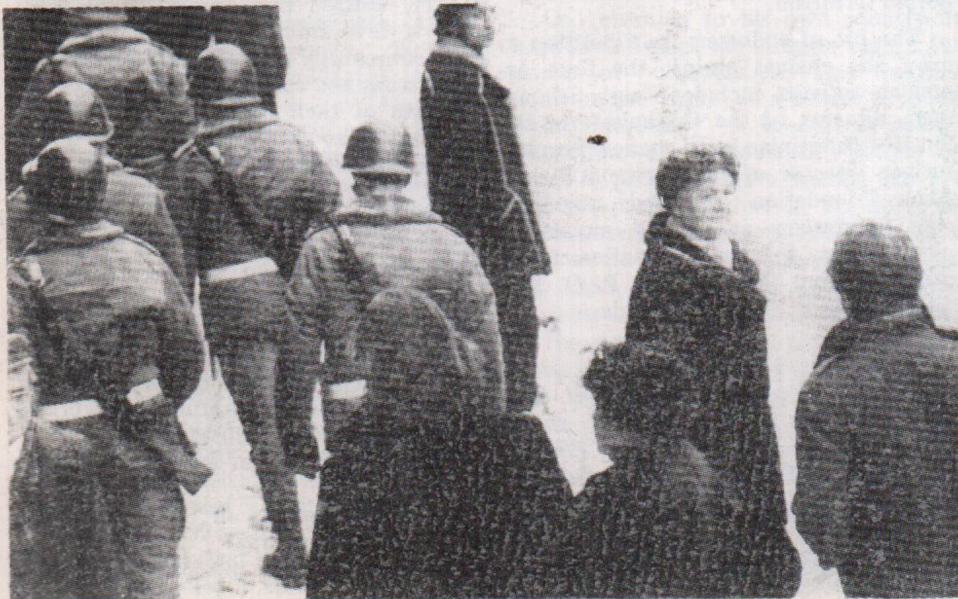
Polish soldiers on patrol