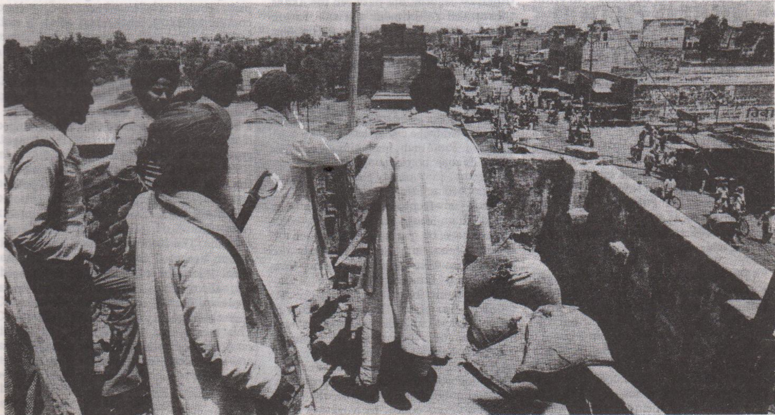
Akali negotiators on roof of Golden Temple complex

Given this situation, and the necessity to combine religion with politics in order to build up a mass appeal, it was hardly surprising that the 'extremists' in the movement could seize and retain the initiative. Sant Jarnail Singh Bhindranwale represented the organised 'extremist' faction. As religious overtones be-