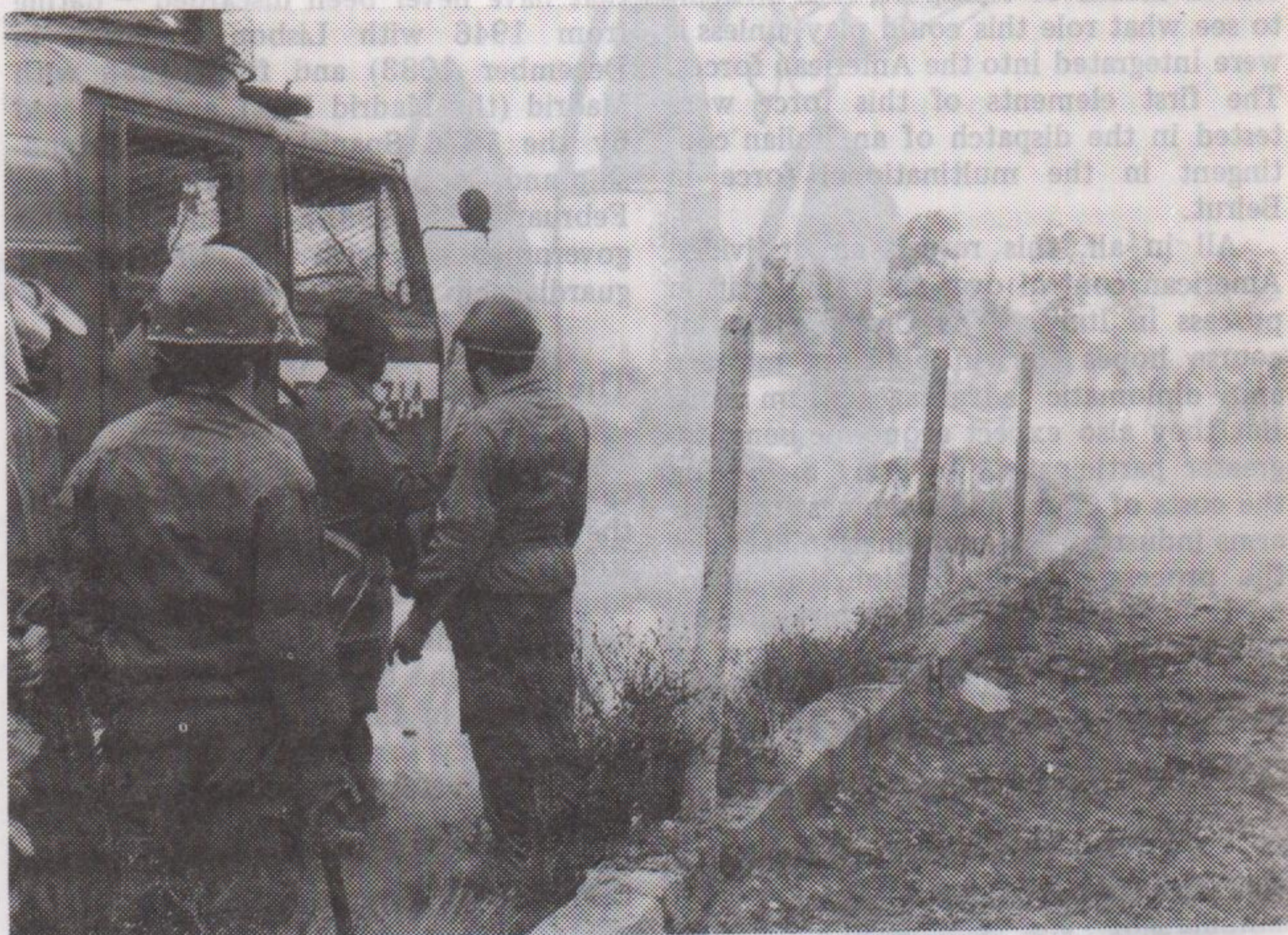
Violent repression of anti-missiles protestors at Comiso (DR)

There are in fact many answers to these problems that are formulated in terms that are much too vague to have