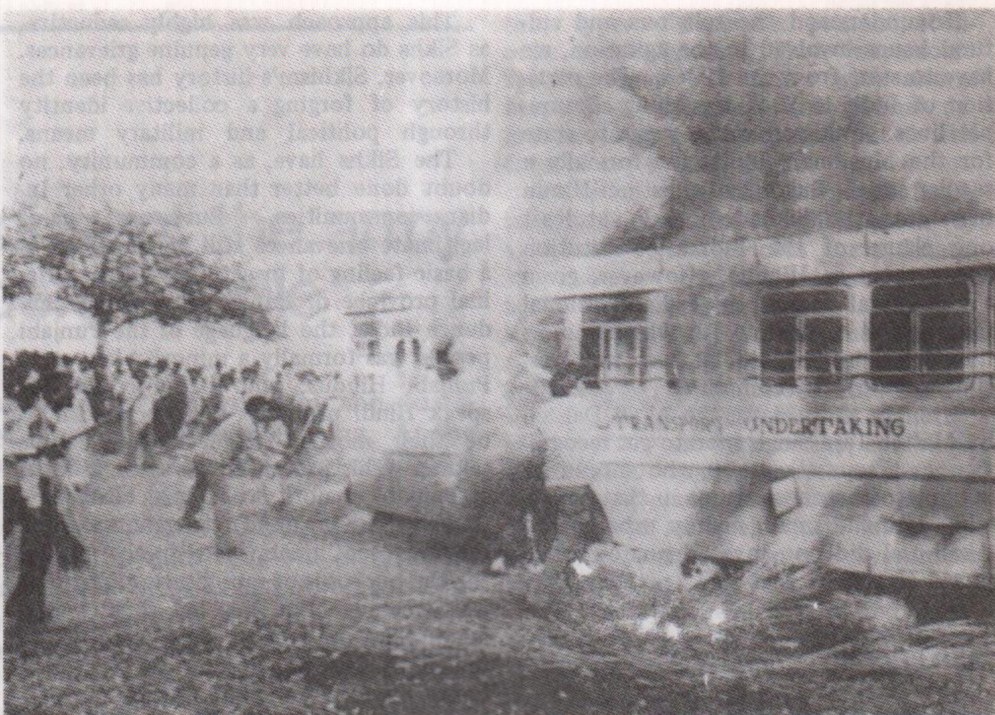
Rioting Hindus in Punjab (DR)

At the all-India level, the CPI(M)'s call for restructuring centre-state relations could have been another theme to bring the party closer to the Akalis. But the CPI(M) is also extremely concerned about 'national integration', by which it means you have to oppose any movement against national oppression, regional imbalance, etc., the moment it steps out of the purely constitutionalist framework.