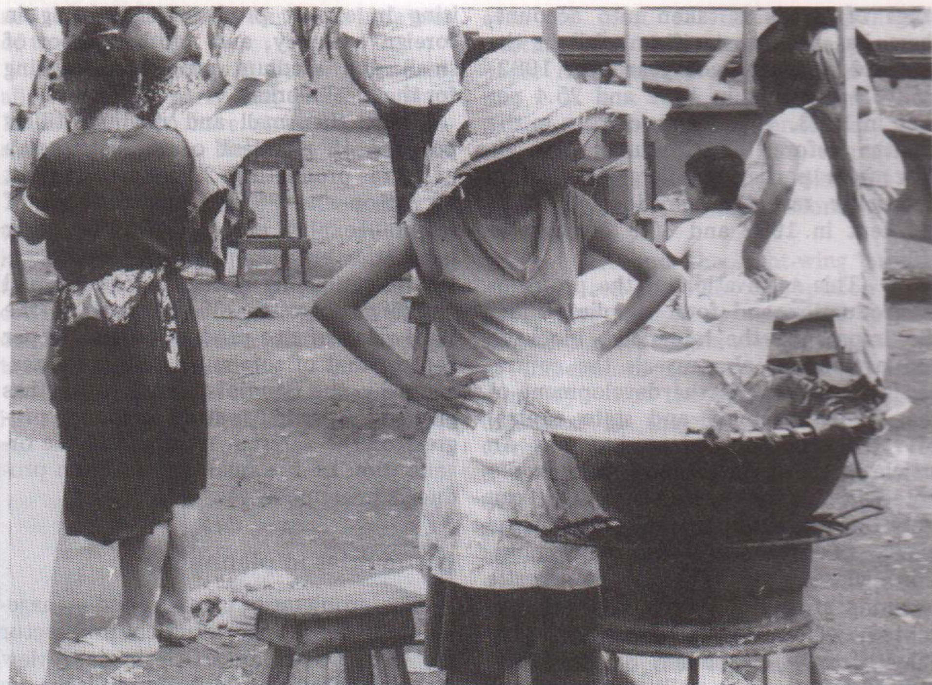
Eastern market in Managua (DR)

Public control over the selling and distribution of the eight basic products