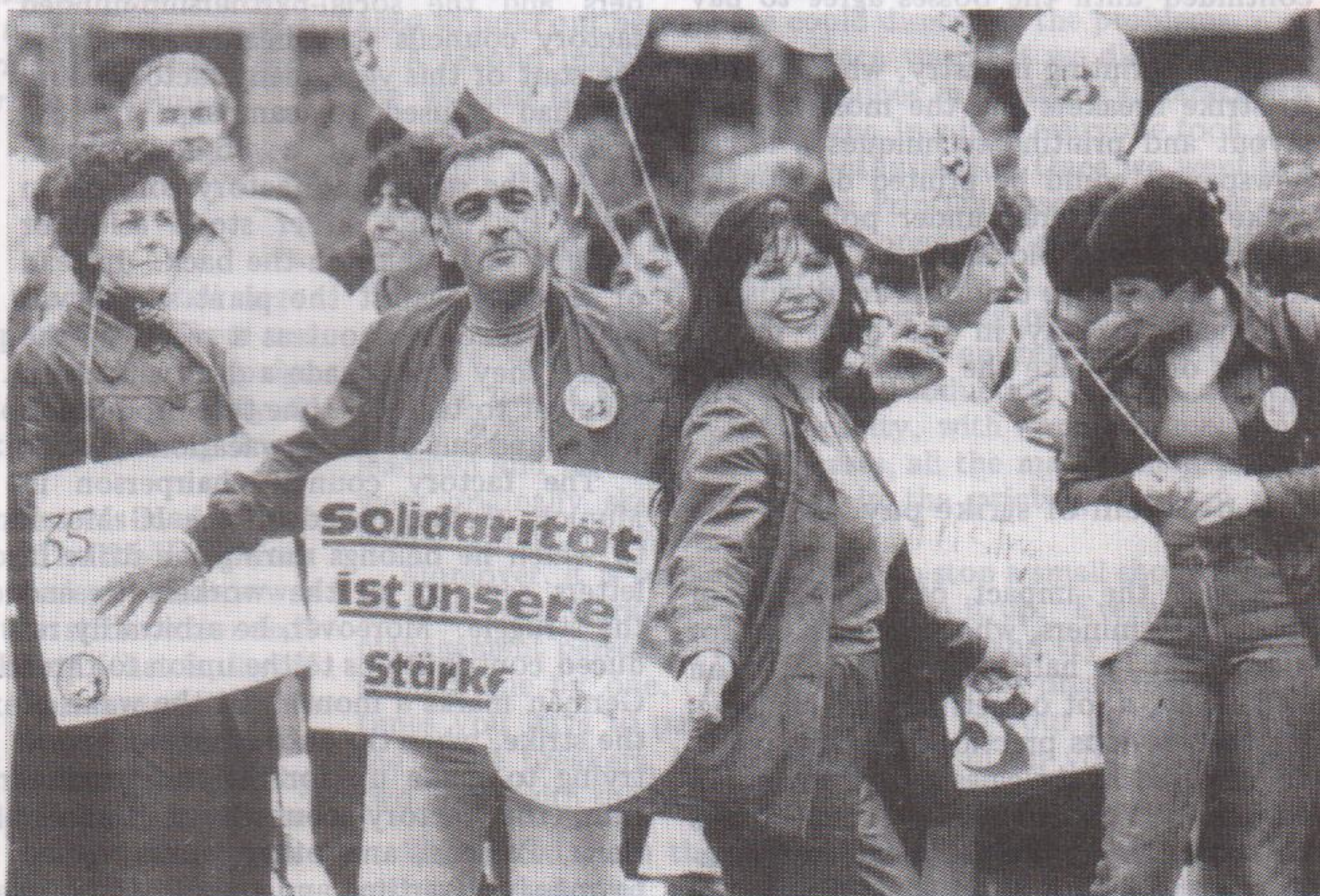
'Solidarity is our strength' say supporters of the 35-hour week

On June 6, Chancellor Kohl suddenly declared that shortening the workweek should not be a taboo. And at the same time, his minister of labor, Bluem, convinced Gesamtmetall not to go ahead with the extension of the lockout to districts where there were no strikes that it had already decided on. At the end of July, Count Lambsdorff, who as minister of the economy had steered the course toward confrontation with the unions, had to resign, because he was charged with corruption in office.