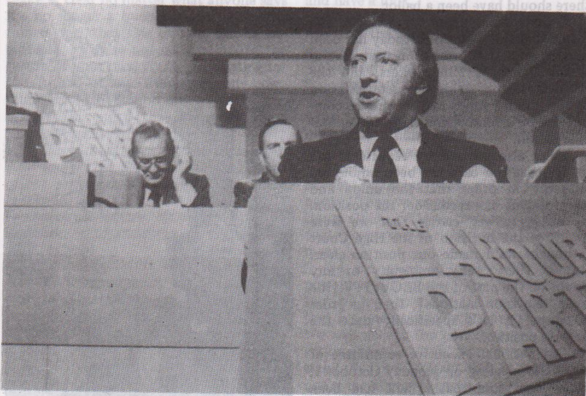
Arthur Scargill addresses Labour Party conference