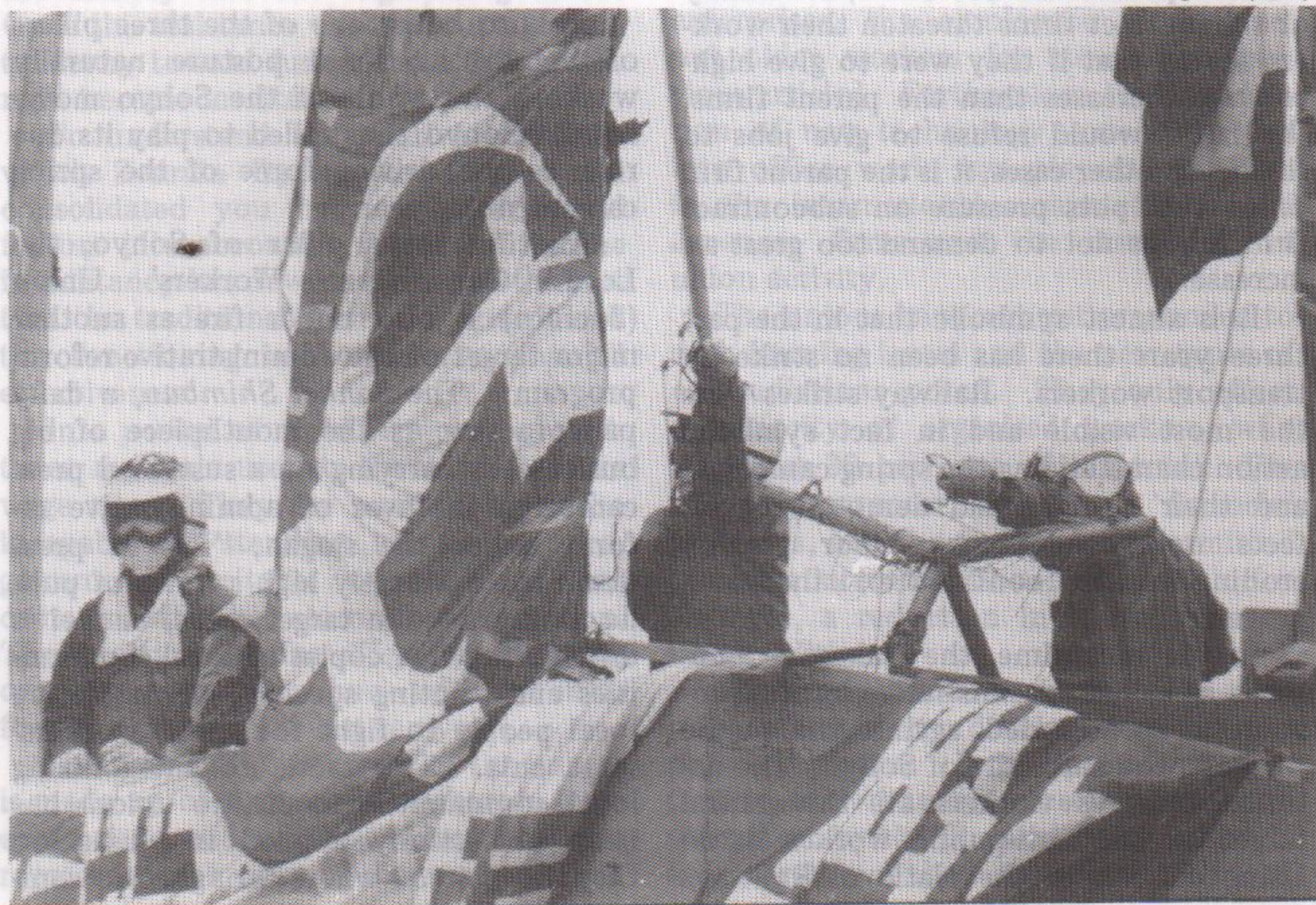
Protest at Narita airport (DR)

This year's spring labor campaign was wound up after obtaining a wage increase of 5 per cent as against 7 per cent de-