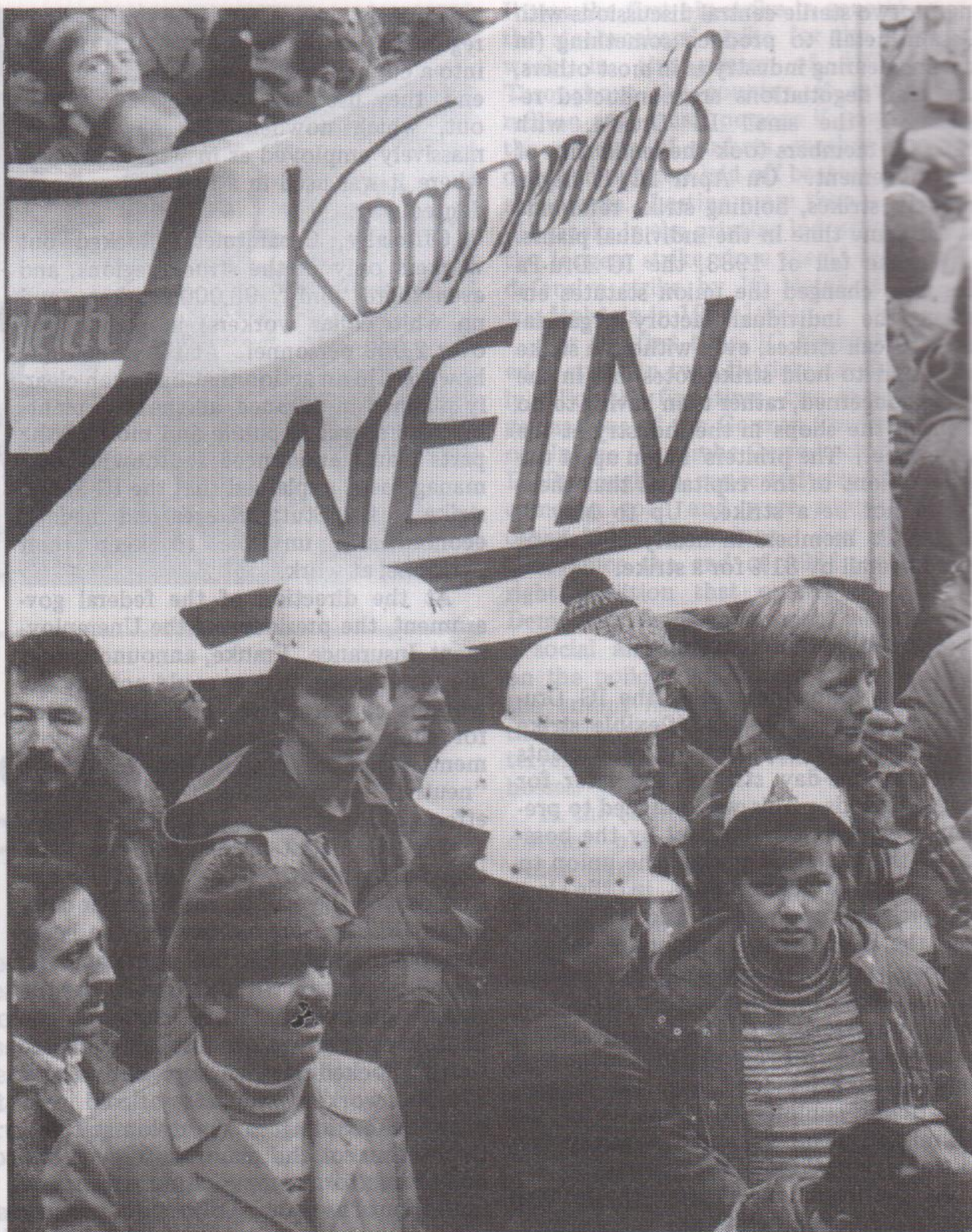
Duisburg steel workers say 'No compromise'.

Particularly negative was the acceptance of the principle that henceforth in the engineering industry the workweek is to be reckoned as an average. As long as the average workweek for the workforce in a factory is 38.5 hours, a part of the workers might work 37 hours, another