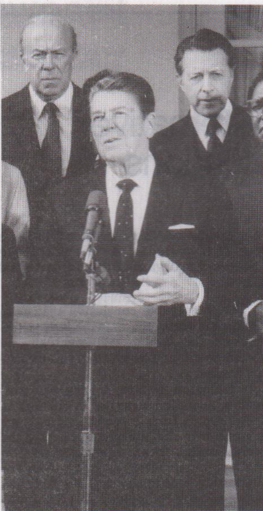
Ronald Reagan

Since the Sandinista government came to power five years ago in July, 1979, it has lowered unemployment, distributed land to the peasants, drastically reduced illiteracy, and taken steps to upgrade the status of women, Indians and Blacks. All this has been done in an impoverished country under tremendous US military, economic and political pressure.