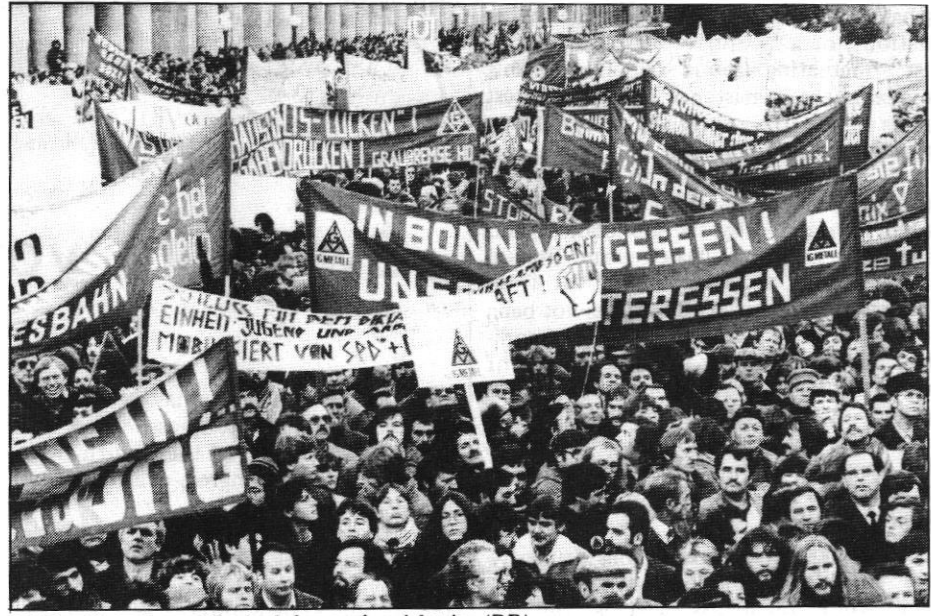
IG-Metall workers strike in defence of social gains (DR)

1) A new international division of labor, with the transfer of the plants of relatively labor intensive industries to semicolonial and semi-industrialized dependent countries (10). The creation of