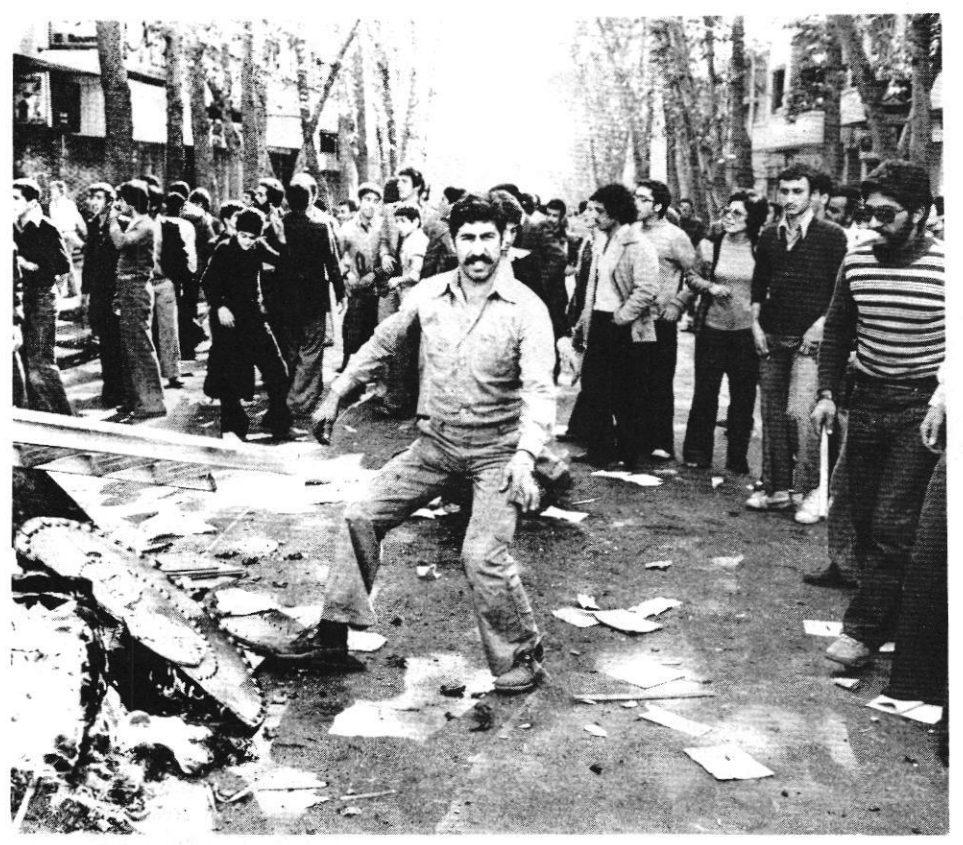
Iranian masses destroy all symbols of Shah's regime