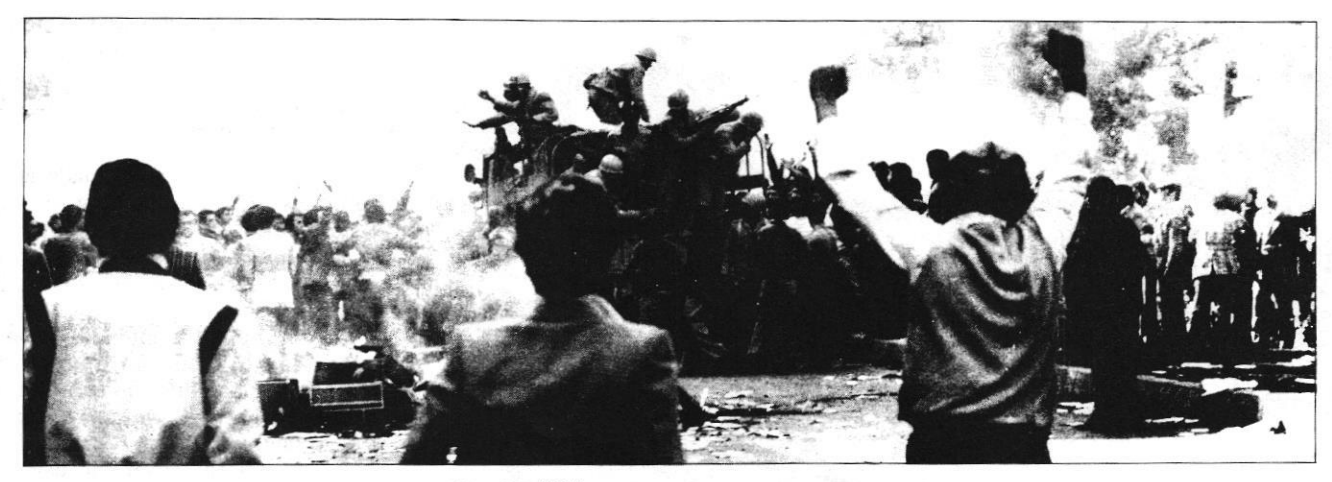
Popular support for Iranian army against Iraq invasion (DR)

mount a revolutionary crusade against the surrounding Arab monarchies.