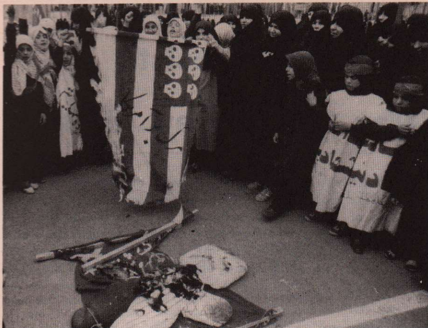
Burning the US, Israeli and Soviet flags on Woman's Day in Tehran April 10, 1984

pasdaran attacked the demonstration, arresting many workers (three were later executed). They dispersed the crowd. The regime was, nevertheless, forced to back down and withdraw its plans.