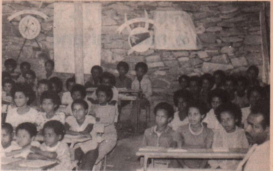
«There are now 104 schools with 15,000 students ...» (DR)

In terms of land reform the peasantry are divided into three types; the poor, the middle and the rich peasants. For our political education programme, and for our guiding work, we work towards the seizure of political power by the poorest sections of the peasantry, in alliance with the middle peasantry. Of course the rich