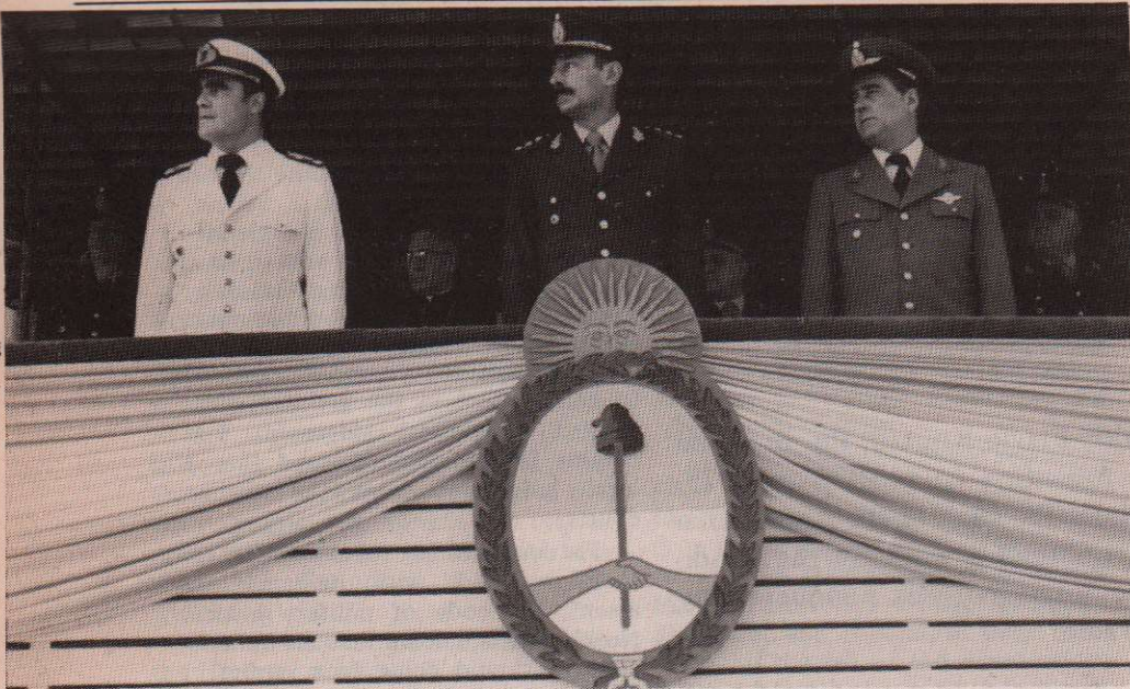
General Videla and his acolytes, during the period of the dictatorship

an obligation to grant an amnesty for them, which would have upset the military.