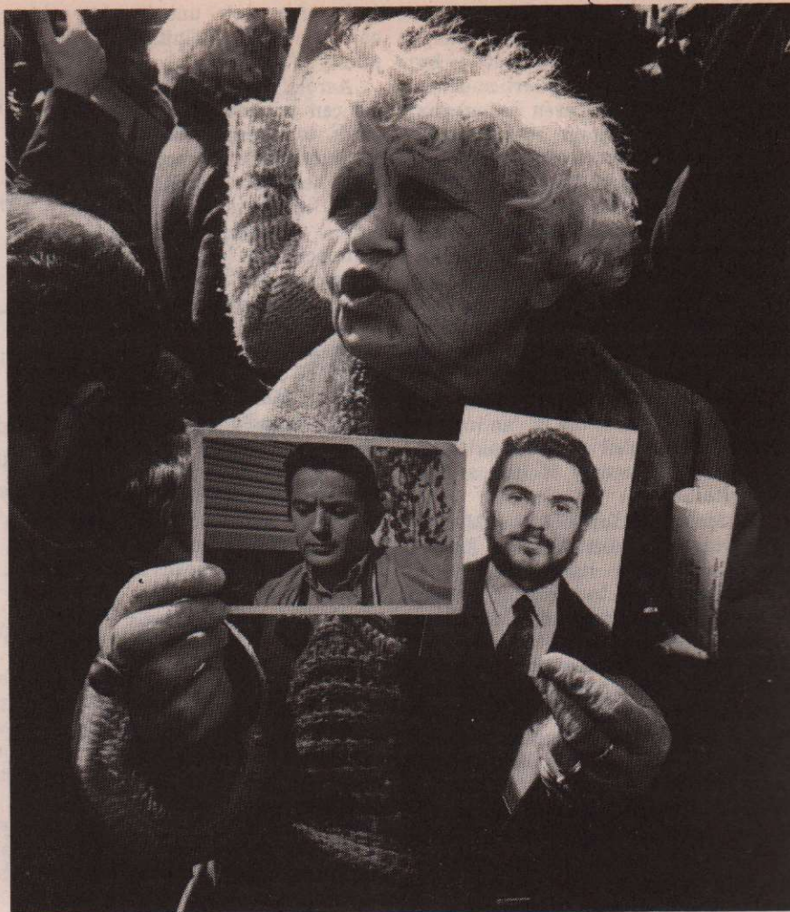
Demonstration outside the Argentine embassy in Paris

The press coverage of the trials in Argentina, which was very extensive, did not go beyond the limits set by the politicians in this respect. But the succession of evidence gradually raised the question of the responsibility of the armed forces as a whole and the press began to limit and restrict more and more the information coming out on this subject and began to interpret the different testimonies according to its own viewpoint. So, for example, the daily paper of the reactionary oligarchy, the Buenos Aires La Nación , attempted to distort the courageous statements of several witnesses who sometimes found themselves being accused of collaboration with their own torturers in such headlines as 'Yet another case of collaboration with subversive elements'. The newspaper Clarín which presents the views of the slightly more enlightened bourgeoisie in Buenos Aires stopped publishing anything on the trial after a while and only gave out limited and partial information. There were exceptions to all this, like El Periodista , a progressive