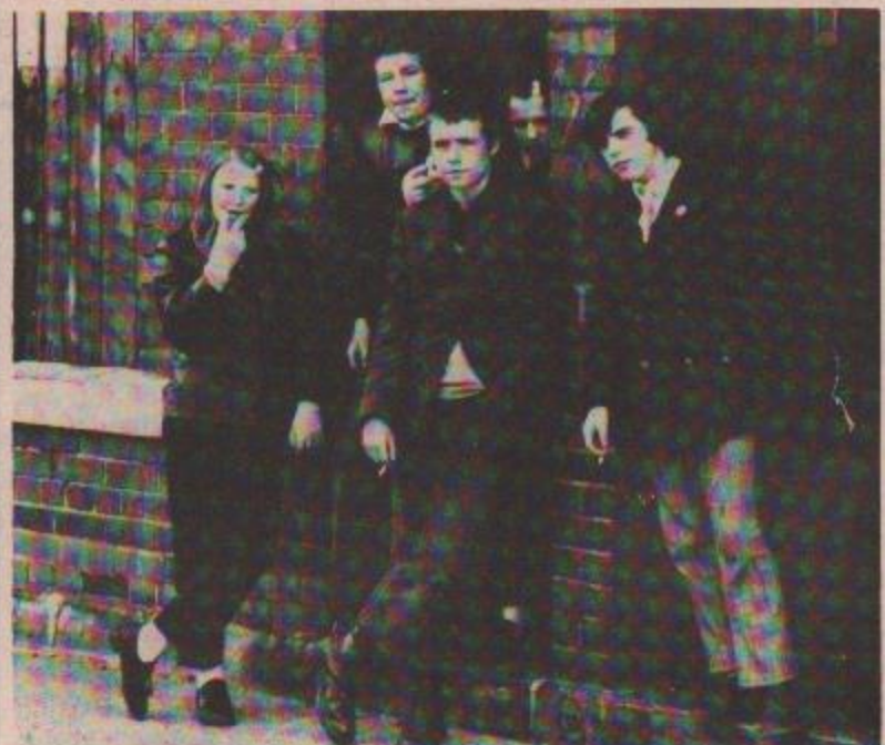
Unemployed youth in the north east: Common Market will bring more problems.

The report accused police of treating everyone severely and using excessive force when problems arose.