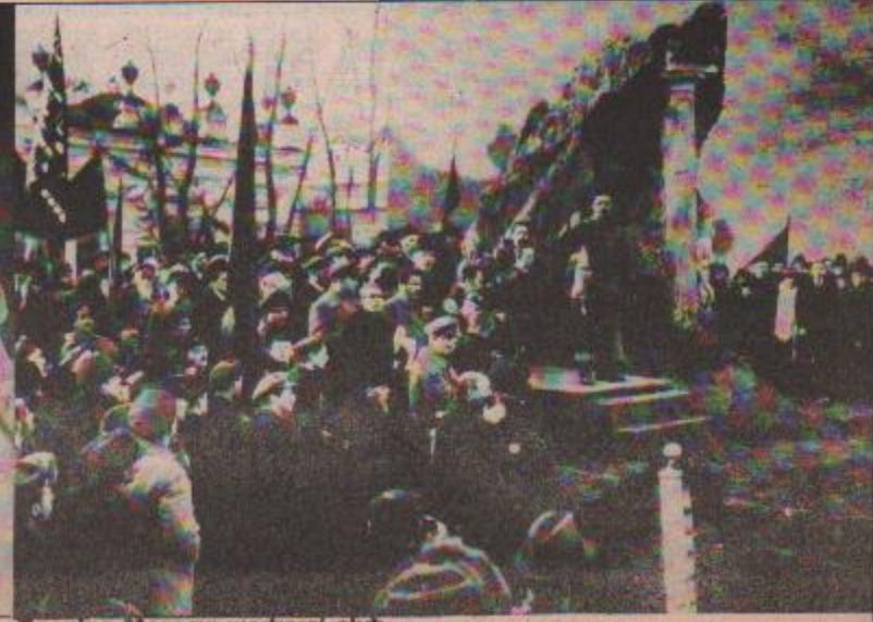
Opening Moscow workers' club