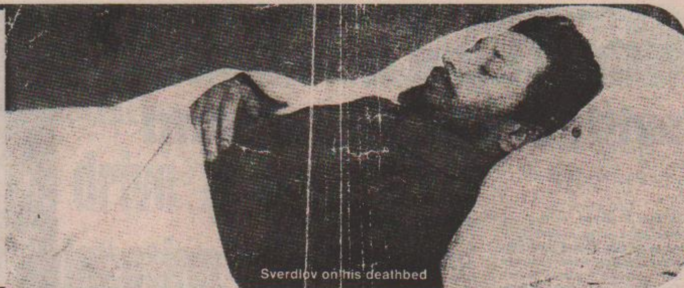
Sverdlov on his deathbed

Sverdlov, March 18, 1919 (Newspaper Report)