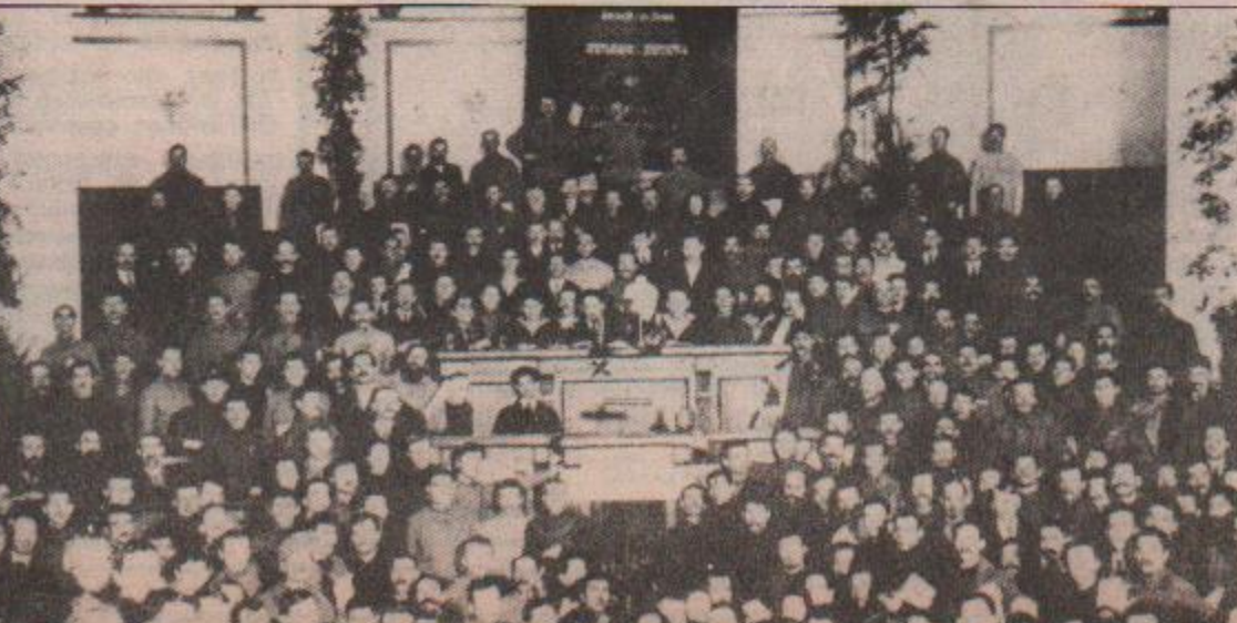
Soviet congress chairman, Sverdlov (x), declares end of war