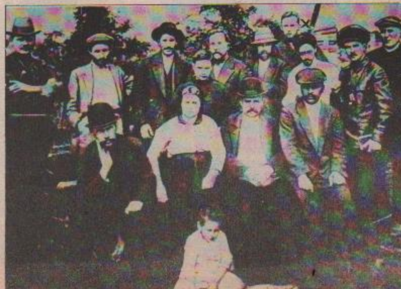
En route (x) with party including Kamenev and Stalin to exile

Speech by V. I. Lenin in... at a special session o... Executive Committee of t