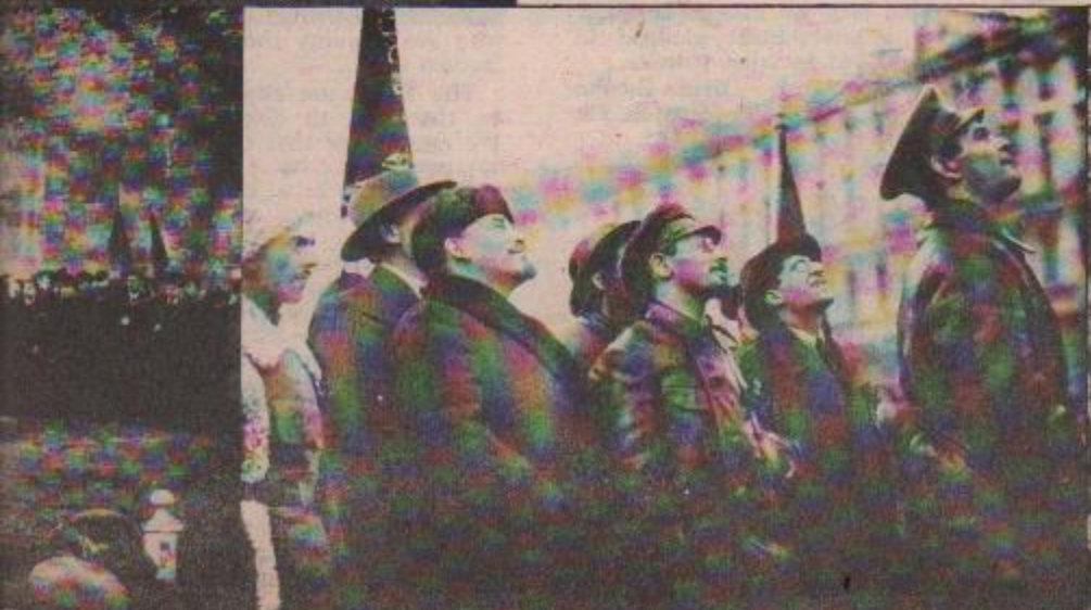
With Lenin at unveiling of Marx-Engels memorial

The memory of Comrade Yakov Sverdlov will serve not only as a permanent symbol of the revolutionary's devotion to his cause and as the model of how to combine a practical sober mind, practical skill, close contact with the masses and ability to guide them; it is also a pledge that ever-growing numbers of proletarians, guided by these examples, will march forward to the complete victory of the world communist revolution.