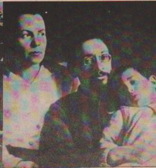
With his family