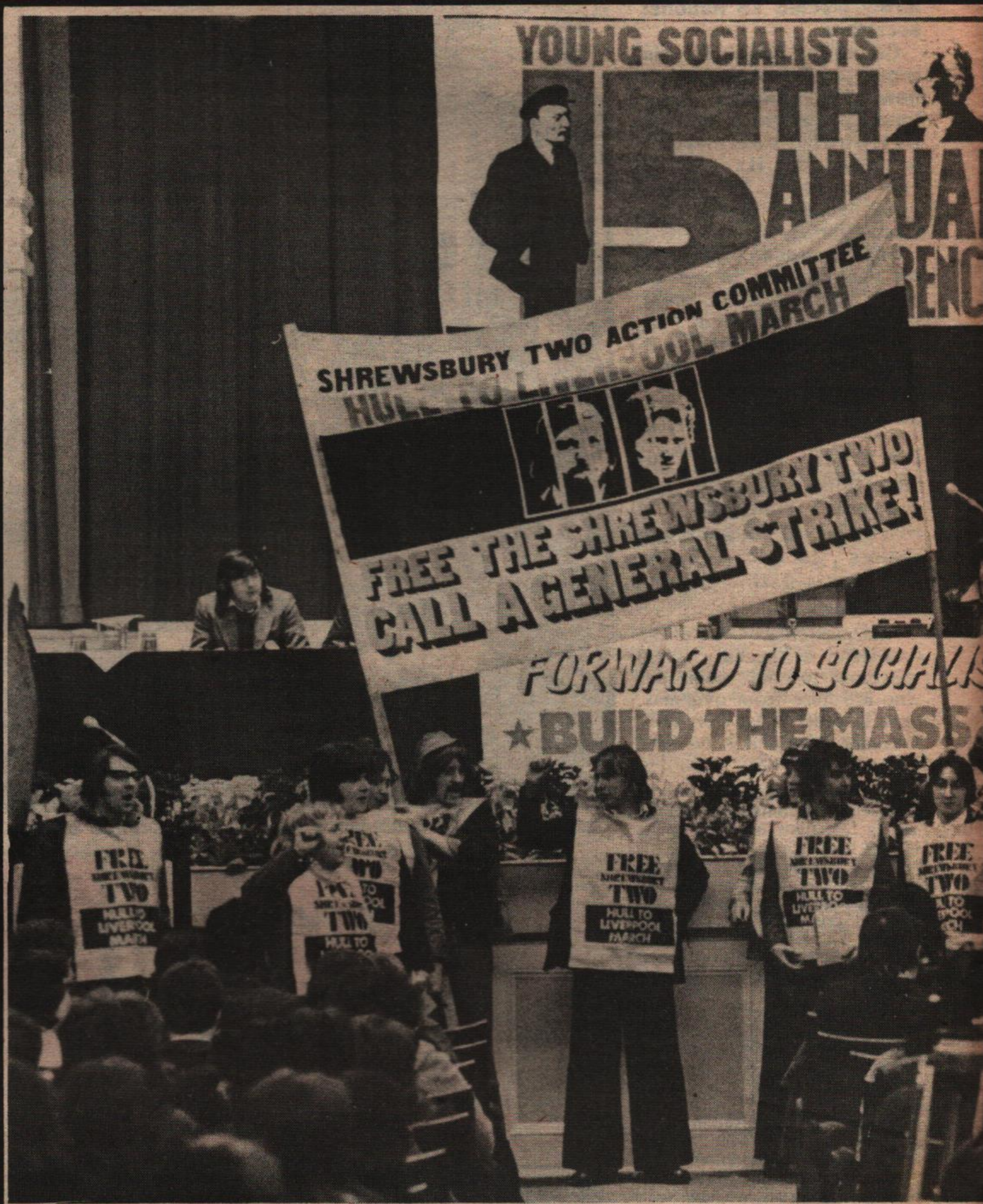
The marchers arrive at the Spa, Scarborough, to a tumultuous reception

So now I would like to move the main resolution 'Youth and Recession' which is before you and thank you for the way you have listened to this report.