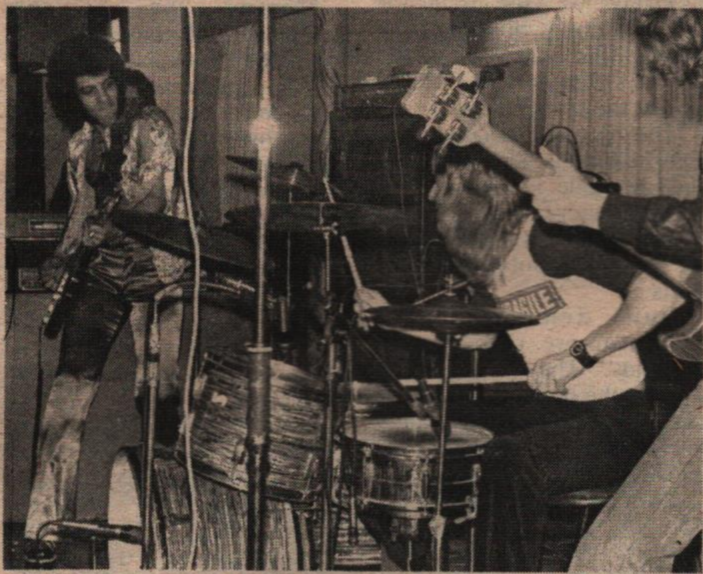
Above: Mungo Jerry; below: part of their enthusiastic audience.

Sri Lanka (Ceylon) Young Socialists sent a telegram of greetings wishing every success to the YS 15th Annual Conference.