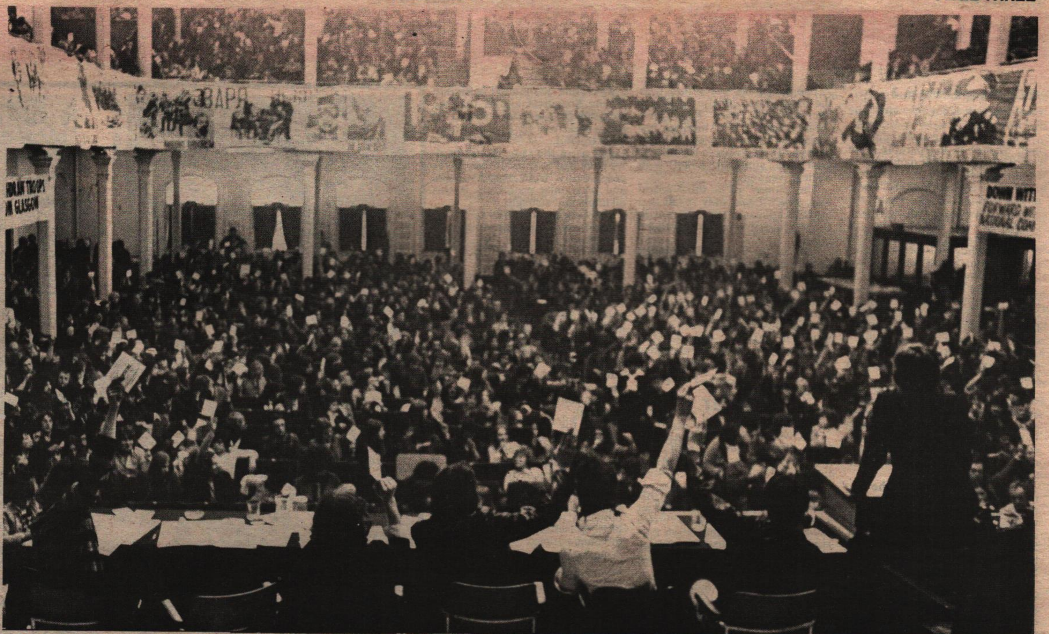
Delegates at the conference vote for acceptance of the report

The revisionists confined themselves to protest politics, in which pacifists and muddle-heads were brought forward in place of