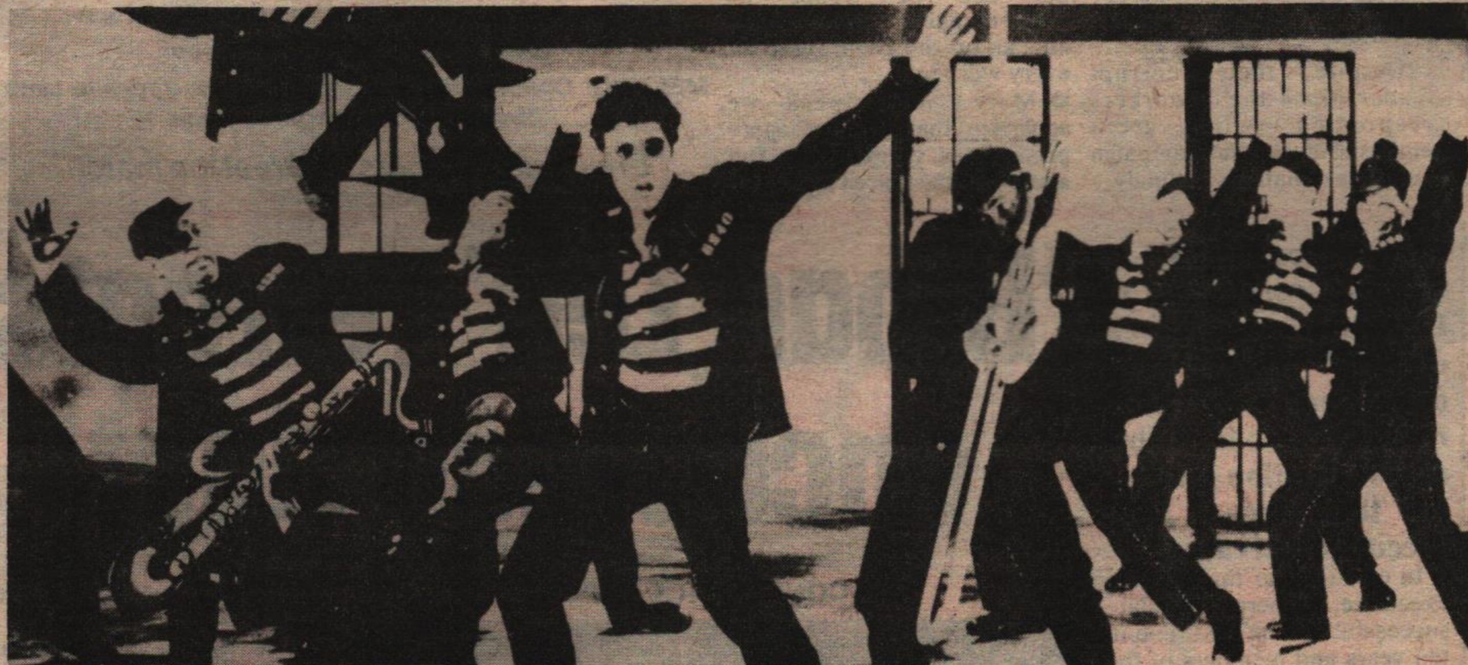
Elvis Presley in 'Jailhouse Rock'

almost impossible one, even during the boom period.