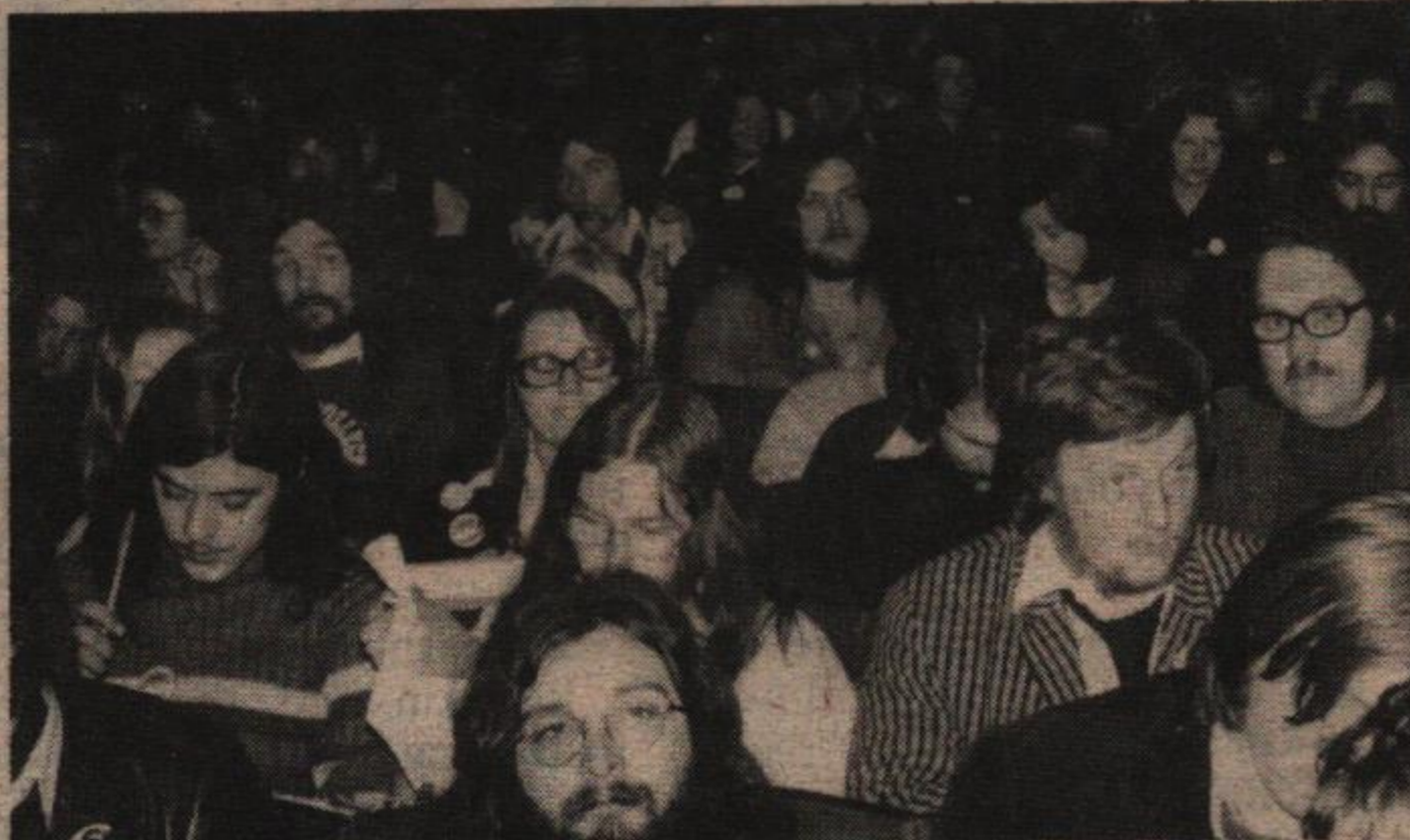
Last week's NUS conference

many second-preference votes from these 'liberal' elements.