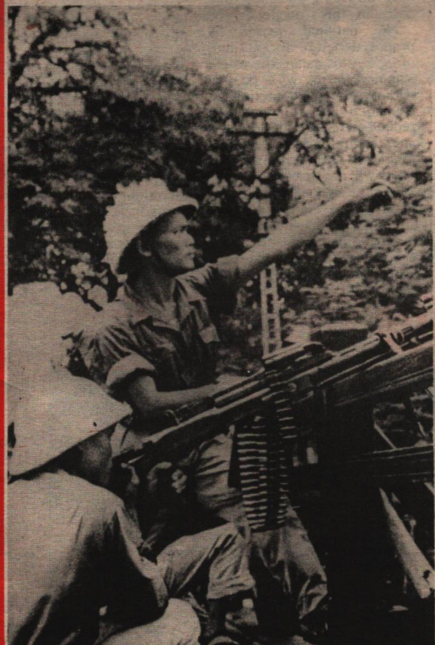
Victory to the Indo-Chinese revolution!