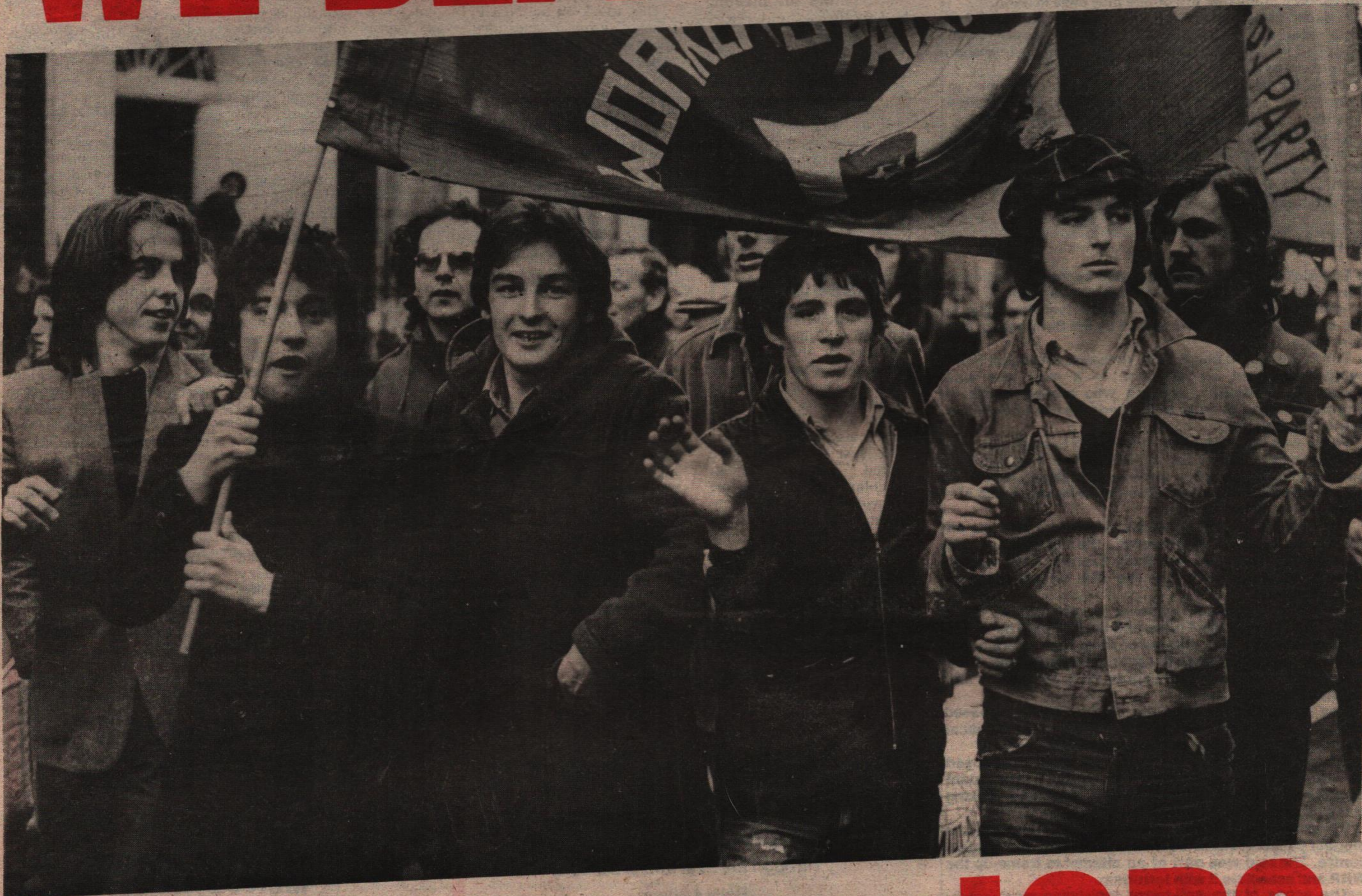
Jobless youth from Liverpool demonstrating against unemployment on the 25,000 strong march through London last week called by the north west TUC. They were part of a big delegation brought by the Young Socialists from Merseyside. The fight for the Right to Work now faces hundreds of thousands of young and older workers and students as the capitalist slump deepens. The London area Young Socialists will be holding a demonstration for the Right to Work on January 3—advance details are on page 2.