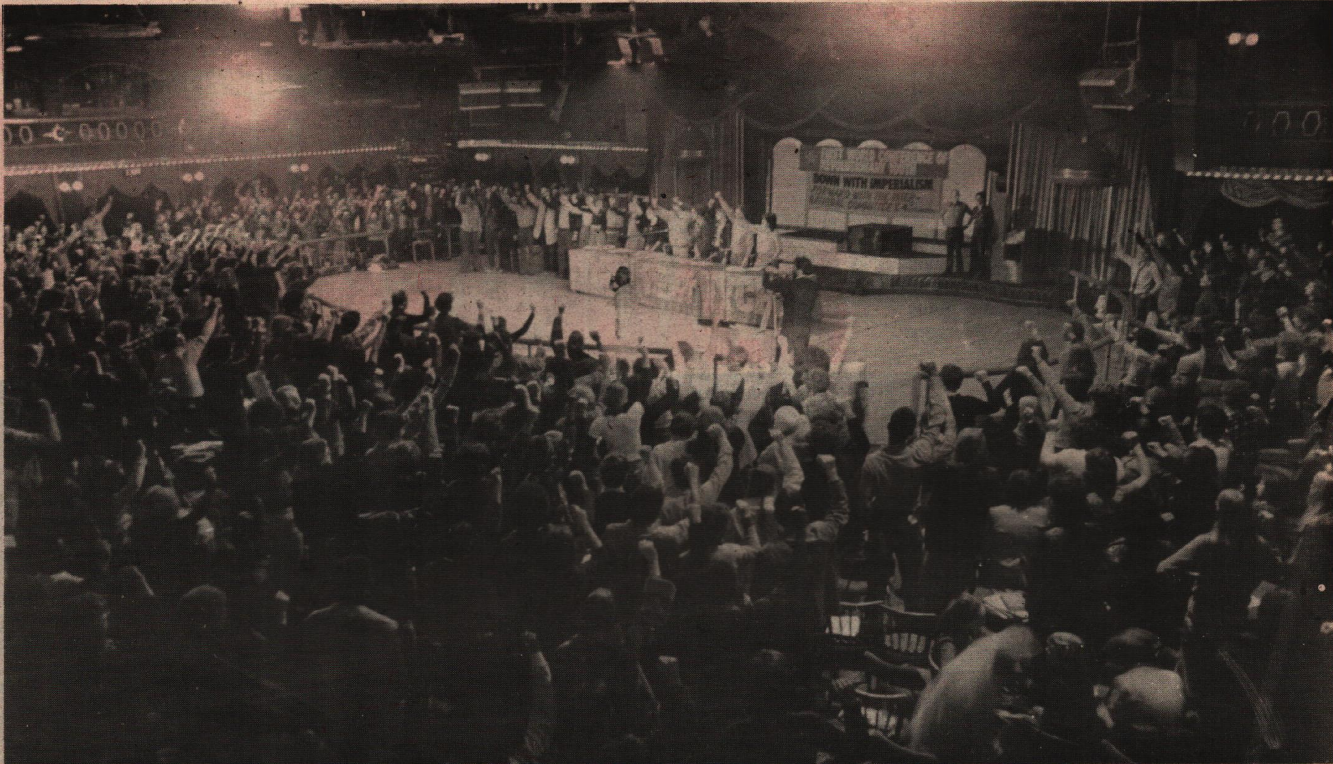
Delegates singing 'The Internationale' as the final conference session ended