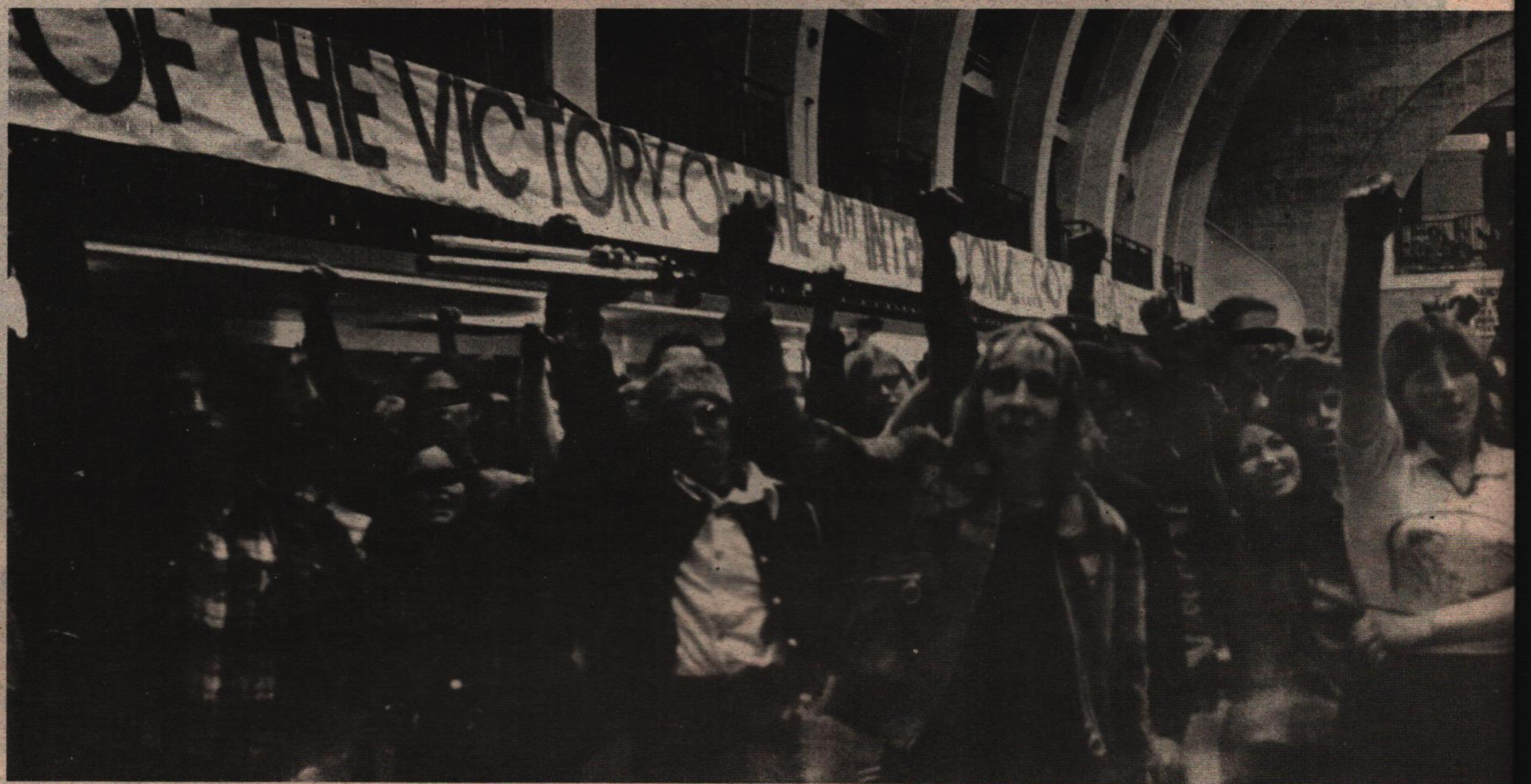
Audience at the International Conference sing 'The Internationale'

formed over the blood of tens of thousands of workers and maintained by savage repression which it has increased through so-called anti-terror laws.