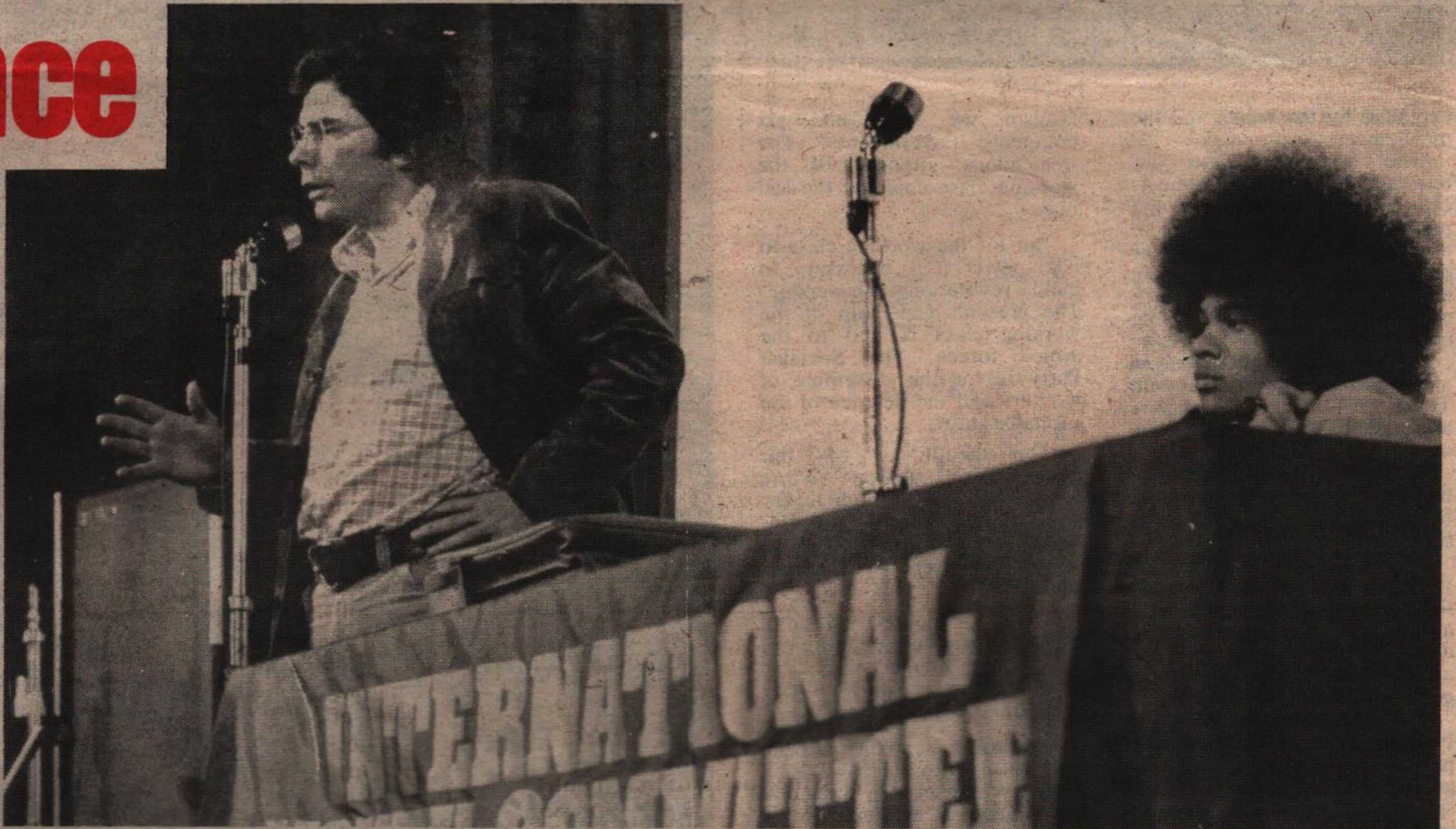
Former CIA agent Philip Agee addressed the conference on Thursday night exposing the agency's operations in west Europe.

'But youth and workers are fighting back and raised $50,000 to send a delegation of 44 youth to the International Youth Conference of the Fourth International to train a leadership that will fight for the World October in Australia.'