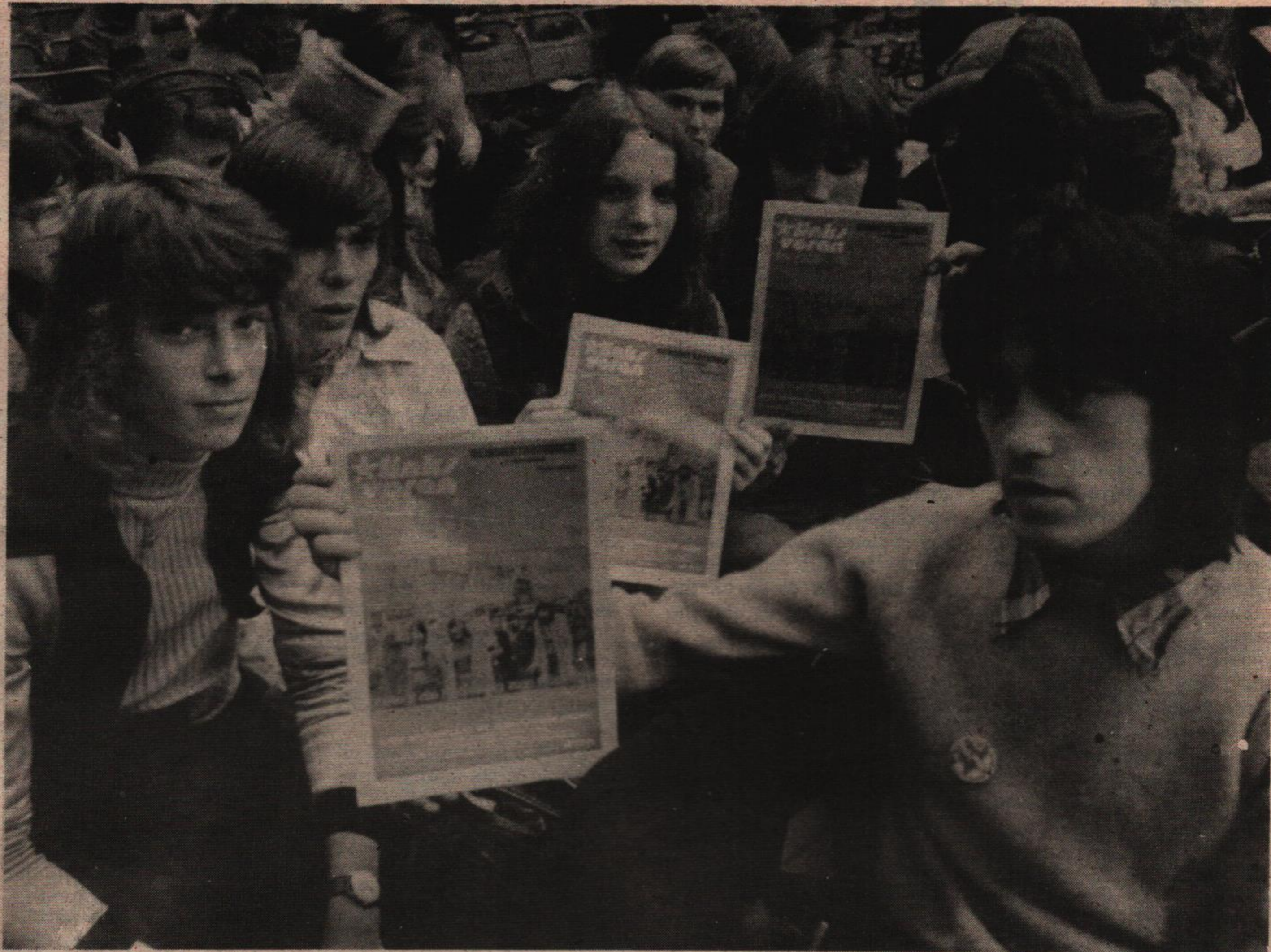
Above: German delegates at the conference with copies of their new paper 'Links Voran'; below: a section of the British delegation in discussion