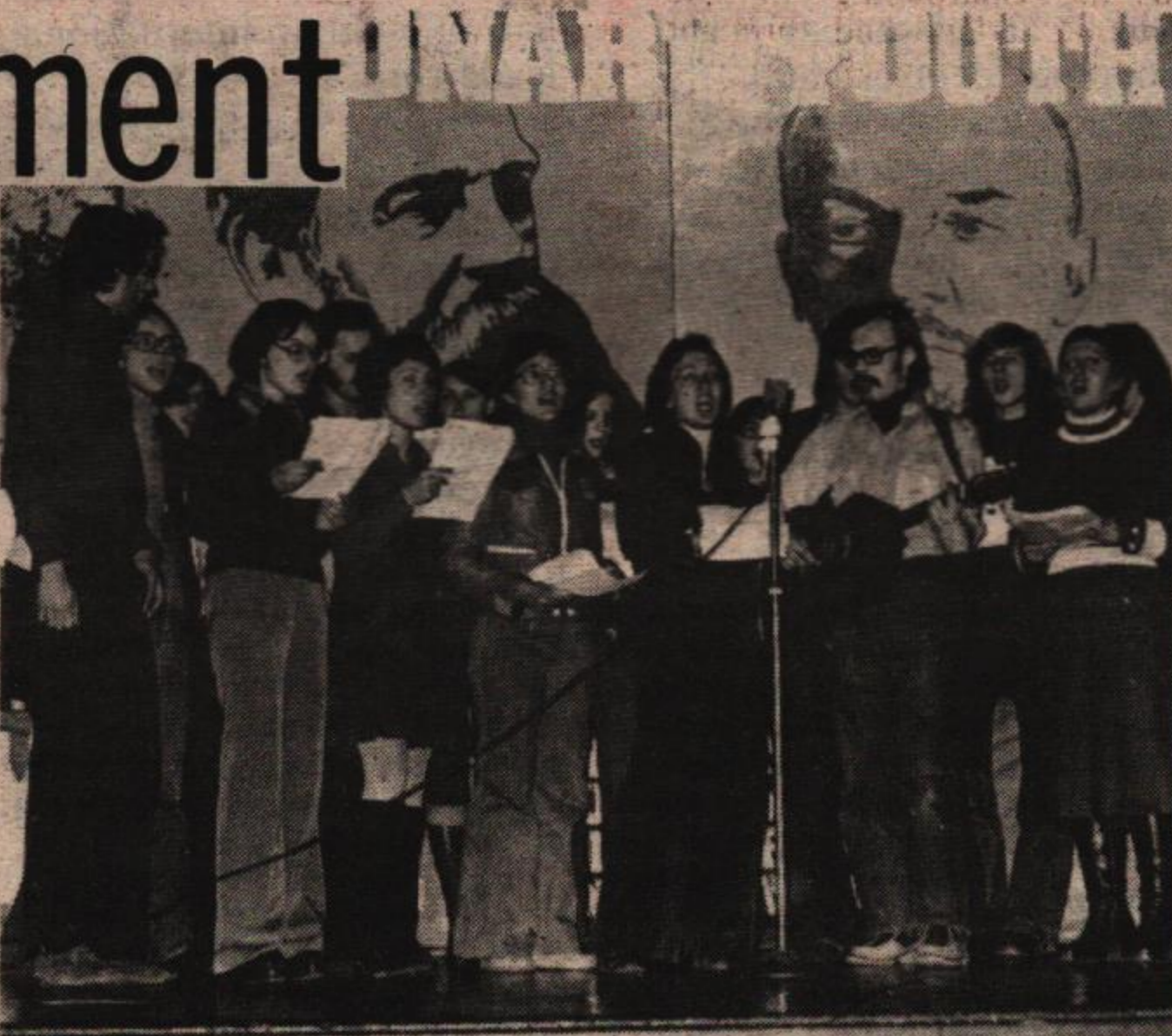
German delegates perform at the talent contest

The evening ended when the Spanish comrades led the singing of the 'Internationale' from the stage.