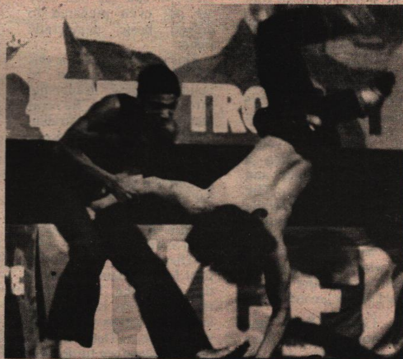
American YS ju-jitsu routine