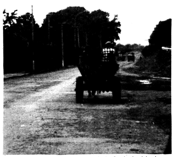
A Romany family on the move on the Soviet-Czechoslovak border

The dispersal policy was thus part of a solution to the shortage of unskilled labour in one part of the Republic, and to unemployment in another. The proposed solution to this problem—forced transfer of a minority without legal rights—is