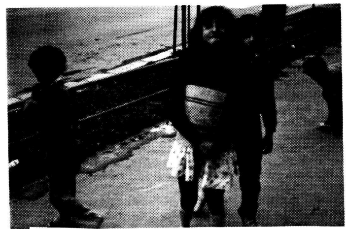
Romany children making fun of authority in Slovakia ...

of the other members. Some requests were turned down even when all the other members of the commission agreed that a petitioner did not belong on the list. This happened when the VB representative insisted that their inclusion in the list was 'lawful', or asserted that the petitioner allowed people of gypsy origin from other districts to come and stay overnight, or that one of their children had been playing truant.