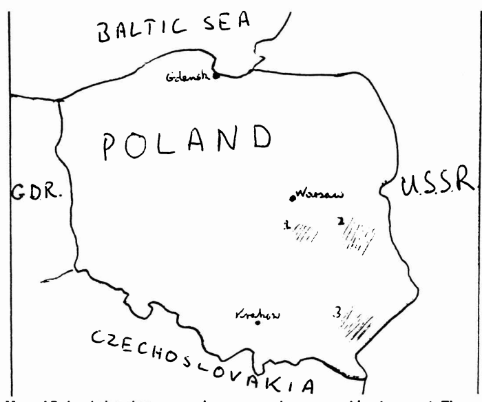
Map of Poland showing areas where peasant movement is strongest. The numbered areas are: 1. Grójec. 2. Lublin. 3. Rzeszów.

1. 18 months ago the commune administration in Kamień, through its leader Józef Czubat, started to expropriate farmers in our village. The expropriation was connected with the decision to build a base of supplies of Nowy Kamień. Since we do not accept these expropriations, the commune administration is harassing us in various ways. We are sacked from state-owned enterprises and punished with fines for farming our own land and reaping the harvest. These fines are deducted from the wages of the peasant-workers (i.e., peasants employed in factories, etc. who do not farm their own land full time but nevertheless have their