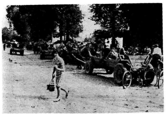
Peasant carts parked outside a church on Sunday in the Radom region

Despite the sense of solidarity and involvement of our people, the authorities have not been able to establish contacts and cooperation with us. All we hear from them are ceaseless complaints and grumblings about the farmers' attitude. It is painful to see how those who have advanced even a little can become undemocratic towards the rest of the people. We have very good legislation in the field of agriculture. Many government decisions concerning the country should restore the farmers' sense of dignity and improve their social standing. Unfortunately some links in our administration are so sluggish that the farmer still believes that what is written or said in the meetings is untrue. Undoubtedly there are not enough people who would serve the villages with devotion, although many of them are well paid with money earned by farmers. This inefficiency is clearly seen in the way villages are supplied at