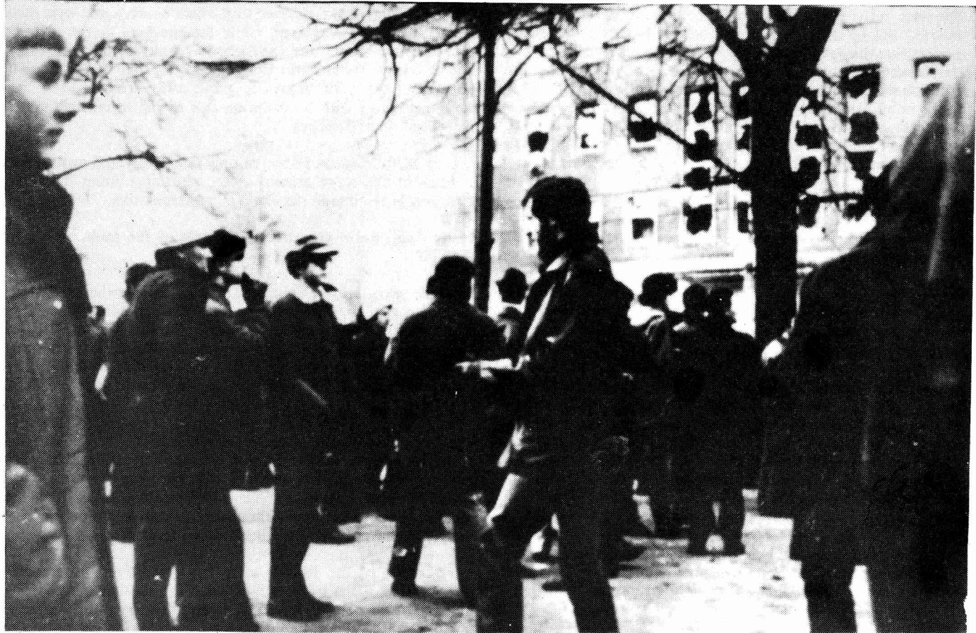
Szczecin demonstrators outside sacked Party building

Of course, this kind of thing happened to all the workers who were active in some way during the revolt. Some were offered jobs as foremen and began to be sucked into the hierarchy; others were offered better paid jobs in factories away from the shipyards; still others were simply moved into different departments. But on the whole there were not many people who accepted promotions or transfers and among those who did, many continued with their militant activities.