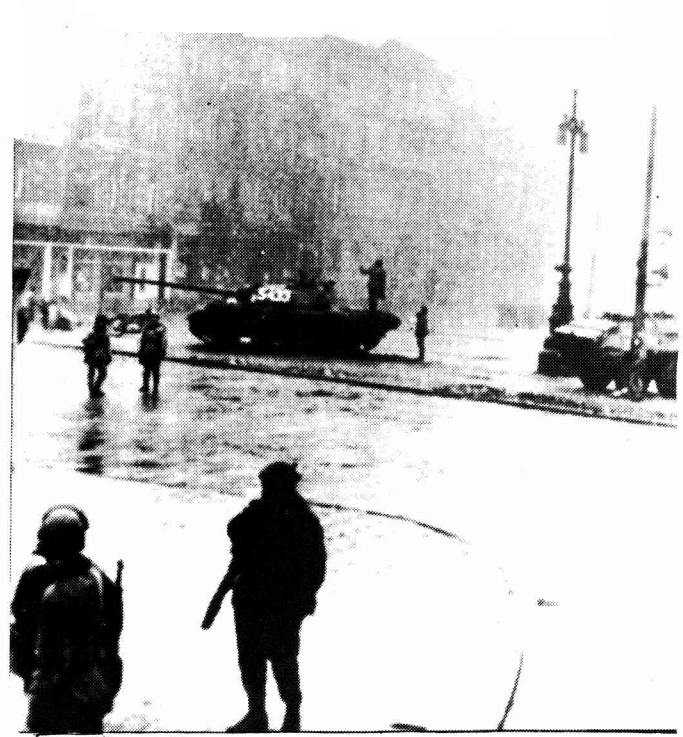
Polish Army taking over central Szczecin Dec. 1970

In 1970-71 in Szczecin, Lodz and other towns the trade unions were viewed very critically by the workers, as was the Party, and their buildings were attacked and burnt. The various functionaries just disappeared together with the local Party bureaucrats. In the shipyard, the trade union organisation and the Party committee just evaporated overnight. Before the revolt, out of 12,000 workers in the shipyards there were 2,000 Party members. During the revolt you would have been hard put to find 20 people prepared to admit to membership of the Party. There were a few who said they workers believed in Marxist Leninist ideology, and there were a couple of Party members in the strike committee. In the elected 5-person departmental committees there were Party members who had to some extent been critical of the Party's policies and, by electing them the workers showed some confidence in them. But the vast majority of those elected were non-Party members.