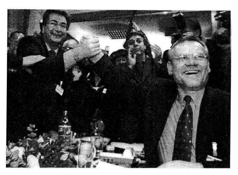
Croatia's prime minister Račan (R)

future development. The country today is in the worst possible economic situation and is politically isolated from the outside world.