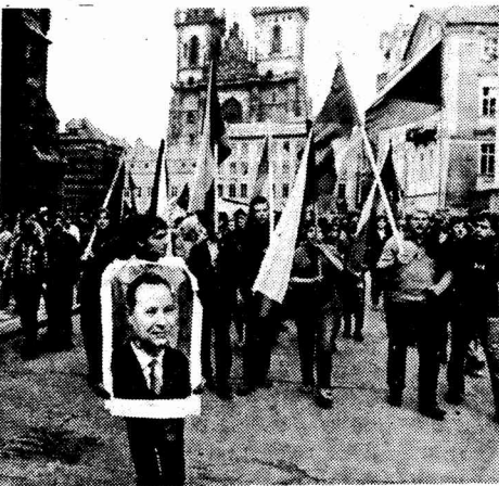
1968. Their union, the CSUV, closed down by the Stalinists in 1969, is still recognised by the NUS.

If the experience of high levels of youth unemployment has encouraged the FCS to argue for student particularism and special case-ism, it has allowed other students to realise the similarity of their conditions with young people at large. This creates the possibility of a wider unity between students and youth. We believe that this should be extended to questions related to Eastern Europe.