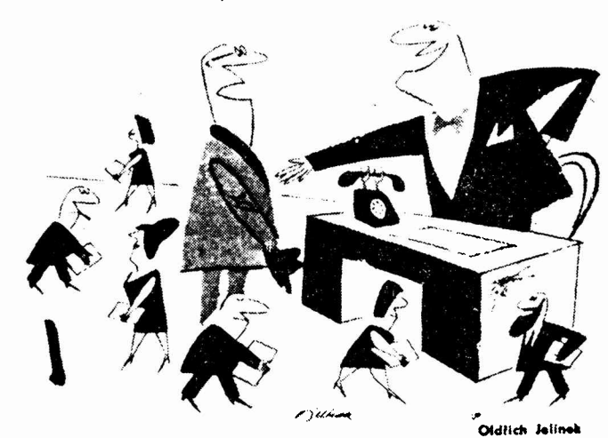
Czech satirical cartoon from the magazine Dikobraz , 13 October 1966. The caption reads: "If you want to work with us, you will have to adjust."

The chairmen of lower trade-union organizations go on to elect territorial trade unions, and so on.