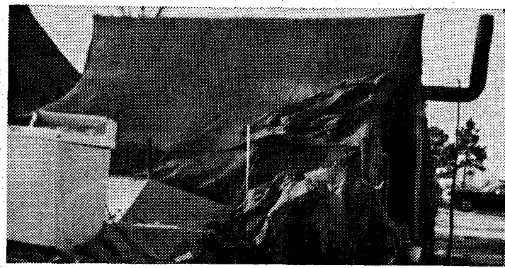
TENT CITY—symbol of Negroes' fight for rights in southern states.