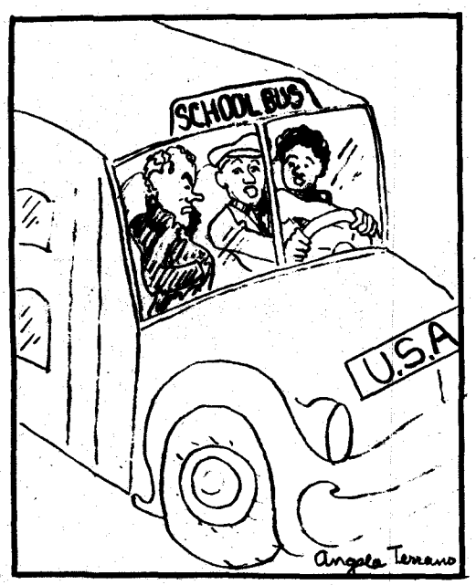
"Take us back to 1954, I'm hijacking this bus."