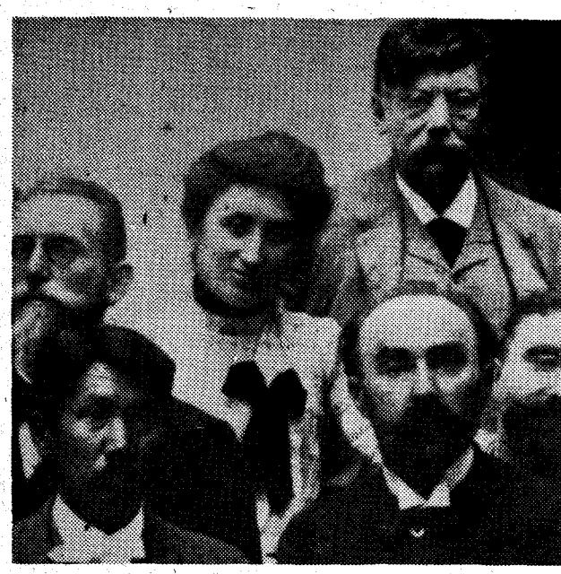
Rosa Luxemburg, with Japanese socialist Sen Katayama and Russian Georg Plekhanov at 1904 Amsterdam Congress of the International, where they demonstrated international solidarity against the Russo-Japanese war.