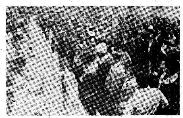
Hundreds jam Detroit unemployment office.

At the very beginning of the '70s, both the Black masses and the Black middle class understood the meaning of "Black Power." It meant then, that the Black masses had given the Civil Rights Movement the direction and method of struggle whereby Blacks were united in a determined effort to turn the country around in a radical way, for permanent change!