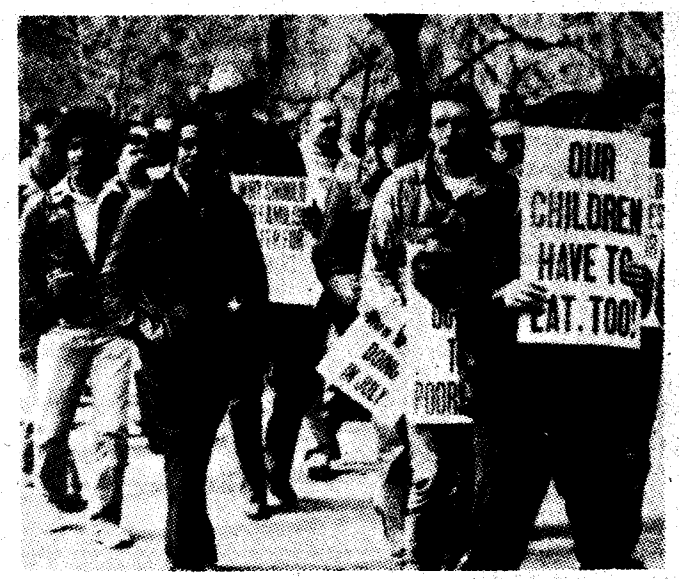
N.Y. transit workers picket during 11-day strike.

"We are on strike because we took a beating in the last two contracts. We kept the city afloat, and now we have to draw the line here. Four years ago we got only 62 cents for cost-of-living. Then last contract we