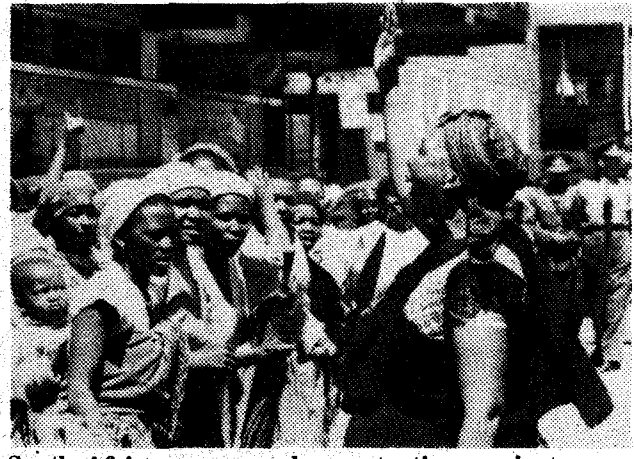
South African women demonstrating against apartheid's Pass laws (1958)

JUST AS THE AFRICAN DIASPORA meant not only South Africa but South USA, and Black meant not only Africa — South, West, East and North — but also Latin America, including the Caribbean, so Black Consciousness, plunging into the struggle for freedom from Western imperialism did not stop at the economic level anymore than did the East European freedom fighters struggling against Russian totalitarianism calling itself Communism. By no means did this signify a forgetting of the economic impoverishment of the masses; while man does not live by bread alone, he must have bread to live.