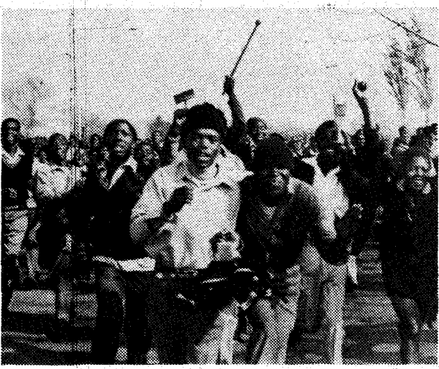
Soweto youth in rebellion (1976)

that murdered Maurice Bishop came from his co-leaders in the Party, led by Coard and Austin. Nor can anyone skip over the infantilism of making the point of debate a question of Maximum Leader vs. collective leadership and "leadership method," instead of the dialectics of revolution and the question of which road to take out of the crisis in their country, a crisis determined by the myriad world crises.