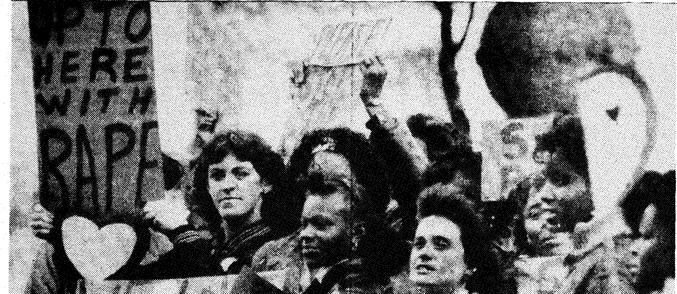
Anti-rape demonstrators gather in Detroit's Kennedy-Square on Feb. 14.