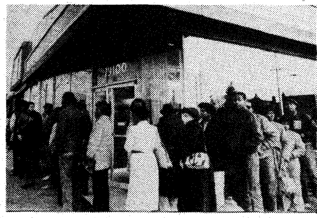
Nearly 500 people waited in line to apply for 20 minimumwage jobs at a Detroit store not opening till Spring.

You wonder what is going to happen to our pension fund, our union, our job, if things go on this way. - CTA worker