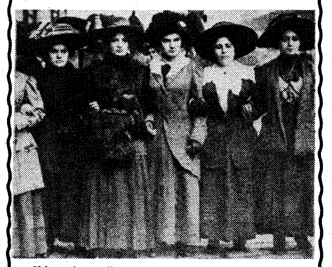
Shirtwaist strikers marching on New York's City Hall in the "Uprising of the 20,000" in 1909.

The month of March is rich in women's history. March 5 marks the birth in 1871 of the revolutionary Rosa Luxemburg. March 8 is the celebration of International Women's Day, which was first proposed in 1910 as a tribute to the struggles of American women garment workers, and March 25, 1911 was the date of the infamous Triangle Shirtwaist Fire in which 146 garment workers were killed.