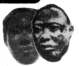
by Lou Turner

The perfecting of the means of production inevitably brings about the camouflage of the techniques by which man is exploited, hence the forms of racism...At this stage racism no longer dares to appear without dis-–Frantz Fanon