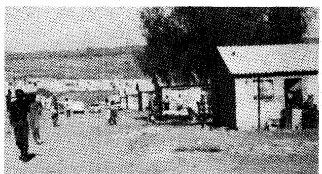
Township in Tembisa, South Africa

Tembisa, South Africa—We live in a terrifying township in Tembisa. We women-the most participants in this action-established a new community of sharing the municipality hostel houses with the hostel inmates. We collected our property and stayed with them in a memory of owning our own houses. This was to challenge the government's rule.