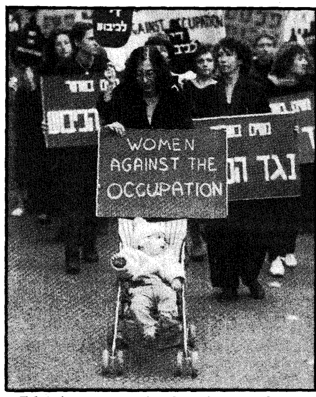
Tel Aviv protest against brutal army policies.

U.S. plans to open a "substantive dialogue" with the PLO (Palestine Liberation Organization) were announced after Chairman Yasir Arafat successfully formulated a renunciation of terrorism and a recognition of Israel's right to exist. The U.S. decision shook up Israeli rulers who, unable to form a majority government since last fall's elections, quickly put together yet one more repressive Likud-Labor coalition.