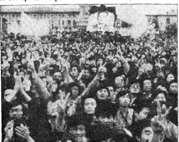
Tiananmen Square during mass protests of Spring, 1989

The Chinese authorities accused the rebels of aiming to set up an independent "Islamic state"; it is true that