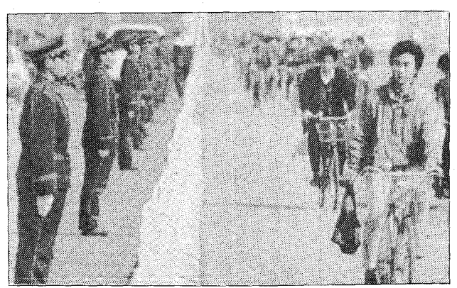
Police guard Tiananmen Square to prevent demonstrations Spring, 1990