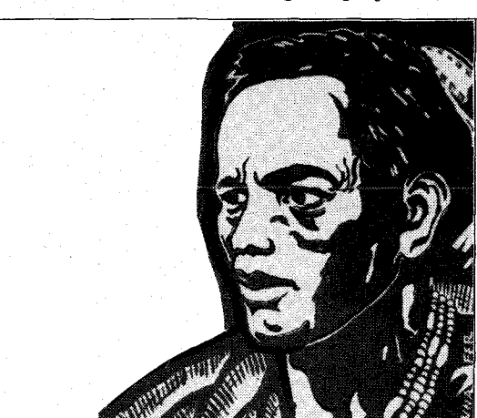
Macling Dulag, Kalinga tribal leader who led the struggle against the Chico River Dam project and was murdered by the military on April 24, 1980.

• In the battle for the Chico River a series of four dams was planned which would have uprooted 100,000 Bontok and Kalinga tribal peoples from their ancestral lands. This huge hydroelectric project was conceived as a means of harnessing the power of the Chico River to provide for the energy needs of the mines and the urban centers like Manila with their new foreign-dominated corporations, gearing up for what was hoped to be the next "economic miracle" in Asia. The Bontok and Kalinga organized actions against the National Power Corporation reaching out to other anti-government forces. By 1981, a year after the murder of Macliing Dulag, the indigenous leader of the Kalinga, Marcos was forced to announce he was abandoning the project.