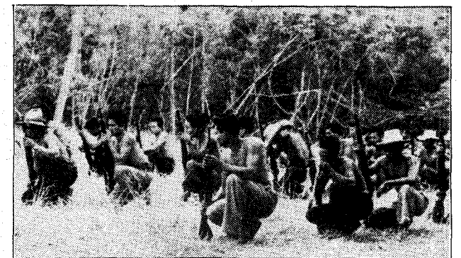
Huk insurgents at a training camp in central

The Hukbalahap was a self-organized peasant movement which grew from around 2,700 armed resistance fighters in 1942 to around 12,000 by September, 1944.