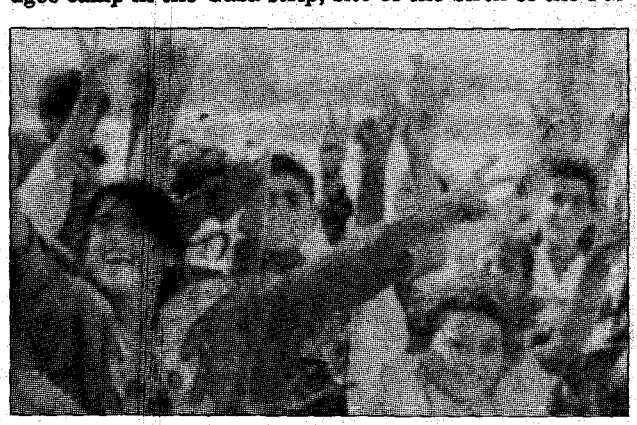
Arafat in Gaza: how long will the 'honeymoon' last?

Arafat's hurried tour of such areas as the Jabaliya refugee camp in the Gaza strip, site of the birth of the Pal-