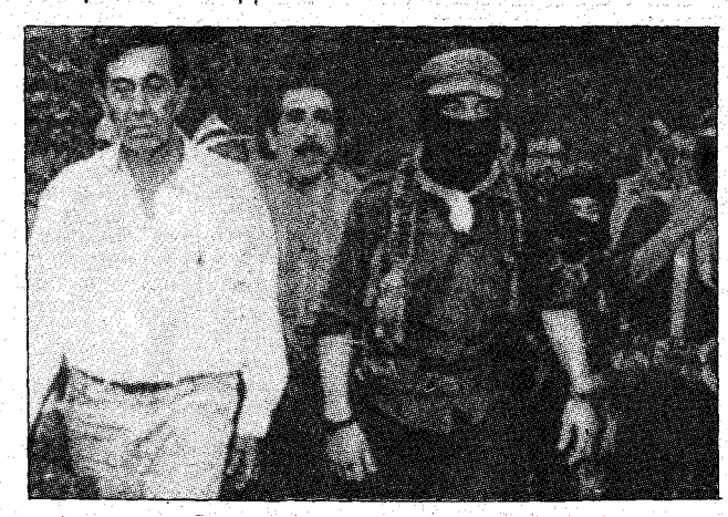
Opposition candidate Cardenas visits the Zapatistas.

Implicit in this appeal to the broad mass of social forces