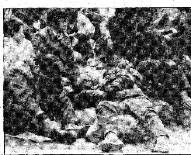
'Unemployed-casualties of China's economic 'boom.'