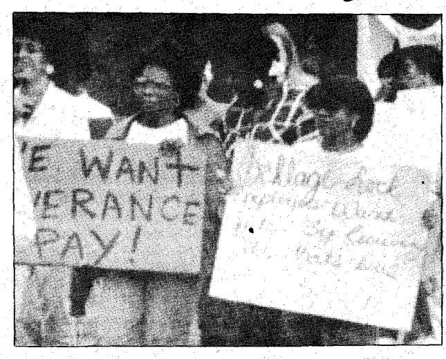
'Militant Black women lead southern labor battles.'