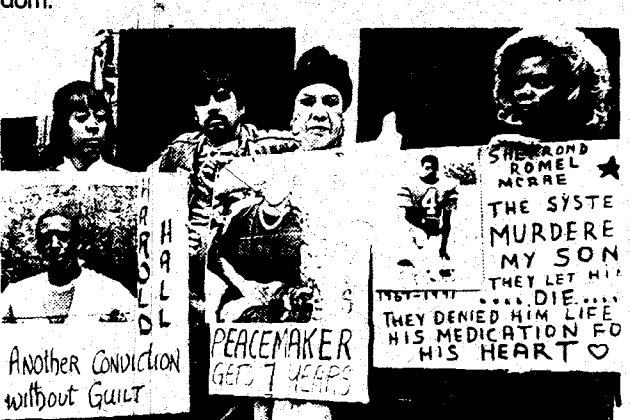
Los Angeles mothers denounce system of injustice.

ble organizational form, the social consciousness arising from it can only satisfy its philosophic needs and thus conserve itself through the self-organization of the Idea of Freedem.