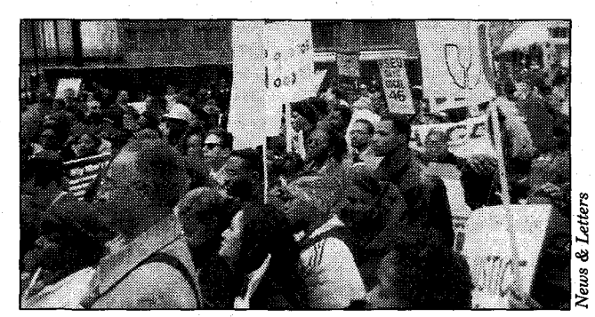
Chicago poor protest slave-wage future in workfare.

What neither the mayor nor the labor leaders counted on was the rebellion of the WEP workers themselves who formed WEP Workers Together!, a grass-roots, self-organized, self-conscious resistance to sweated labor conditions. They insist they are not going to work for nothing, doing the same work as — or replacing — others making a decent living. (See WEP stories in October, November