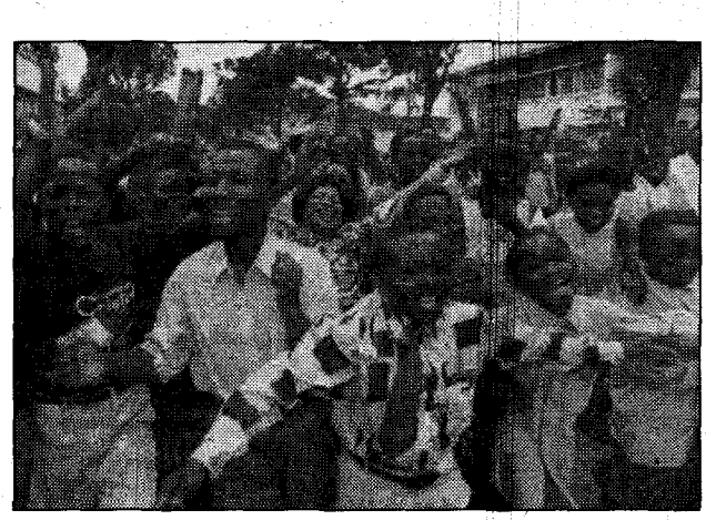
Zaireans celebrate rebel takeover of Kisangani.

Congo-Zaire, besides its strategic location-it has borders with nine other countries-contains 60% of the world's cobalt, plus substantial deposits of uranium, diamonds, and gold.