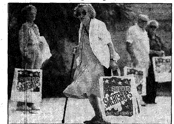
Retired union textile workers protested outside Lord & Taylor at Palm Beach Mall in Florida, Feb. 23, against the parent company's use of sweat-shops to produce their clothing line.