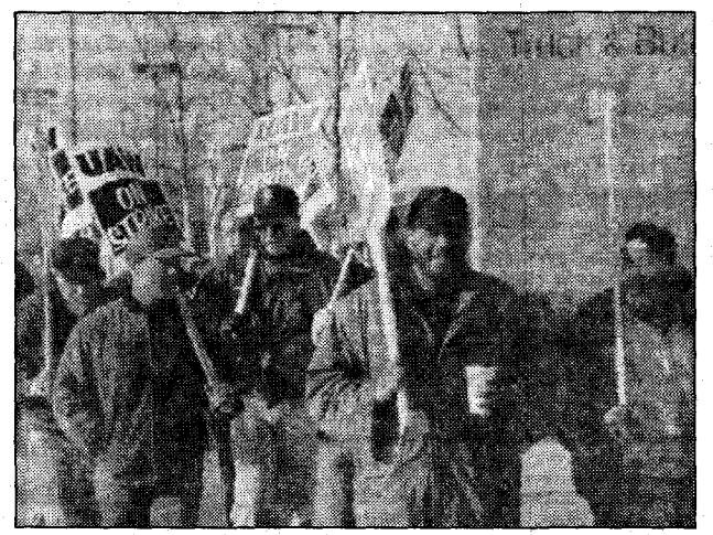
UAW workers at Pontiac East join the strike wave.

GM's efforts to squeeze more work from hourly workers has reached into every plant. "Downsizing is really up-production," pointed out a longtime worker at GM Shreveport, La. "Last year we produced an extra 25,000 Hombre vehicles for Isuzu, with no extra people to make them. Basically, Isuzu got them for free. If your job was too much to take and you complained, the time-andmotion man would come to check you out. If he thought you could handle the work, you were screwed. If you could get the union to file a grievance, it wasn't likely