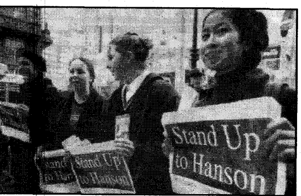
Australian students protest racist One Nation party which opposes aboriginal and immigrant rights.

What will happen to women who exhaust the 5-year lifetime limit for welfare? What will happen to those still in poverty with low-wage jobs? What will happen to their children? This is not reform, it's oppressionoppression of this society's most vulnerable: poor women with children. -Rose