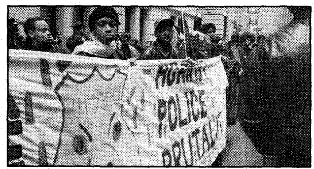
Group of Hatians at Diallo protest on Wall Street.