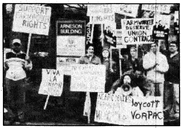
PCUN supporters at Norpac plant in Salem, Oregon press the boycott which ended in victory.

Farm workers in Oregon have reached an agreement that ends a ten-year dispute with a cooperative of growers. The Campaign for Labor Rights, a coordinating organization for solidarity with grassroots workers' struggles, has announced that Pineros y Campesinos Unidos del Noroeste (PCUN) and NOR-PAC Foods, Inc. reached an agreement on Feb. 15 as a result of mediation. The agreement provides for a set of guidelines for relations between farm workers and growers in the state of Oregon.