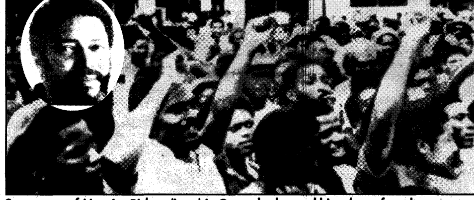
Supporters of Maurice Bishop (inset) in Grenada demand his release from house arrest.

become clear that critical w e e k between Oct. 12 when the majority of the Central Committee voted to put Bishop under house arrest, and the savage, unconscionable,