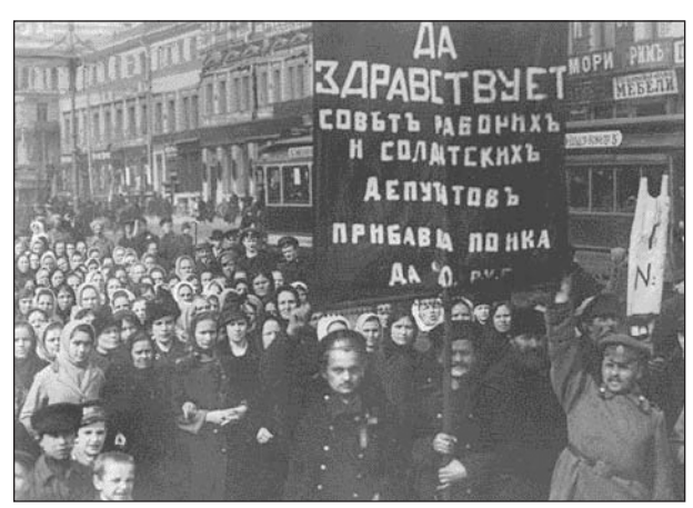
Women workers initiated the Russian Revolution, International Women's Day, 1917.

a standard of textual fidelity to the works of Marx and Engels in order to correct the distortions of various opportunists, anarchists, revisionists, and so forth, in the spirit of which it is crucial to recognize that Marx's "new continent of thought and revolution" transforms the meaning of both politics and economics. Accordingly, the Critique of the Gotha Program is best read as a "concretization," neither of politics nor of economics, and neither of theory alone nor of practice alone, but of "the philosophic moment" that is the "determinant" for every subsequent development in Marx's thought.