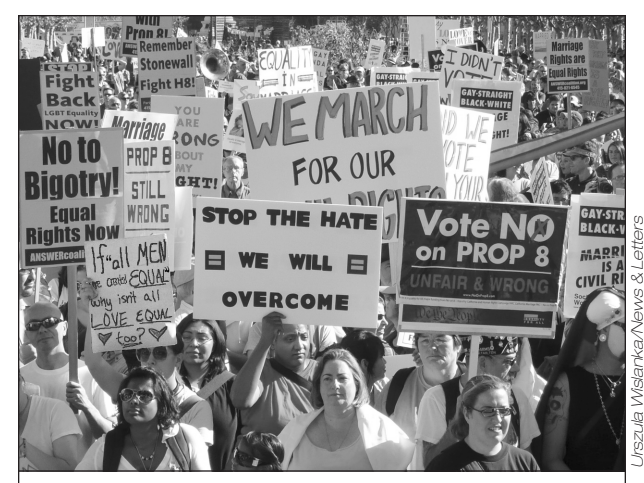
Tens of thousands rallied in San Francisco and thousands more in Oakland, San Jose, and other Bay Area cities after the passage of Prop. 8.

We have recently claimed a right to reciprocity in the support of our struggles, but how many in the Queer rights movement have actively worked for the liberation of those groups whose endorsement we demand? Further. the goals of our own movement cannot begin and end with marriage rights. We must situate marriage rights within a broader struggle for Queer rights, and this struggle must include all Queers. We should leave behind the individuals and organizations that seek only bourgeois