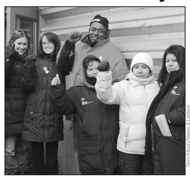
Congress Hotel strikers standing up for workers occupying Republic Windows and Doors

CHICAGO —We are workers on strike at the Congress Hotel in Chicago. We're here at Republic Windows and Doors giving support to workers sitting in. We are their comrades in the same struggle and we are fighting for the well-being of our families.