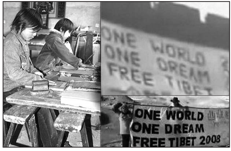
China exploits its own children as well as Tibet. Protests include Chinese at the Great Wall in 2007 and Students for a Free Tibet on Mt. Everest last month.

Attracting foreign capital to China's export processing zones depended from the beginning on extracting