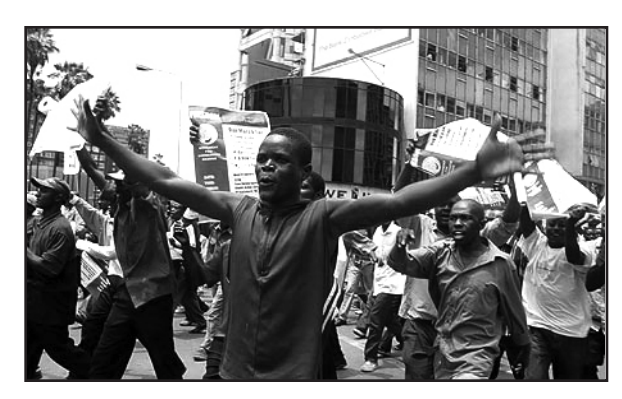
Opposition activists marched through streets of Harare

few), inflation rates up to 66,000%, 80% unemployment rates, and millions forced into economic or political exile have seen to this. Mugabe dealt with the HIV/AIDS crisis by demonizing gays and with urban poverty by bulldozing the shantytowns of the destitute to drive them from the cities.