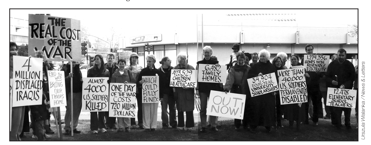
Oakland, Cal.—On the fifth anniversary of the Iraq war, in addition to the major demonstrations of many thousands in San Francisco, Berkeley and San Jose, there were literally hundreds of smaller vigils of dozens in most neighborhoods, such as this one.

Left organizations were suburbanites who brought their children, high school and college students, and people getting off from work.