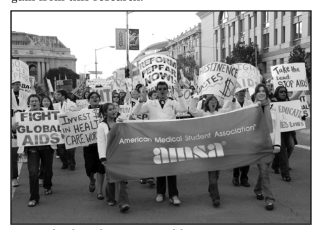
Medical students on World AIDS Day in 2007

By 1980 healthcare constituted 8.8% of the U.S. economy, and the state's role shifted as healthcare itself also became a center of capital accumulation. Today healthcare constitutes over 16% of the U.S. economy. A crucial turning point came with new laws like the Bayh-Dole Act of 1980. This allowed researchers, whose research was funded by the federal government in publicly funded universities and by agencies like the National Institutes of Health, to patent and personally gain from this research.