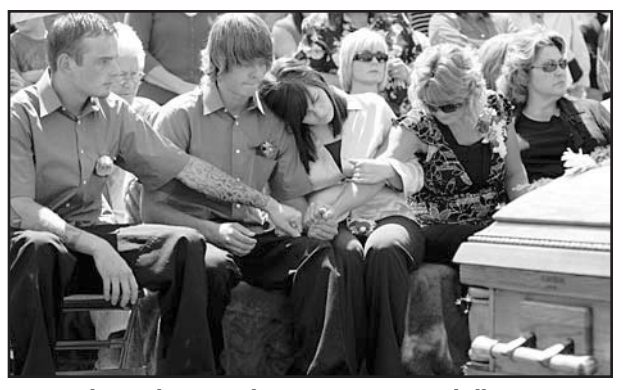
Family and co-workers at one Crandall Canyon miner's funeral

The MSHA report especially criticized Genwal for failure to fully report the dangerous mine conditions, and that deceit deprived MSHA of the information it needed to make decisions about the mine operations. MSHA fined Murray Energy $1.6 million for its irresponsible actions, the highest fine ever assessed by the agency. Another company, Agapito Associates, that had