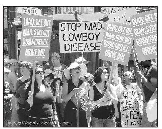
Chanting "We are the ones we've been waiting for" and "We want justice, we want peace, we want love in the Middle East," dozens of mostly Middle Easterners protested in downtown San Francisco on August 2. One organizer told us, "What we have to have is a popular movement. Voting and hoping is not going to do it. Our government is threatening to bomb Iran. They do not respect human lives, nor any human values." Another participant, recently from Iran, said, "People in Iran don't want a war. They believe change will happen from within Iran, they don't want another external conflict deflecting attention from that."

1. Daily life is a form of torture. We cannot get food without being forced to take sides with the ruling Zanu PF who currently controls access to all food in the country. As we have seen before during election periods,