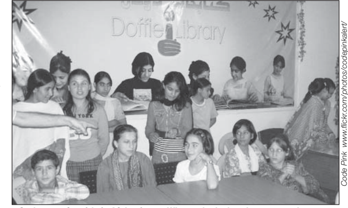
Orphanage for girls in Afghanistan. When asked what they want to become, they say they want to be doctors, engineers and teachers.

In the face of McChrystal's devastating assessment calling for at least 40,000 more U.S. troops and years of commitment to keep from losing the war, President Obama, who appears reluctant to commit more troops, said, "The first question is: Are we doing the right thing?"