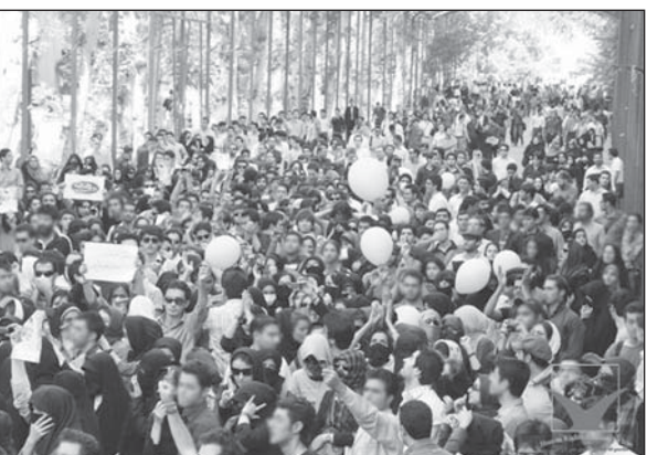
Sept. 18 demonstration at Tehran University

between outright street protests rife was with movement: from the ongoing weekly protests of the Mourning Mothers, to sporadic outbreaks of demonstrations in the streets and the Metro stations, to activism of a different kind-mass political dialogue on the sidewalks, in taxicabs, at home and at the workplace. One reporter, whose name is withheld, wrote from Iran (http://globalpost.com/print/3636975) that the workplace is where "everybody does nothing except find ways to get around blocked websites and read the day's news." Moreover, calls for a political mass general