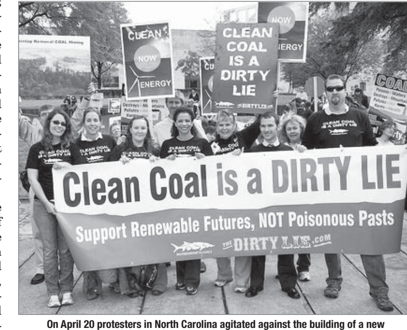
coal plant at the Cliffside facility in Rutherford County.

the However. contradictions of this movement were visible. Mainstream activists delivered uninspiring, an technocratic mesthat touted sage technolovarious gies and included advocating a carbon