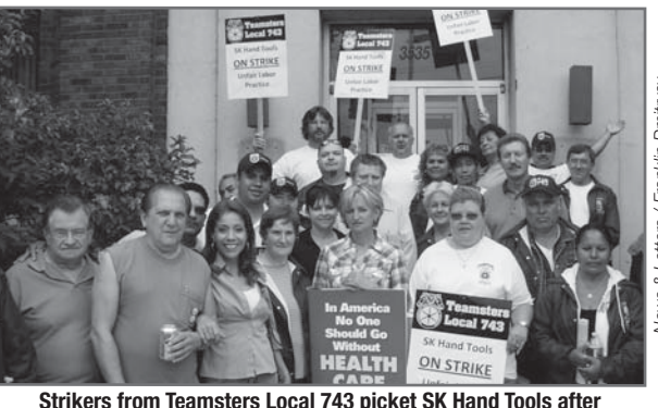
the company unilaterally canceled their health insurance.

We might be having a rally soon in front of Sears because we manufacture Craftsman tools for Sears. We manufacture tools, hand tools. Most of the people are setup and operators. We set up and operate our own machinery. I work on the stamp machine, putting the part number on all the parts.