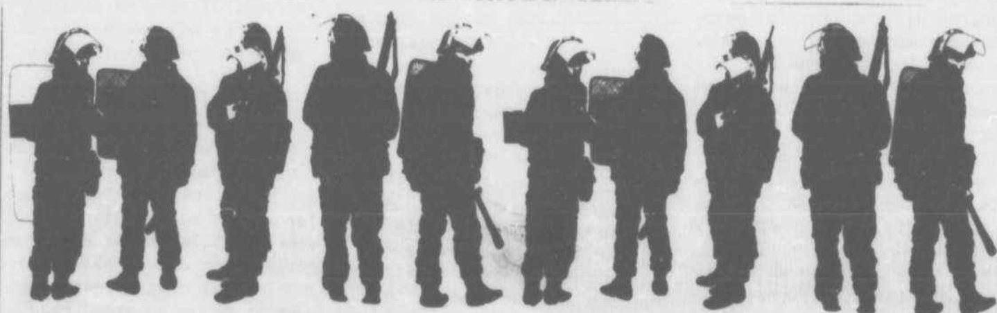
LABOUR GOVERNMENT TORY GOVERNMENT THESE GUNS ARE MADE TO KILL

A vote for the S.D.P. is a vote for the Tories, the S.D.P. cannot win the election so therefore Labour is the only present alternative. They need every vote so a vote for the S.D.P. is a wasted vote which will keep the Tories in.