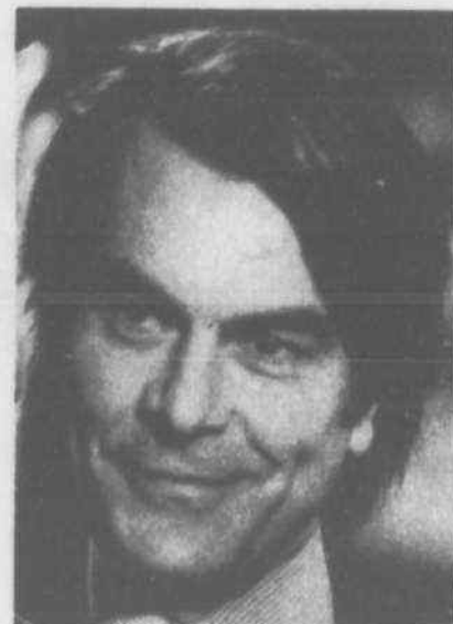
OLD WINE NEW BOTTLE

Today they are still oppressed but no longer on their knees. Their struggle has won them worldwide support and respect and they may well achieve British withdrawal in our lifetime. If they do it will be for one reason and one reason only. They stopped waiting for change from on high and went out and fought for it.