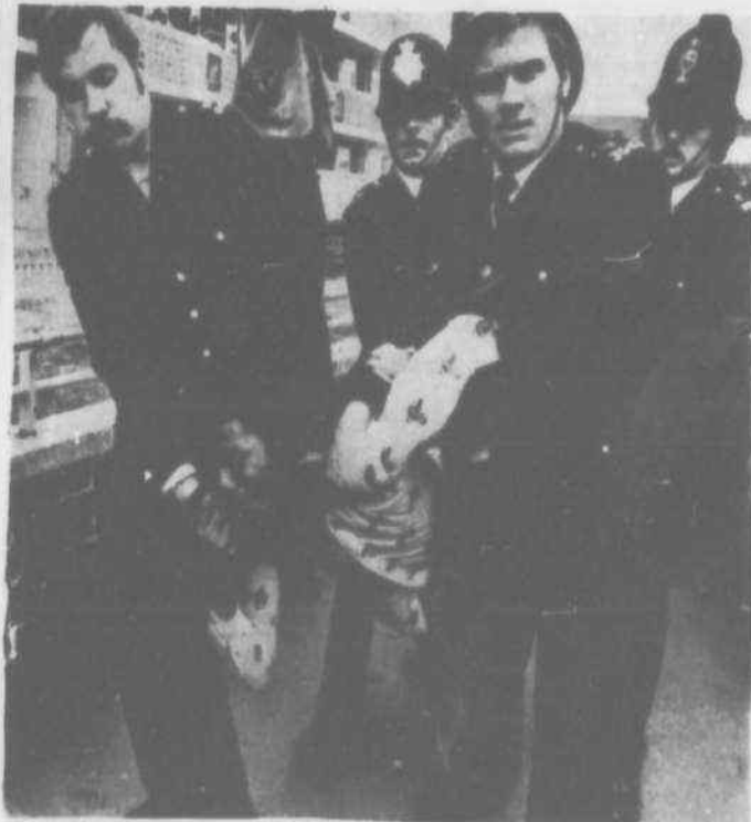
Assisting Police with their enquiries -

On Saturday 3 April there is a national demonstration for the Bradford 12 RED ACTION will be there and we urge you to come along.