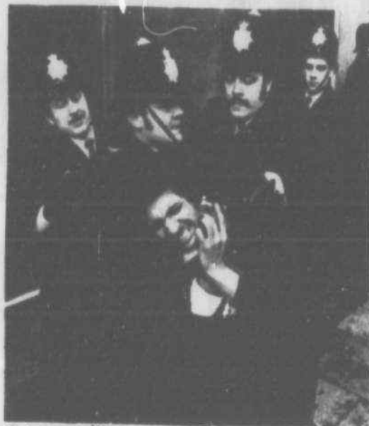
But what about Police Brutality?