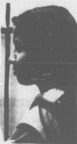
RACE CHECKS THREATEN BLACKS.

And what is left of the welfare state is steadily demolished, unemployed workers