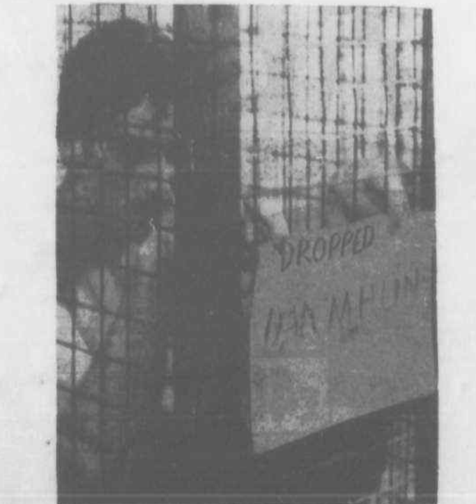
This picture was found on the Royal Green Jackets platoon notice board, and shows the cage into which young recruits are forced.

A catalogue which perhaps gives you some idea of the pathetic bully boy mentality, which the Irish people have to endure stomping around their streets every day.