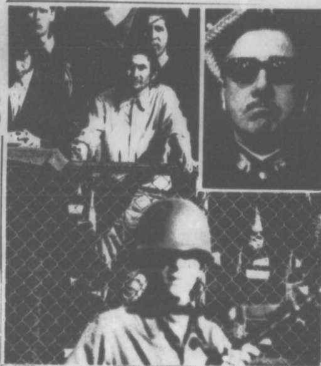
The end of the Parliamentary road to socialism in Chile. When the government of Allende, was overthrown by a right wing coup led by General Pinochet (inset) tens of thousands of socialists and other progressives were thrown into cages such as the one above. Many of them were never seen again.

An example of how easily the upper classes can just defy the wishes of an elected government, was seen quite clearly during a strike by Ulster Unionists in 1974. Then the Wilson government (again)