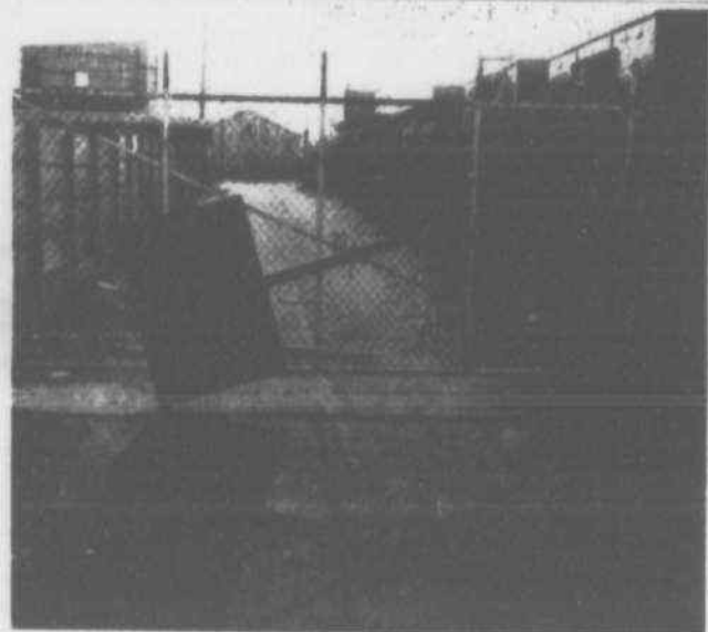
Only by bringing all of the major industries and productive resources under public control, will we be able to prevent the obscene spectacle of them standing idle, while people are crying out for the goods that could be produced on them.

The only answer is for society to take over all of the major socially necessary industries and natural resources, and operate them on the basis of what is needed by society. In such a situation, first and foremost, all people will be entitled to an equal share of what is produced at all times. It will be up to society to provide the means and opportunity to make sure that everyone contributes to production. If a situation did arise where the product of one particular industry was no longer needed by society, then obviously there would be no reason why those people involved in that industry, should not still receive a full share of what is produced, until such time as society provides them with alternative employment. In such a system, there will be no such thing as the regional deprivation which we see today. For in such a situation, the work will go to the people, and not the people have to go looking for the work