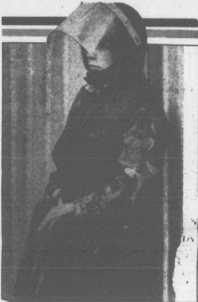
Waiting for you. How long before we see scenes like this on the streets of this country.

It was this situation which caused the British government to suspend the N. Ireland Parliament, institute direct control from Westminster, withdraw the R.U.C. and Specials and send in British troops to restore order and keep the peace. For a brief time, there was a honeymoon period, with many Catholics looking upon the troops as their protectors against the hated R.U.C. and Specials, especially as their arrival was accompanied by some minor reforms by which the British government scrapped some of the more blatantly unjust features of the N. Irish state. However, it soon became clear that the role of the Army, far from heralding major changes, was to protect and uphold the state.