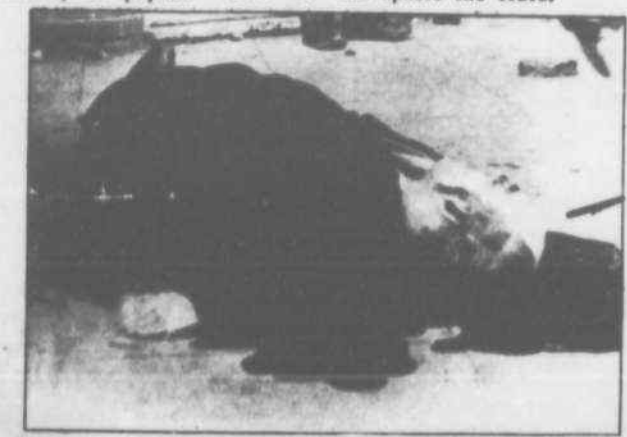
One of the fourteen victims of Bloody Sunday. Murdered by the British state.

Transport to this event is being organised from many parts of the country. For details write to the Committee for British withdrawal from Ireland, Box 353, London NW5 4NH, or contact the Red Action Box number.