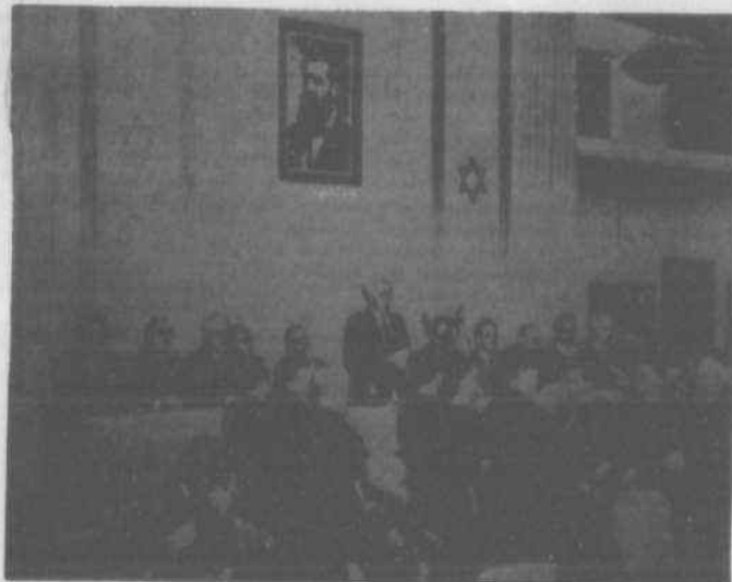
David Ben Gurion Israel's first Prime Minister proclaims the State of Israel in 1948.

As long as this continues to be the case, Israel will no doubt continue in its role as the number one terror state in the world, with the full backing of Western governments.