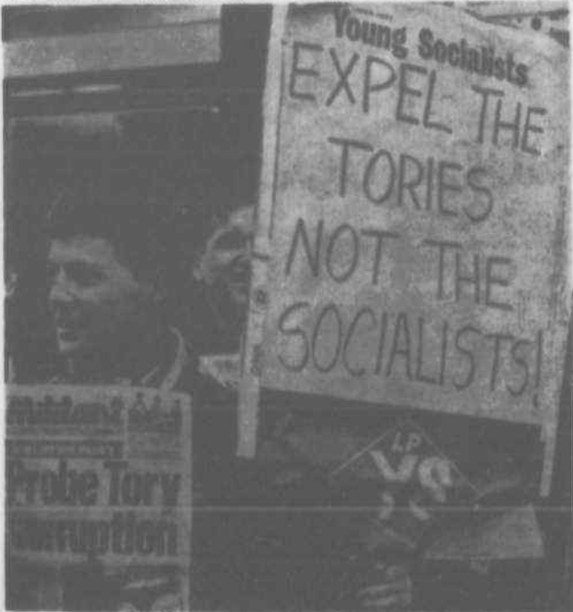
A Fair enough message, but will it get through.

as revolutionary socialists, they would certainly be seen by most people as being on the very far left. The fact that they were still elected in spite of this, and in spite of the campaign of smears that they have all had to endure, totally dispels the myth that it is impossible to win large scale support for radical socialist ideas. It shows quite clearly that they way to begin to fight back against Tory ideas, is not to be ashamed of socialist politics and run away from them, but to shout them out loud and clear.