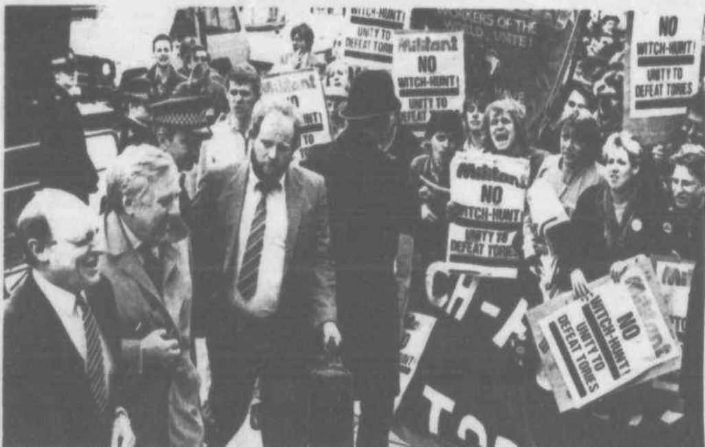
Kinnock, Hattersley and other leading Labour figures, seem to spend more time attacking other socialists than they do attacking the Tories.

And so one factor in the triumph of Toryism, is people's lack of awareness as to