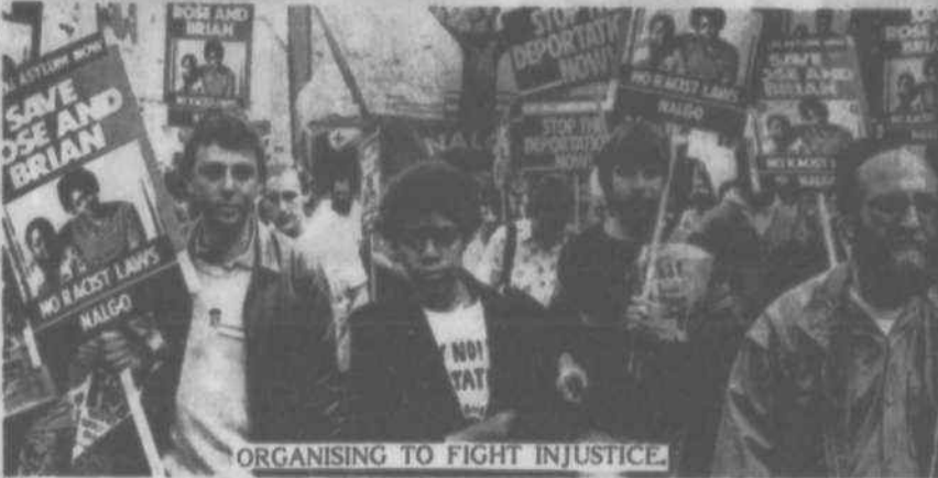
ORGANISING TO FIGHT INJUSTICE.

Over the past few weeks, the Half Moon young people's theatre in London, have been touring schools in the East End of the city, performing a play which tells the story of a family of four - parents and two young children who lived in a state which persecuted certain racial minority groups. It tells the story of how these unfortunate people, who had committed no crime other than being in this certain country, spent months in hiding from the police, their eventual capture, and their expulsion to the country of the parents origin, even though the two young children, a boy of eight and a girl of six had both been born in the country in which these events occurred, and had never even seen the country they were being sent to.