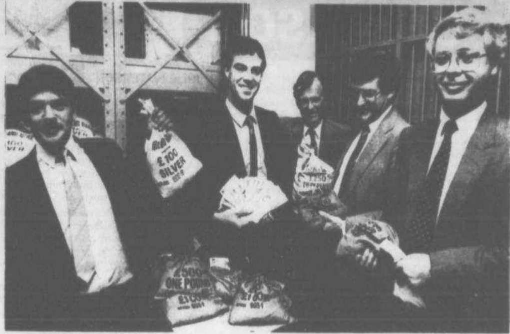
The real aim of privatisation is to turn public property into private wealth

They send you an application form, and you fill it in telling them how much of the company in question you wish to buy in the form of shares. You then fork out your life savings, and you now own something like 0.000001 percent of "your" company, along with 2 or 3 million others. After a while, you will all get a letter telling you how much your shares have increased in value. Along with many others you may well