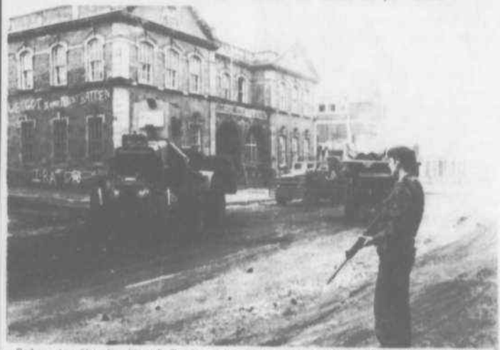
Going to the North of Ireland is the most politically worthwhile thing that anyone in this country could do.

Whilst in Belfast, we will be staying with Republican activists. The fare is not cheap, ranging from about £40 return by coach, up to about £80 by plane. The advantage with the plane is that it is much quicker and if you are working you miss less time off work. Whichever way you go, it is money well spent. If you think that you might be interested, then write to the Red Action box number as soon as possible.