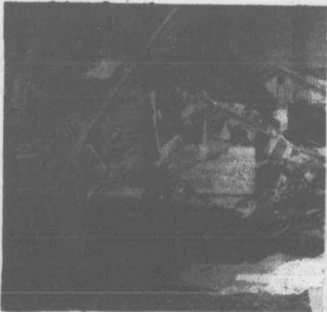
An RUC barracks devastated by an IRA attack.

The Nationalist people realise that the only way in which things will change and their living standards improve, is by removing the British presence in Ireland, and establishing in its place a socialist government. That can only be achieved by the IRA becoming increasingly successful in every aspect of their war campaign, including the prevention of work by collaborators.