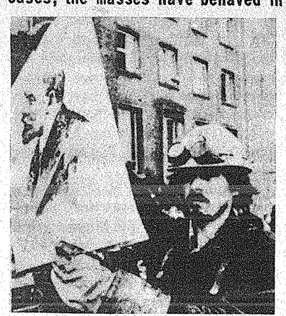
POLISH WITH WORKER PHOTOGRAPH OF LENIN IN A DEMONSTRATION.

Workers State to make it more States more and more with the efficient in social, economic and revolutionary process throughout political programming. The working the world. class and the Polish masses have not participated in strikes and provocations against the military intervention. militants of the Party have collaborated with the army and, in all cases, the masses have behaved in