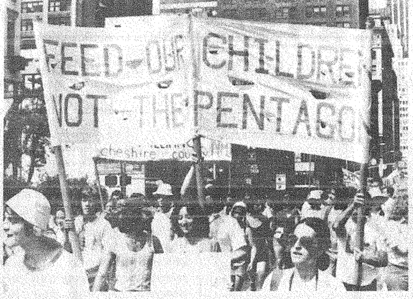
AMERICANS DEMONSTRATE AGAINST THE WAR POLICIES OF IMPERIALISM.

The crisis of capitalism is expressed in production, in finances and in accumulation and export of capital, and, at the same time concentration develops more and more in the multi-nationals. Marx and Kautsky predicted the inevitable