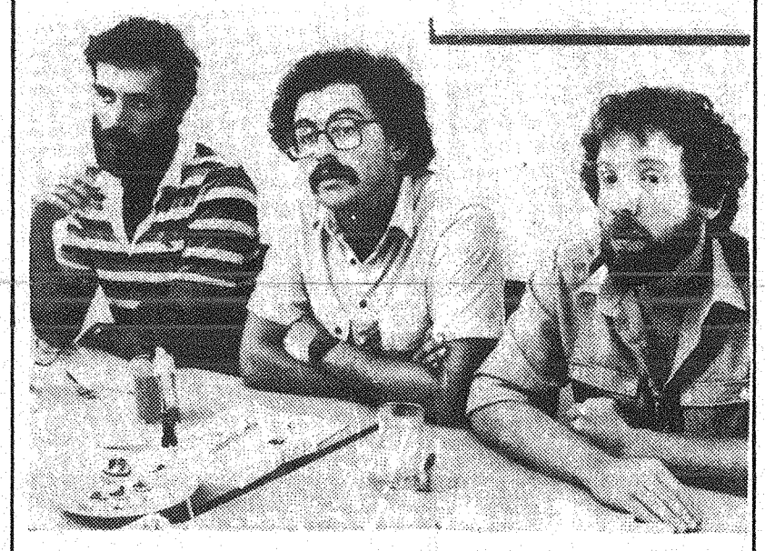
ISRAELI SOLDIERS DENOUNCE THE WAR IN THE LEBANON (MEETING IN TEL AVIV).

The Israeli invasion of Lebanon - directed by Yankee imperialism - shows both the closeness of the final encounter between the system of the Workers States and the world masses and the capitalist system, and the desperately murderous nature of capitalism. If the Israelis have been stopped at Be irut it is because of the existence and intervention of the Soviet Union. In a very direct form, with the speech of Brezhnev, the Soviets have told imperialism that it can go no further. Using Israel, Yankee imperialism has acted in Lebanon in exactly the same way as British imperialism acted in the Malvinas: they attempted to halt the advance of progress by terrorising the masses and, in both cases, it has been an absolute disaster for imperialism. Of course, imperialism has killed in this process Argentinians, Palestinians and Lebanese, but the