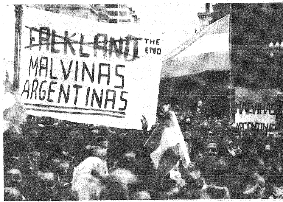
PART OF THE MASSIVE POPULAR DEMONSTRATIONS IN ARGENTINA

of the masses and, above all, of the economic crisis which is insoluble within capitalism. The intervention is not only to canalise the discontent of the masses but also to centralise within the apparatus itself the tendencies which push for a change in the economy against de-nationalisation and privatisation The military dictatorship has killed, assassinated and handed over the country to foreign capital, but has resolved no problem for the masses. As a consequence, such a measure indicates the level of the crisis and the internal struggle within the military team which has had to take a measure seeking support in the