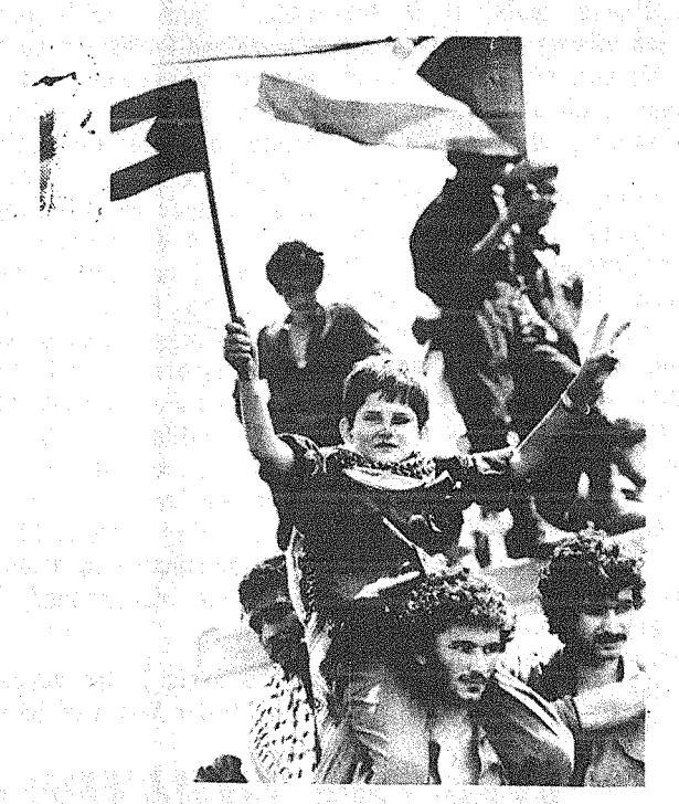
FORCES OF THE PLO LEAVING BEIRUT IN TRIUMPH

Recently in the United States there was a demonstration of twenty five thousand people against the Reagan government. There was every type of person, but the constant element in this demonstration was the fifteen thousand young people - including many homosexuals who said, 'We are homosexuals, but we are against the intervention in El Salvador, the Turn to page 3