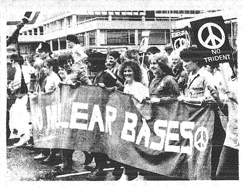
ANTI-REAGAN DEMONSTRATIONS IN LONDON