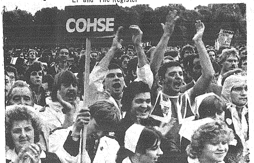
Demonstrators on the 'Day of Action'.

Article on CULTURE: J. POSADAS Page 4. LP and 'The Register'