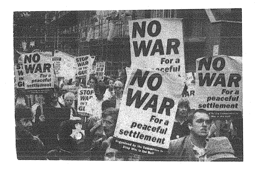
Demonstration against imperialist war in London.