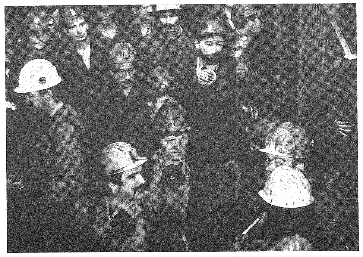
The intervention of the soviet miners damages the bureaucracy.

There is a great weakness in the CPSU and hence it is the Red Army which has been weighing more and impelling a direct intervention Ĭn Lithuania as in other situations where the local bureaucracy wants to cause a separation from the USSR.But the army has not intervened alone.in the mobilisations. The workers collectives, the citizens committees stimulated by the appeals of Gorbachev have also intervened against the government of Landbergis and also the minority Communist party. The working class seeks to weigh in this crisis and does it in part when it succeeds in rejecting the increases in prices, when it wages the struggle against the speculators, the mafias when it rejects the so-called operatives which are simple centres for the enrichment of some at the expense of the population.But the latter still does not have sufficient possibilities of intervening in the soviets, to make of them instruments of control and of the struggle against the bureaucracy and all its vices, to control the economy, to intervene in planning for the benefit of all the USSR, to intervene in the international policy of the USSR. For this it is necessary that the CPSU fully integrates itself with this objective. 28 January 1991 European Bureau.