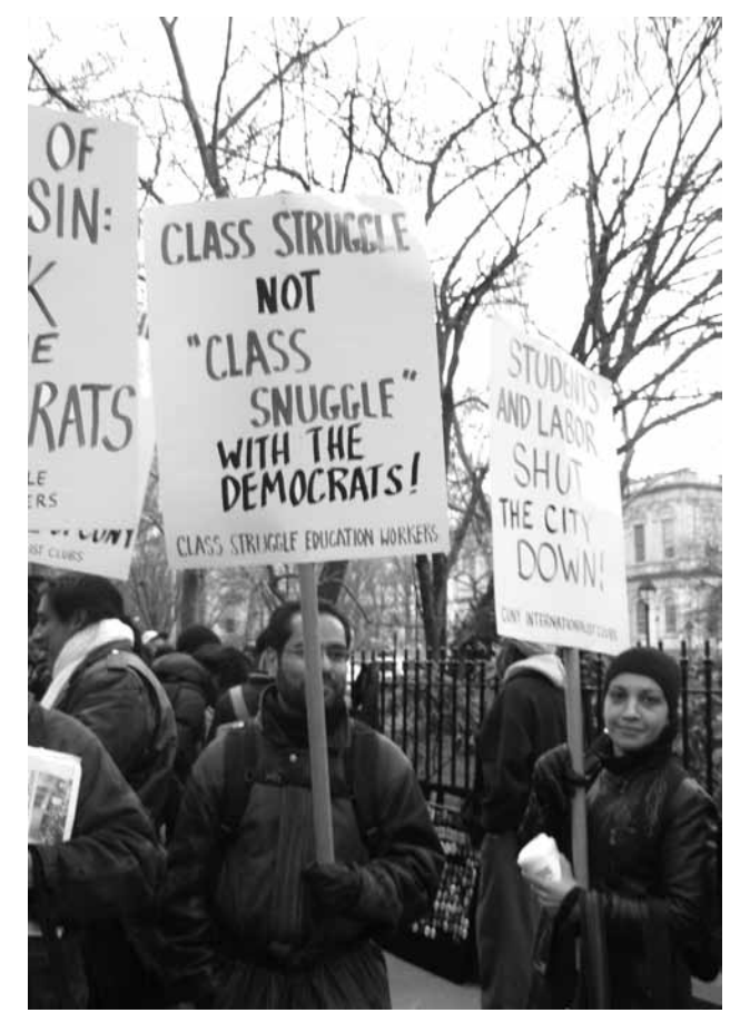
CSEW joined with CUNY Internationalist Clubs and Internationalist Group at March 24 march at NYC City Hall in opposition to coalition with Democrats.

The result is that in the upcoming negotiations with the anti-union CUNY administration, backed to the hilt by a Democratic