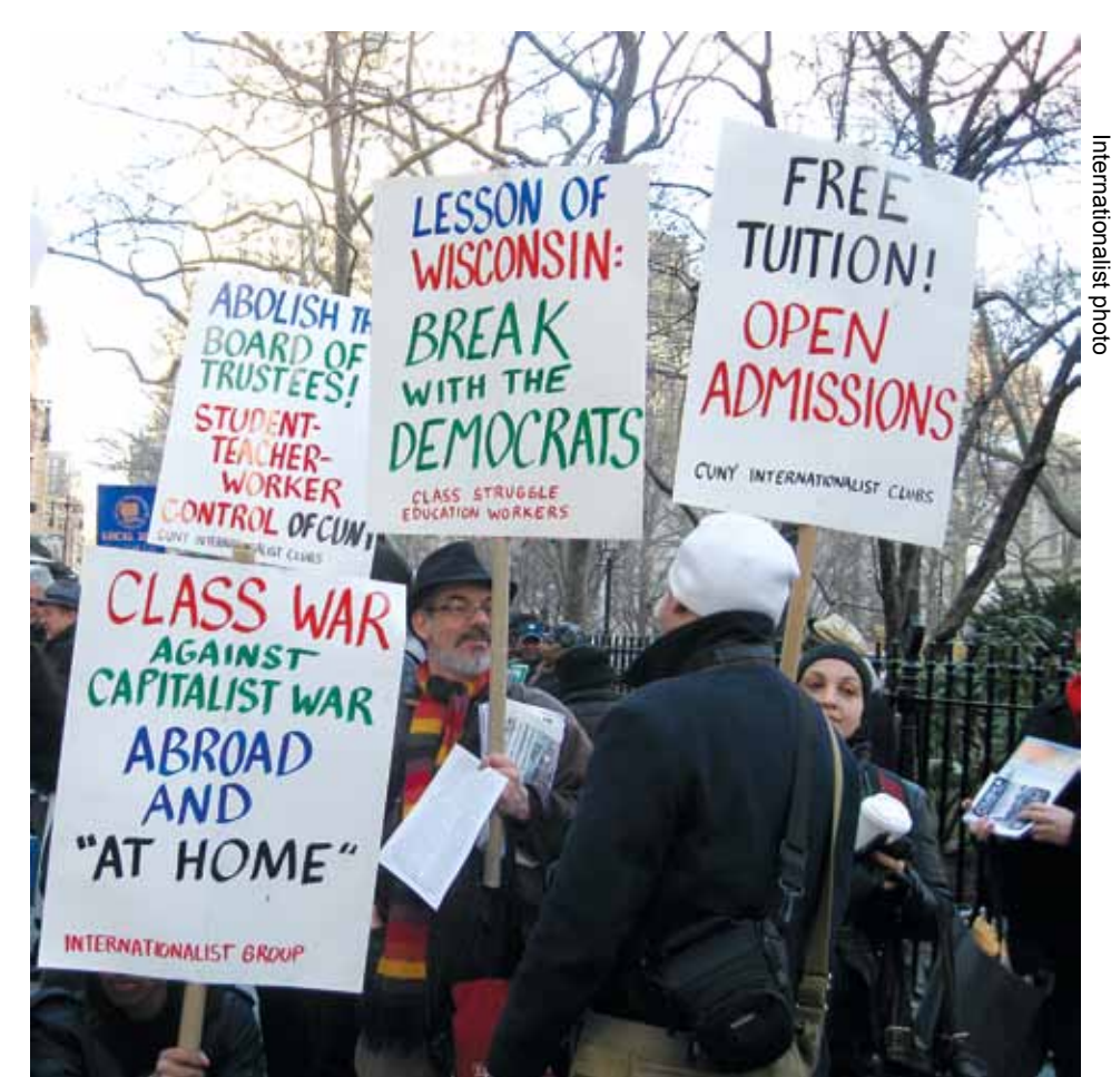
Supporters of the CUNY Internationalist Clubs, Class Struggle Education Workers and the Internationalist Group call for class mobilization against capitalist attacks on public education at 24 March 2011 protest march from NYC City Hall to Wall Street.

Today at CUNY, students are dropping out of college or don't apply because they can't afford tuition and the costs of living combined. We say " No tuition – Open admis sions, " and demand a state paid living stipend. "But what about the economic crisis?" say those who think it's natural and right for those continued on page 2