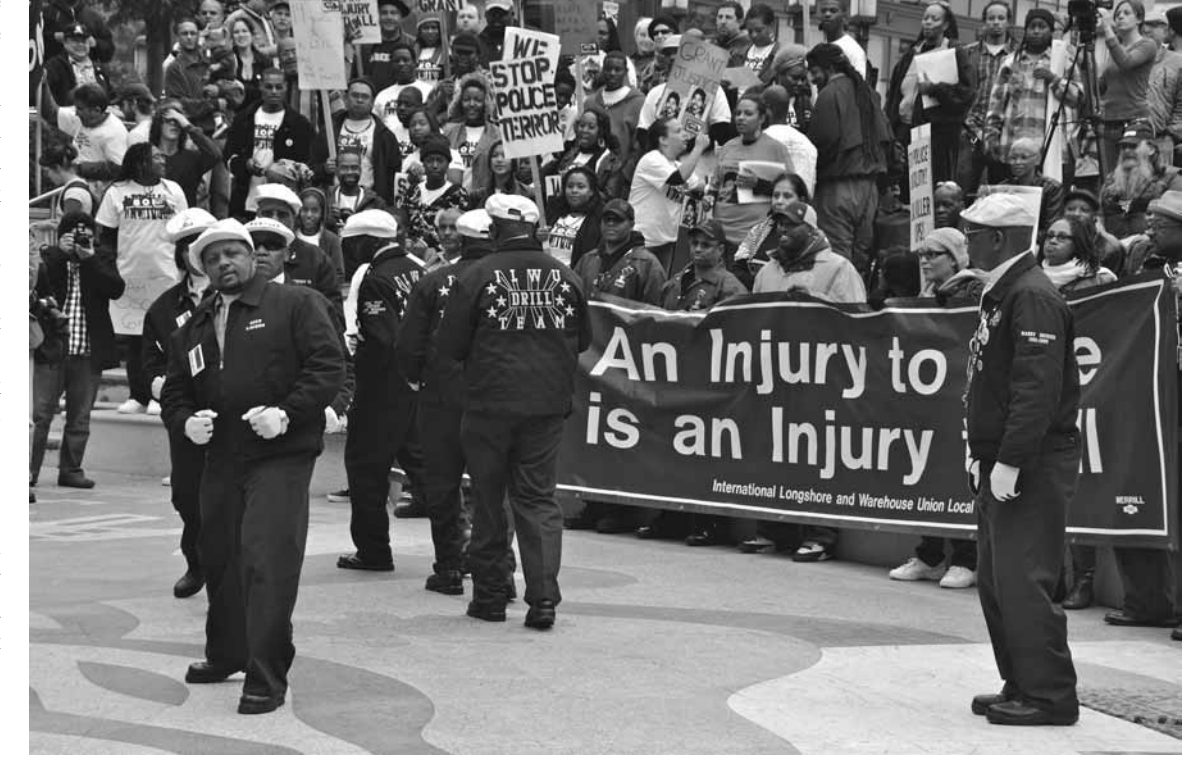
ILWU at October 23 Oakland rally demanding justice for Oscar Grant, murdered by the cops.

So what is to be done here and now? In the aftermath of the police killing of Oscar Grant, just about every "reform" measure to alter the functioning of the cops was proposed. BART management set up a committee to "investigate" its cops. A Coalition Against Police Execution (CAPE) was set up by activists from NGOs (foundation-