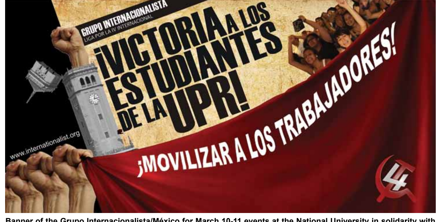
Banner of the Grupo Internacionalista/México for March 10-11 events at the National University in solidarity with the students of the University of Puerto Rico.

Various speakers gave greetings to the Puerto Rican students in struggle against the imposition of tuition charges of $800, and the crowd applauded their courageous struggle. A teacher who is a member of the Grupo Internacionalista underlined that the