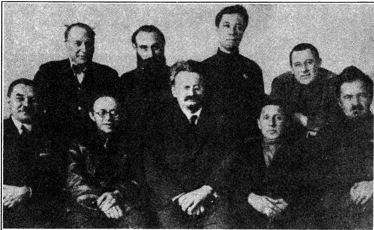
Leaders of the Left Opposition in 1927. Trotsky centre, Radek to his right. Christian Rakovsky is on the far left of the back row.

is the whole of what Trotsky wrote in key texts like The Revolution Betrayed (1936), in which he specifically argues for the supremacy of the Soviets, for the right of multi-partyism, and for the freedom of internal party groupings and debate. Left out are his very clear assertions, like those in the Transitional Programme (1938) that the workers 'must be free to choose who they want' in the soviets as their representatives, on the basis of freedom for parties and secret elections.