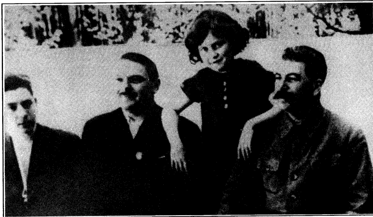
Stalin with his children

One thing is clear, with the defeat of the intervention, victory in the civil war and the neutralisation of the economic dominance of the exploiting classes, the concept of the dictatorship of the proletariat lost whatever disputed validity it might have had. Its perpetuation provided a 'Leninist' mantle under which Stalinism was able to flourish. The external threat with its internal agents, both real and invented, provided the rationalisation for the thesis that the stronger socialism grew the more intense the class struggle became. The external threat from imperialism and fascism was certainly real, but the vast chasm between socialism and democracy made the whole system more, and not less, vulnerable to these threats.