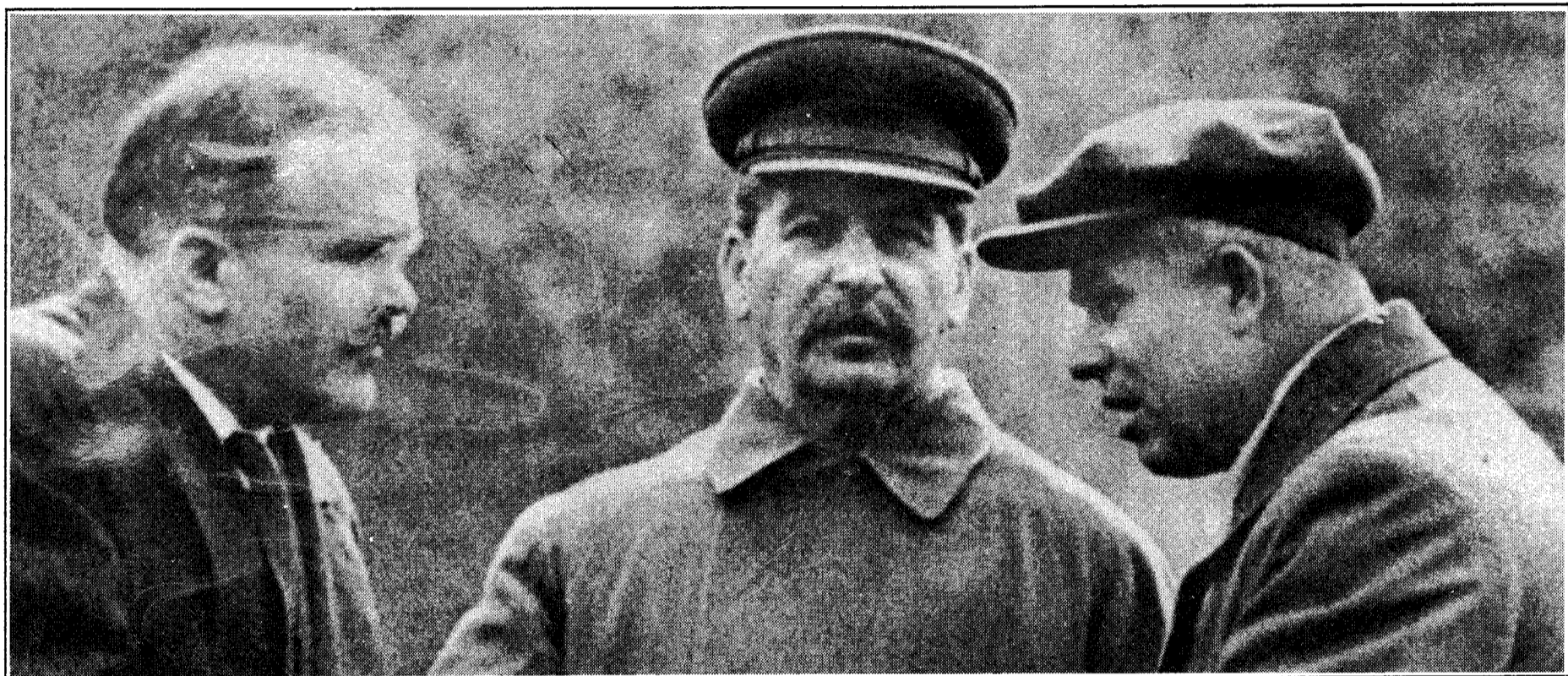
Stalin in Red Square with Molotov (left) and Khrushchev (right)

In 1990 Joe Slovo, until recently General Secretary of the South African Communist Party (SACP), published his well known pamphlet Has Socialism failed? which heavily criticised the Stalinist legacy of the official communist movement. Left-wing critics of Slovo pointed out that he failed in his pamphlet to situate the rise of Stalinism in the victory of the bureaucratic caste which usurped power in the 1920s.