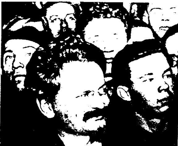
Trotsky leaves in 1928 for his third Siberian exile, this time in remote Alma-Ata.

This fight can now be brought to a conclusion with 'October's' in many countries. This is the real meaning of events in Eastern Europe.