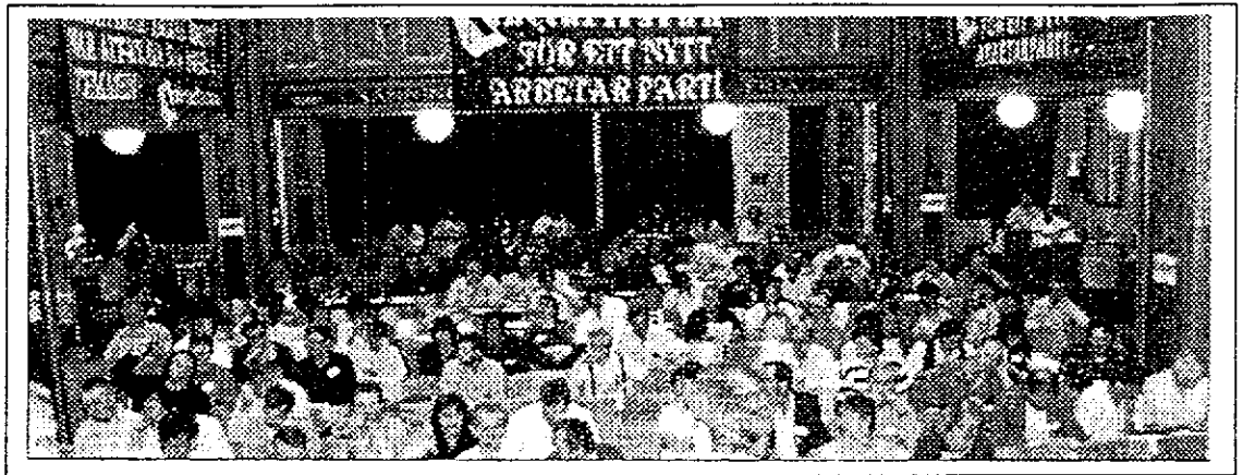
The first, historic, congress of Workers' List.

Following the example of our sister organisation, Convergencia Socialista in Brazil, who demand that the Workers' Party, in which they are integrated, be the Party of the workers and the peoples mobilisations, the Socialist League wants to build the Workers' List in the social and trade union struggles. This orientation was clear, for