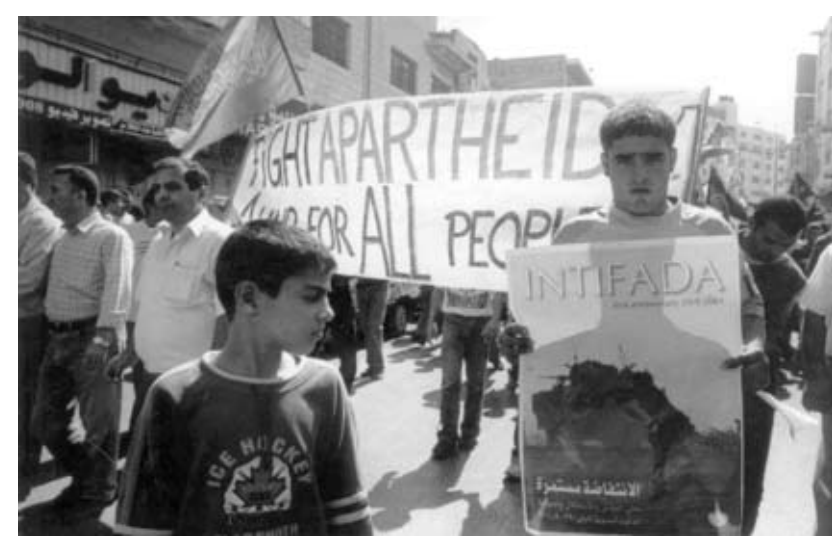
Palestinians demonstrate in defense of intifada.

The masses are well aware of the rulers' failures to defend the Palestinians but do not yet attribute this to their bourgeois character. They don't yet accept the need for socialist revolution, and they don't see that revolutionary proletarian states in the region would be the best defense the Palestinians could get. They believe that if the present regimes were less corrupt, more honest, braver or more subjected to mass pressure – and, as unfortunately increasing numbers seem to think, more Islamic – maybe more aid would be sent. Tragically, this is how the masses in the region have been misled. Yet they want the Palestinians to be armed and reinforced before thousands more are killed.