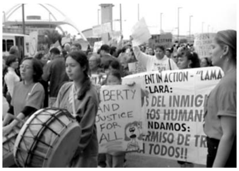
Demonstration at LAX airport in March 2002 protesting wave of attacks on immigrants in U.S.

To carry out its assaults without hindrance from constitutional protections, the federal government hurriedly passed new