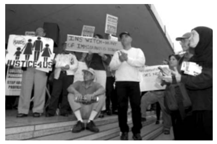
Protest against witchhunt of Arab-American men in front of the Immigration and Naturalization Service Los Angeles District Office, January 2003.

spread about a federal amnesty bill, as if it could really be won just by occasional lobbying and demonstrations. And after September 11, the reactionary labor bureaucracy went back to its real full-time job of touting U.S. imperialism uncritically.