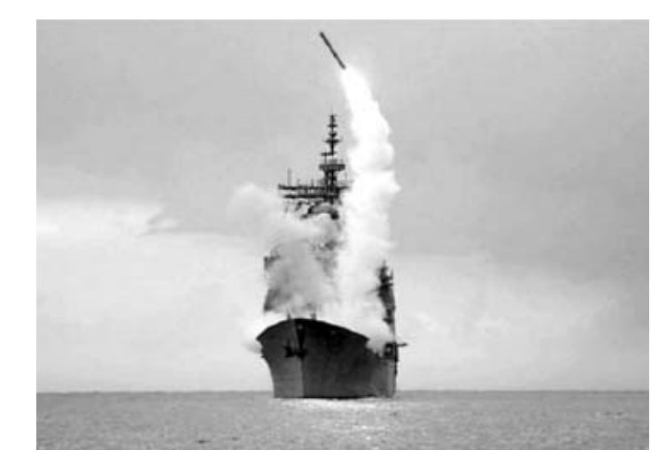
U.S. missile launched from Persian Gulf. War killed unknown thousands of Iraqis.

Anti-Arab racism whipped up after September 11 was used to justify the jailing and deportation of thousands of immigrants, and had already led to a rise in police brutality against Blacks and