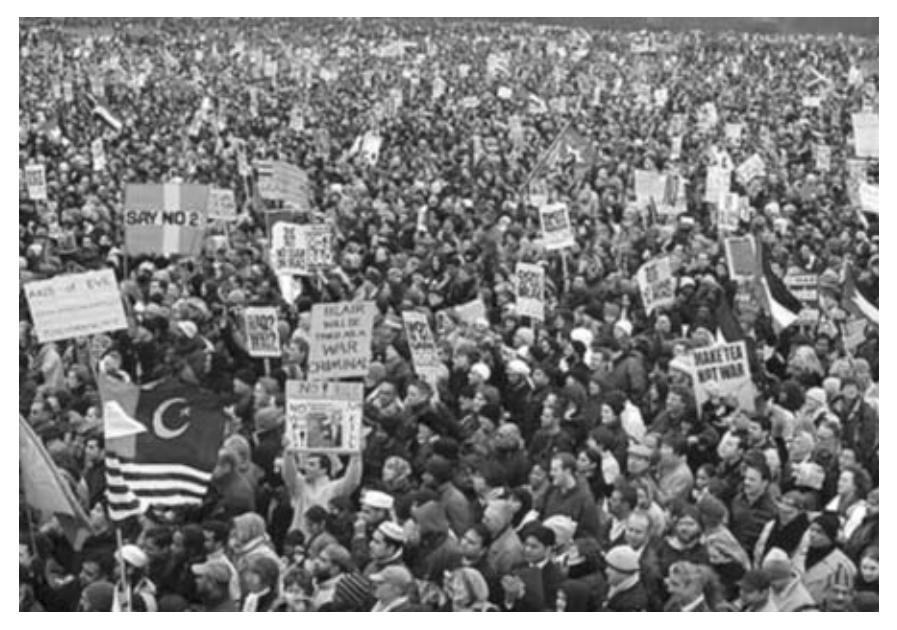
London, March 22: 500,000 denounce U.S.-British war against Iraq.

League for the Revolutionary Party, U.S. Communist Organization for the Fourth International (KOVI-BRD), Germany Revolutionary Workers Organization, Ukraine Revolutionary Workers Organization, Russia