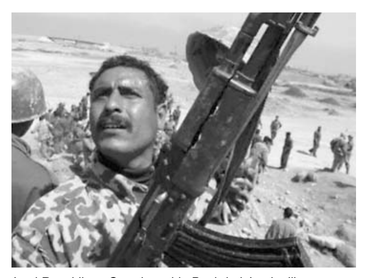
Iraqi Republican Guard outside Baghdad. Iraqi military was outgunned by imperialist war machine.

Another reason for the Bush gang's single-minded war drive is their need to deepen their authority within the U.S. ruling class. This includes electoral victory for their wing of the Republican Party, but it is not that alone. They fear that any temporizing would bolster the "moderates" in their effort to return to the more