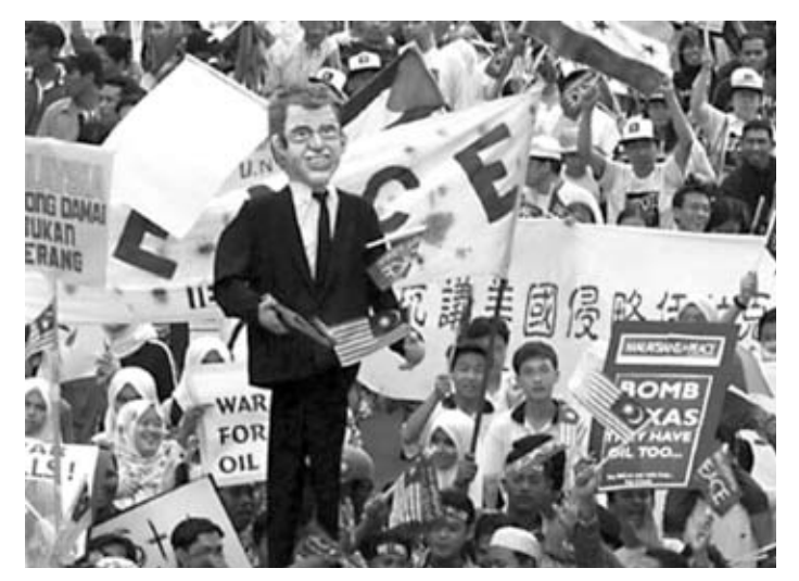
Anti-war demonstration in Malaysia, March 29, 2003

Washington's war moves. British capital is thoroughly interpenetrated with the American economy and intimately linked with U.S. investments abroad. Tony Blair's role as Washington's lapdog is not a matter of personal subservience but an expression of British capital's economic interests, particularly in countering Germany's domination of the European Union.