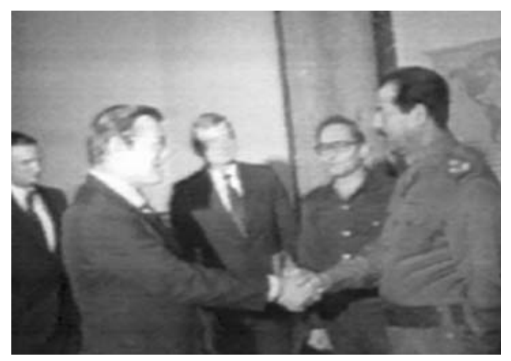
One war criminal greets another. Donald Rumsfeld was U.S. envoy to Iraq in 1983, sent to supply dictator Saddam Hussein with arms and military advice. Rumsfeld then did not protest Saddam's use of chemical "weapons of mass destruction" against Iran.

Latinos. (See page 24.) The butchering of thousands of Iraqi civilians and poorly equipped soldiers only intensifies the racist attitude that Arab lives, and consequently those of all people of color, don't matter. This will inevitably mean an intensification of racism in the U.S.