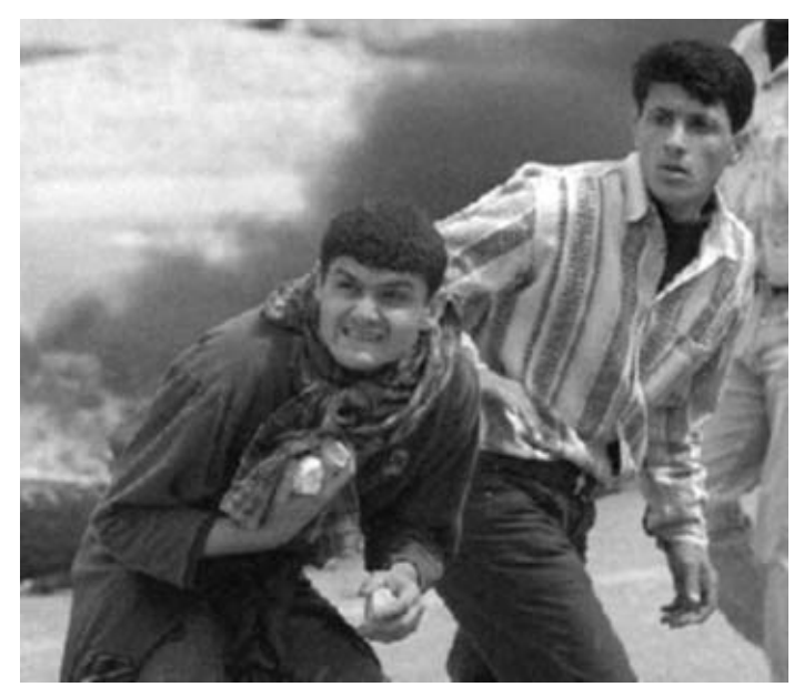
Palestinian youth hurling rocks at Israeli occupiers. Arab rulers failure to arm the Palestinians exposes their loyalty to imperialism.

Moreover, the Spartacists appallingly once raised "a positive demand on a bourgeois state" to send not just arms but an army! In 1983 in Sri Lanka, when the Tamil minority was suffering communalist massacres, the SL called for the army of Sri Lanka's much larger neighbor India to protect the Sri Lankan Tamils. Their excuse? This would have been "a practical and probably not