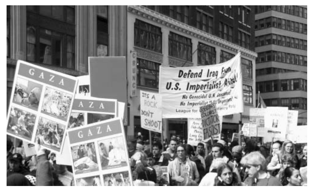
LRP marching with defenders of Palestine and Iraq in New York City, March 22.

As for "opportunist impulses that animate" socialists to imagine building a revolutionary leadership with pro-imperialist liberals, while this is a slanderous characterization of the LRP, it accurately describes the SL at times, depending on what position they think offers them some short-term gain. When the SL is confronted with coalitions and movements they can't control, they adopt a sectarian posture: they stand outside the struggle and hurl condemnations from the safety of their newspaper office. But when they get a chance to run a coalition with liberal Democrats themselves, the Spartacists can adopt a thoroughly craven posture. Readers of PR may remember that in 1994, when Democratic Party liberals