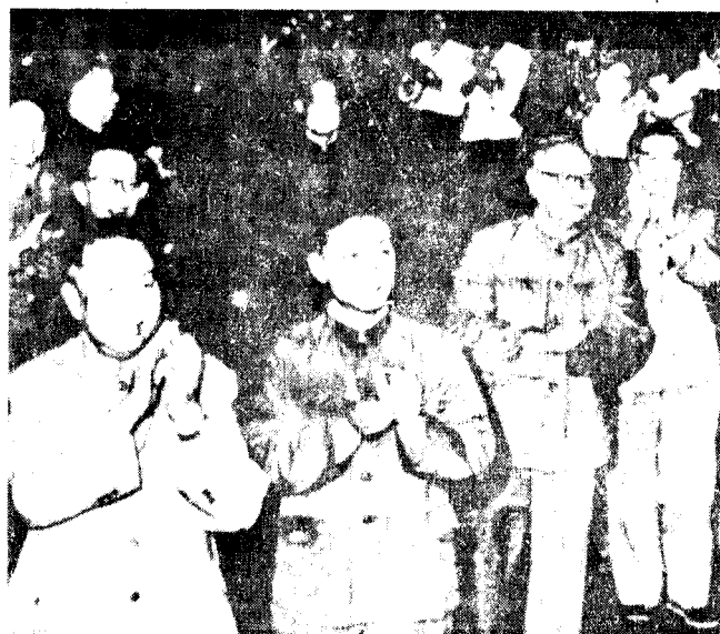
CHINESE "RADICALS" AND "MODERATES" TOGETHER. LEFT TO RIGHT, CHIANG CHUN-CHIAO, HUA KUO-FENG, WANG HUNG-WEN, YEH CHIEN-YING AND CHIANG CHING.