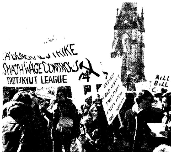
TL BANNER AT OTTAWA CLC DEMO, MARCH 1976.