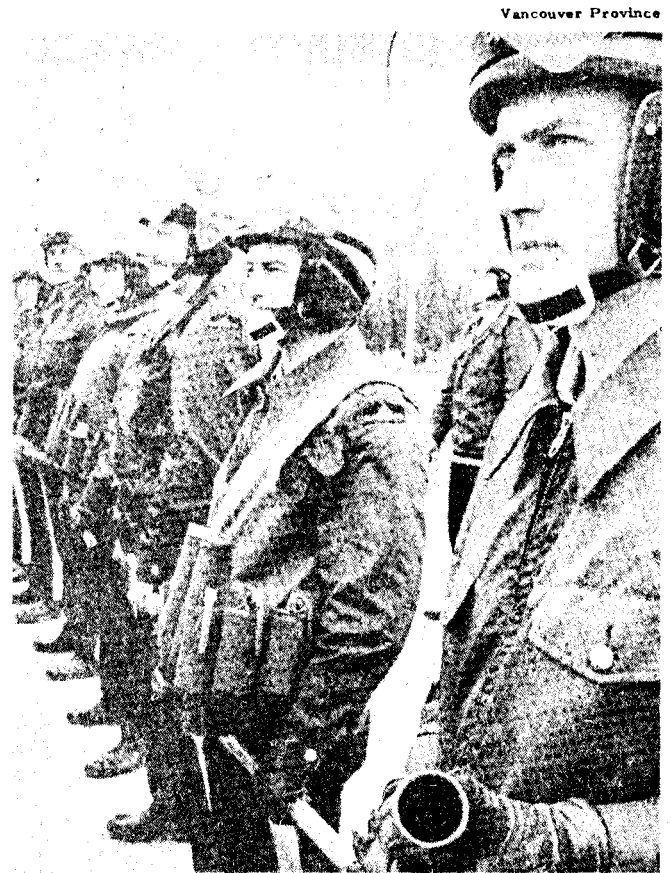
KITIMAT, JULY 1976: RIOT-EQUIPPED RCMP COPS PREPARE EARLY-MORNING ASSAULT ON CASAW'S PICKET LINE.

The strike was finally broken by a massive early morning RCMP assault on the picket line (which had been declared illegal by the LRB). When the unionists were finally forced back to work, the LRB imposed heavy punitive measures on CASAW and on individual workers. In addition to suspensions of up to six months' duration which had already been imposed, the union had to accept two further penalties, or else Alcan would be free to fire whomever it pleased in retaliation for the walkout. First, the LRB paid homage to the days of feudal serfdom by demanding that a number of strike leaders donate ten days' free labor to the company in compensation for losses incurred during the strike. Further, workers who had received money from the union while they were under company suspension in the post-strike period had to give legal guarantees that it would be repaid. The LRB ordered this blatant interference into the union's internal affairs because