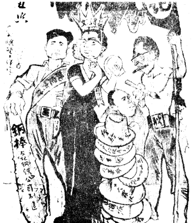
CHINESE WALL-POSTER DEPICTS "GANG OF FOUR"

ORDER FROM: Spartacist Publishing Co. Box 1377, GPO/NY, NY 10001