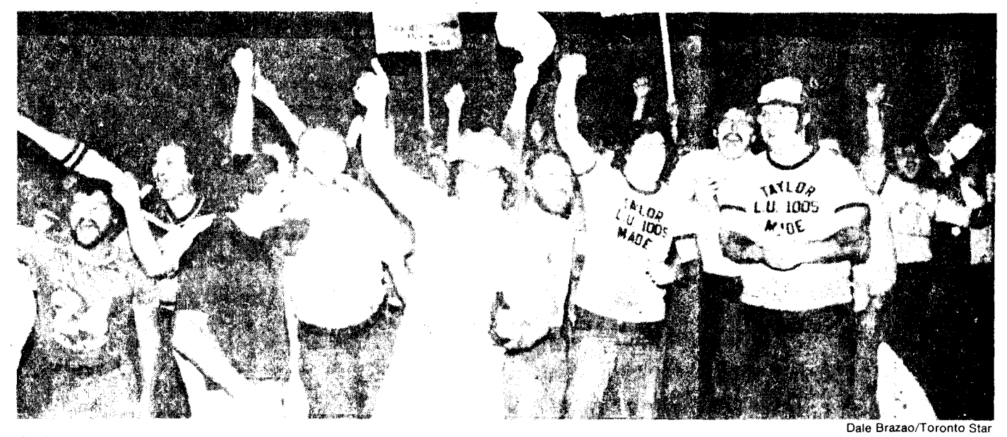
Stelco workers hit the bricks.

August 28-In their first strike since 1969, 12,500 steel workers at Stelco's giant Hilton Works in Hamilton walked off the job at midnight July 31. They were joined on the picket lines by 5,000 steel workers at smaller Steleo operations across Ontario and Quebec. In twelve years without a strike Stelco workers have seen their wages eroded by a string of rotten contracts railroaded through by the United Steelworkers of America (USWA) tops. This time they declared "Enough is Enough!" While Steleo boasts record profits its offer was a miserly $1.15 over a three-year contract. With steel production booming and stockpiles low, the strikers know they are in a good position to face the bosses down. "We've got 'em by the short hairs. Now we're going to squeeze and I mean really squeeze" one striker told a Spartacist Canada reporter, expressing the strikers' determination to force the Stelco bosses' backs to the wall.