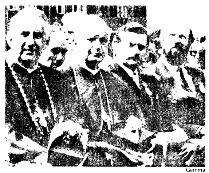
Walesa (center) in solidarity with reactionary Polish Catholic church.

The foreign exchange shortage did not spare agriculture as the government cut back pesticide imports and couldn't supply spare parts for Western-made farm machinery. The peasants too sensed the post-'76 weakness of the Gierek regime and agitated for higher procurement prices, cheaper inputs and other benefits. In 1979, priest-led peasant strikes