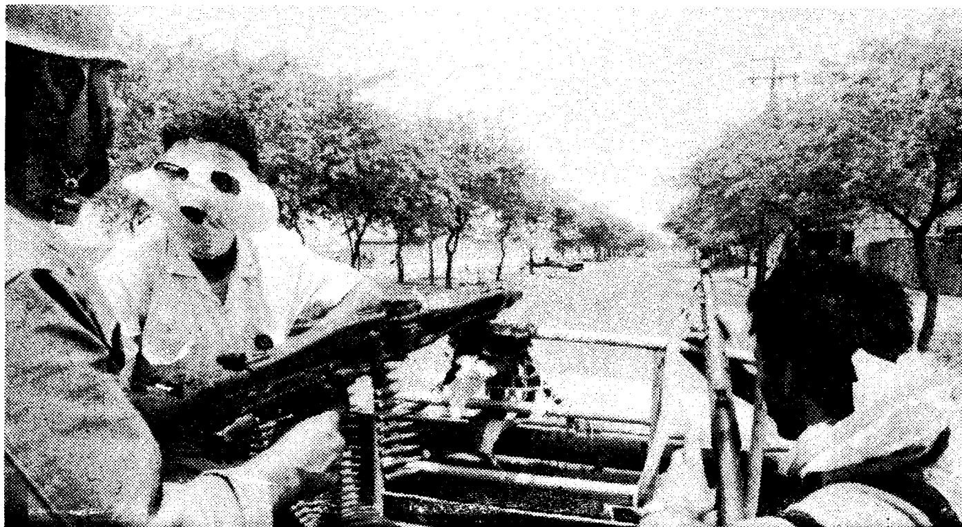
Ayatollah's gunmen keep Khuzistan under Persian domination

Yet the Iranian left still continues to build suicidal illusions in the ayatollahs. The Stalinist Tudeh Party, which has some strength among the oil workers, continues to give whole-