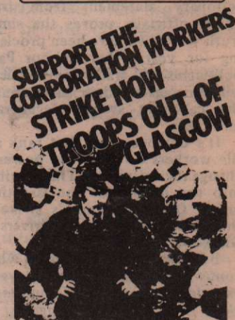
The poster produced by Glasgow International Socialists to win support for the dustcart drivers.

THE troops in Glasgow are NOT there to deal with a health hazard. They are there to break strikes.