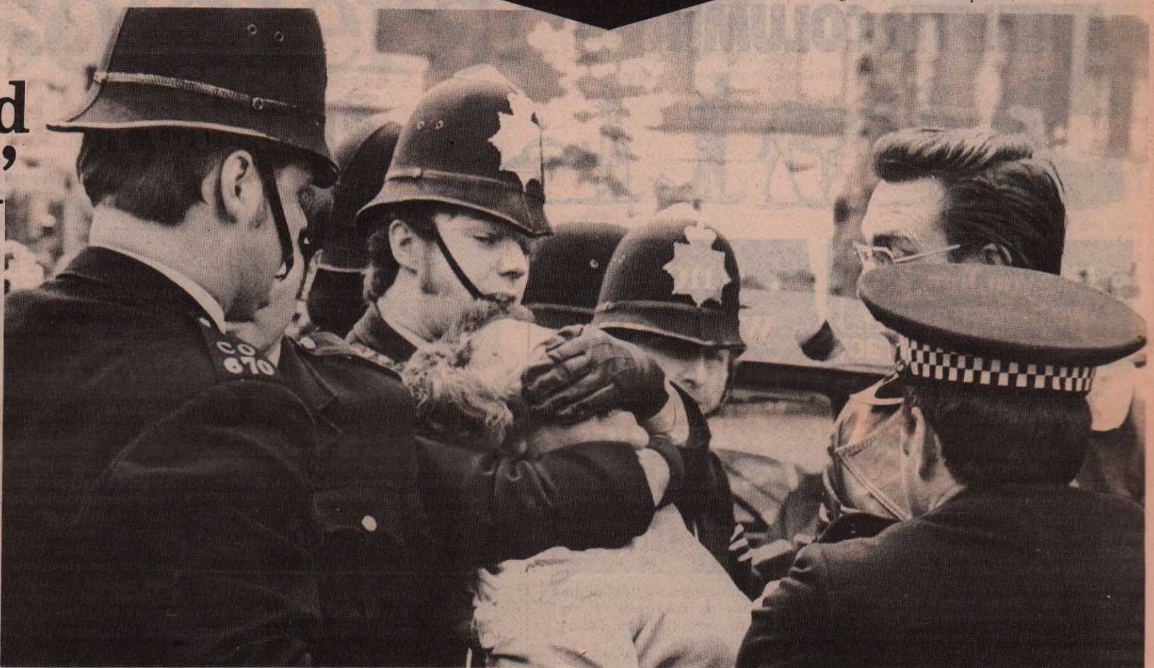
Excuse me, sir, but have you seen our latest line in 'excessive tolerance'? A demonstrating docker, no doubt one of Mark's 'sophisticated extremists', finds out about the police's 'sense of duty'.

So far from Sir Robert Mark's police headquarters: NO ARRESTS.