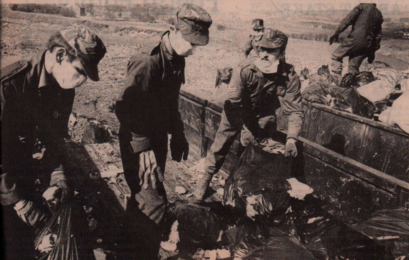
... health hazard! On Thursday 19 March, two of Glasgow's main incinerators broke down. The troops couldn't mend them. ... the health hazard by dumping rubbish from the city centre at Bishopbriggs, on the edge of the city. The following day, ... from this practice—because it increased the health hazard!