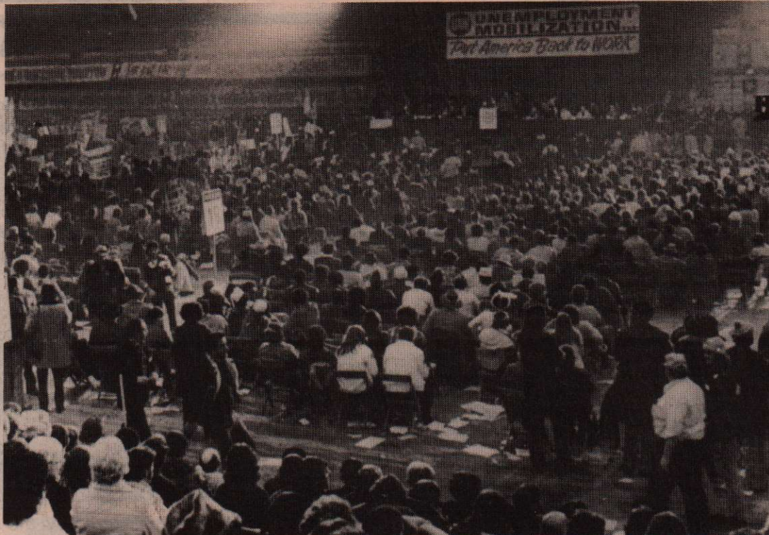
Unemployed car workers demanding jobs at a recent Washington rally. The struggle could explode in Detroit next month, as it did two years ago . . .

The workers refused and steadfastly fought