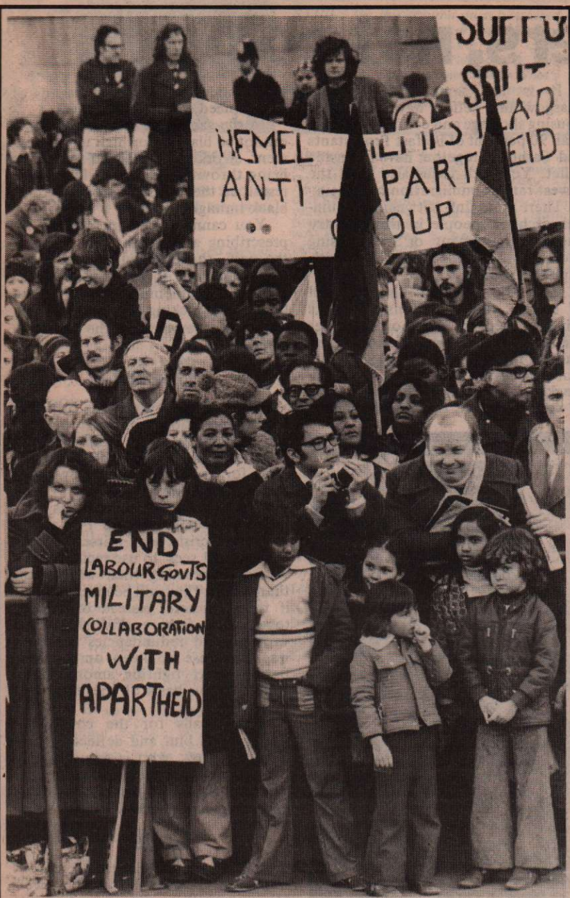
SOME of the 4000 people who marched through London on Sunday in support of the liberation struggle in Southern Africa, and to protest at the Labour government's military collaboration with racist South Africa. Despite the lip-service paid in opposing apartheid, Labour continues a high level of collaboration, not just military. As speakers stressed, this puts Britain firmly on the side of the oppressors. It is up to workers here to side with the oppressed and build up solidarity. This will be a topic for discussion at the International Socialists Africa Group day school on 20 April. (See What's On, page 12, for details).

THE SOCIALIST PARTY aims at building a moneyless world community without frontiers based on common ownership—with production solely for use—not profit. It opposes all other political parties, all leadership, all racism, all war. Write for specimen socialist literature to One World (SW) The Socialist Party of Great Britain, 52 Clapham High Street, London SW4.