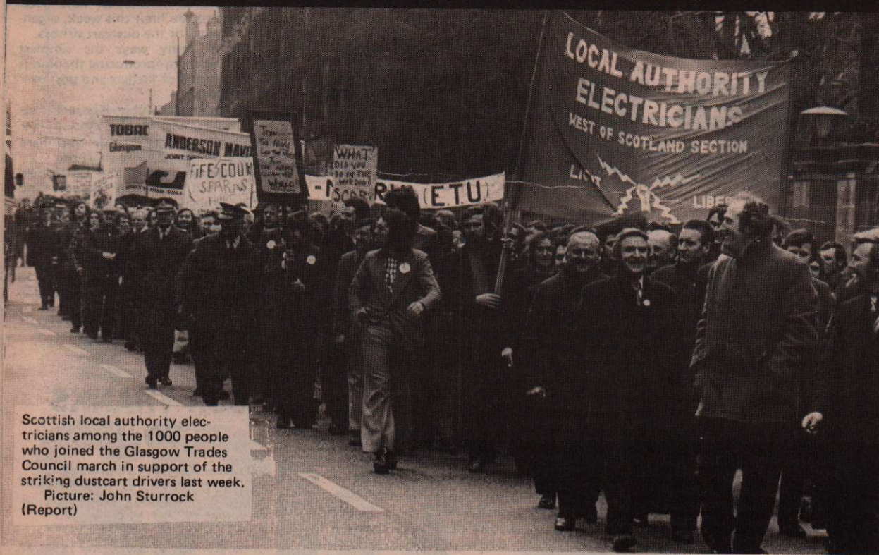
Scottish local authority electricians among the 1000 people who joined the Glasgow Trades Council march in support of the striking dustcart drivers last week.