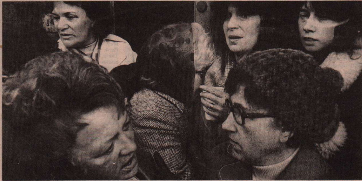
On the picket line at Nettle Accessories, Stockport. Of 150 women who came out on strike for equal pay, all but nine are still out after two weeks. The women, in the AUEW, are well organised. Pickets are being assisted by local trade unionists in a dispute which will help the cause of equal pay throughout the area.

Most engineers will never know that their unions asked the EEF for an immediate £9 on the basic rates and for five days' extra holiday. So it comes as no surprise that Scanlon and the other union negotiators are now going through the formality of recommending acceptance.