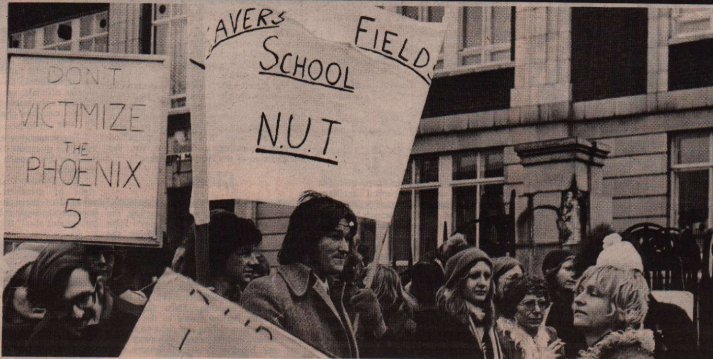
Some of the 200 teachers and other trade unionists picketing the governors' meeting at Phoenix School.