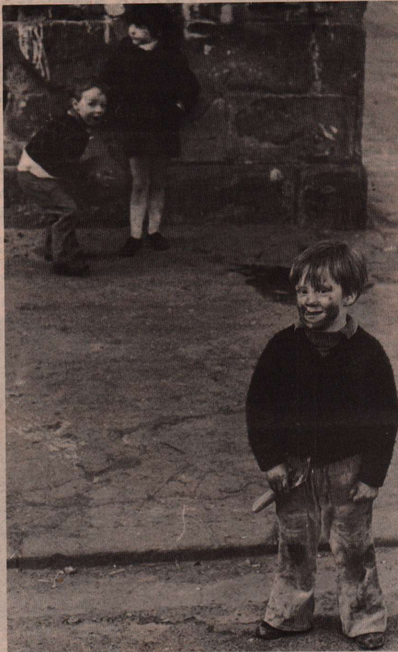
Children at play in Glasgow's Kingston Area. They were born in a health hazard—and suffer for it with infectious diseases.