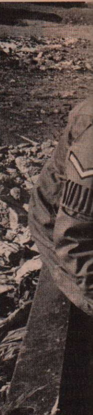
What a way to stop So they 'dealt with they were banned