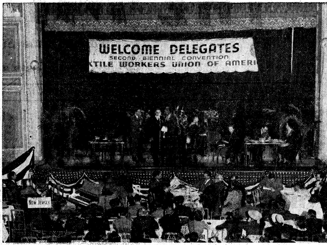
Scene at the second biennial convention of the Textile Workers Union (CIO) held last week in New York City. The delegates were informed that the union now represents some 260,000 workers in over 1,000 firms.