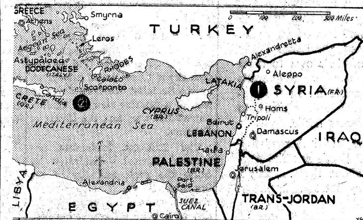
(1) Where French troops clashed with native demonstrators on March 27th, in widespread Nationalist uprisings in the principle Syrian cities of Aleppo, Homs, Damascus and Beirut.

principle informant stated, "Syria is far from self-sufficient economically. She even has to import her matches!" he said with a smile.