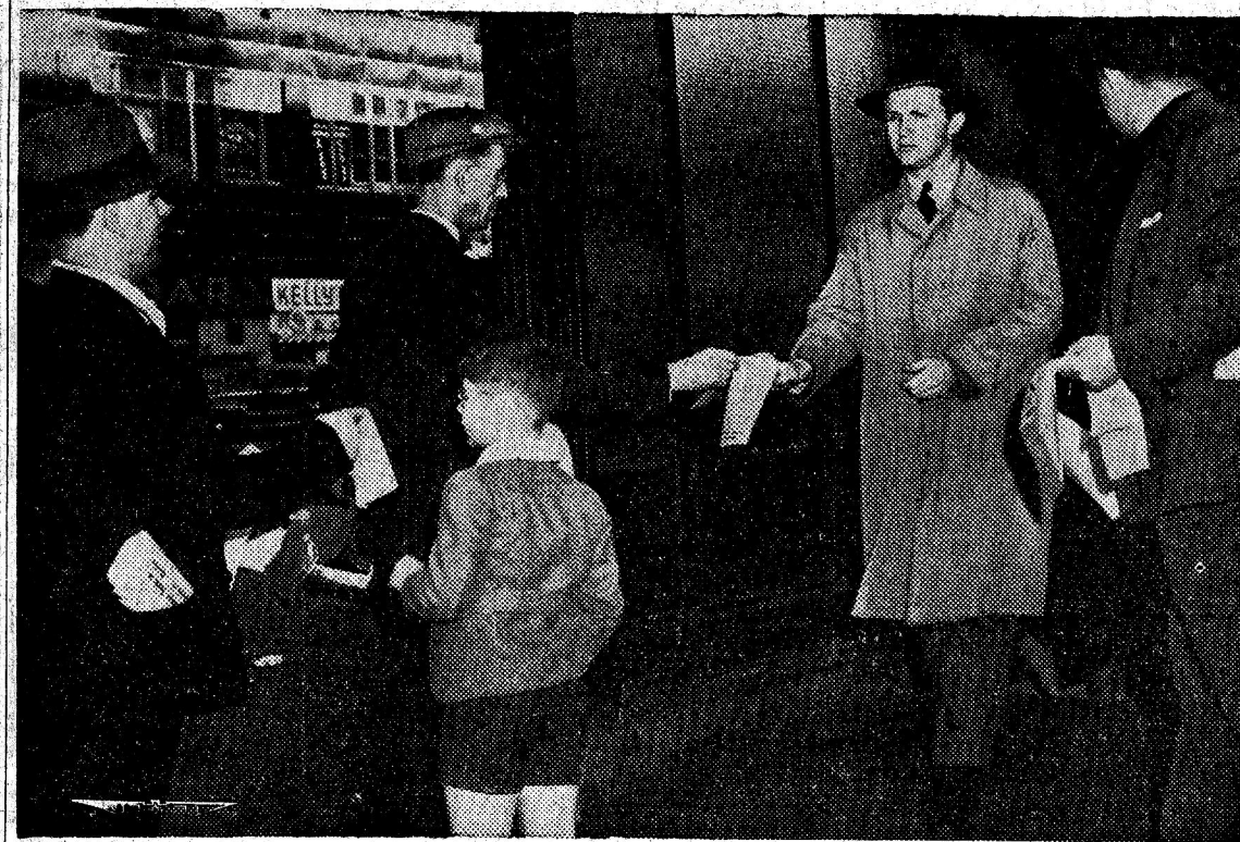
Members of the New York City local of the Transport Workers Union (CIO) launch their campaign to retain the closed-shop contract for 27,000 workers on the city-owned subway systems by putting out millions of union leaflets to subway goers to win their support.