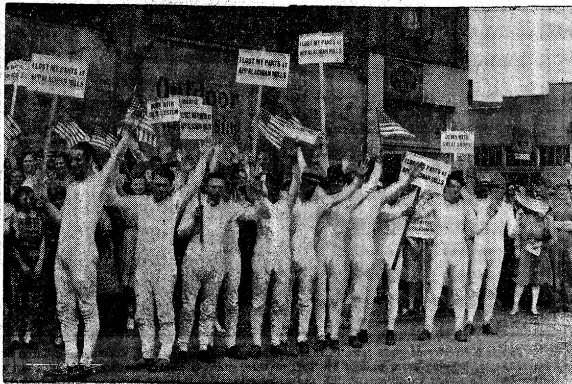
Conventions went by the board when these members of the International Ladies Garment Workers (AFL) picketed in their underwear at the strike-bound Appalachian Mills in Knoxville, Tennessee. This new idea in picketing and the prominent banners, "I lost my pants at the Appalachian Mills," helped bring a speedy union victory.

day seniority clause instead of the current 6-month clause for new employees, $25 a week pay for drafted workers and the 80 hour vacation with pay instead of the current 40 hour clause.