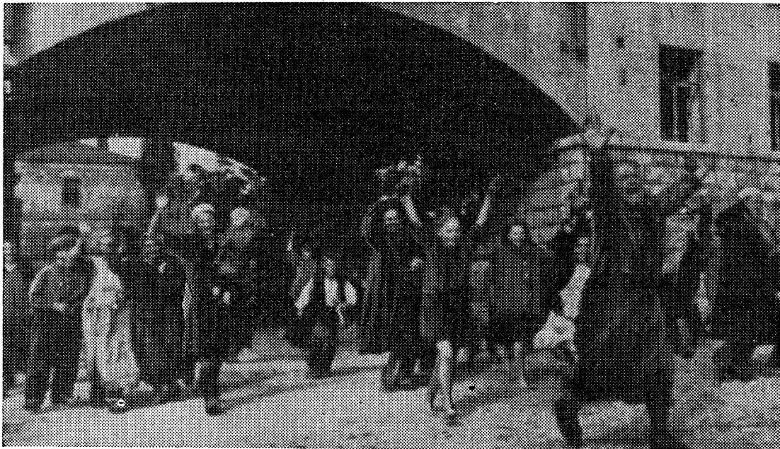
The boundless joy of the populace when the Red Army entered Bryansk is shown above, as barefoot children vie with old women to greet the soldiers. Workers throughout the world are likewise elated to see Hitler's armies driven back but the Red Army victories are producing only consternation and dismay in capitalist circles on both sides of the war fronts.