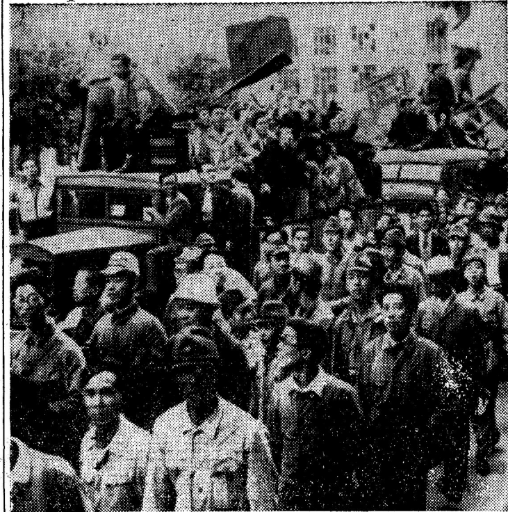
In a scene like any of those in American strikes, Japanese workers here throw a mass picket line around the Japan Broadcasting Company. Union leaders charge that MacArthur supports strikebreaking employers. (See MILITANT, Oct. 26).