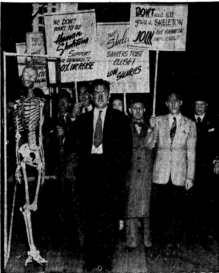
Pickets from the CIO Financial Employees Guild, Office and Professional Workers Union, carried the "skeleton of low wages" right to the heart of the bankers' empire—the New York financial district. "Don't Wait Till You're A Skeleton" one placard says: "Join the Financial Employees Guild." "We Don't Want To Be Human Skeletons," says another, demanding wage raises.