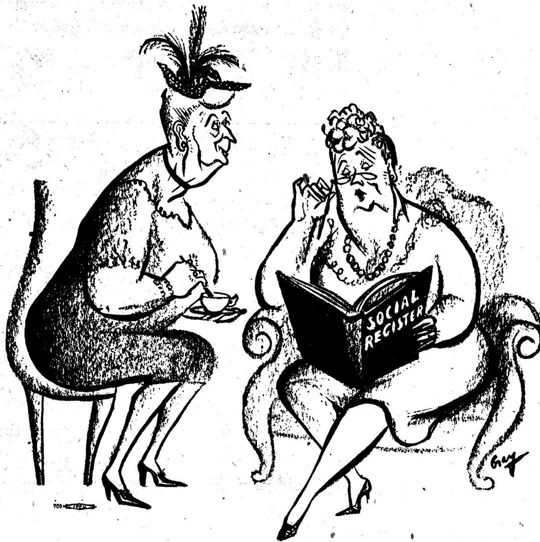
"I can't seem to find ANY of those Socialist Workers Party candidates here."

American labor should ponder this lesson being taught by their British brothers. And they should emulate their example. Only when the workers of all lands unitedly take into their own hands the issue of peace, the issue of the world's future, will humanity have the chance to march forward again.