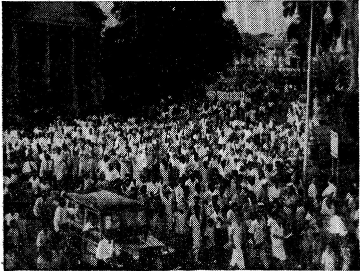
Some of the 20,000 CIO United Public Workers in the Panama Canal Zone who paraded recently to prove the union was there to stay. This demonstration refuted the prediction of local officials and brass hats who predicted six months ago that unionization of the workers would not last.