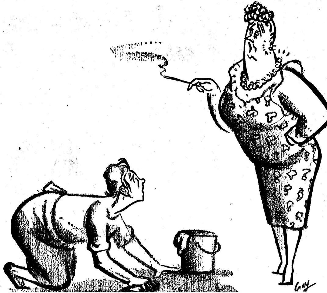
"Of course you'll have to take a loyalty test, you know, before I can put you on steady!"

It is in the interests of the American workers to demand the immediate withdrawal of all the armies of occupation from Germany. Let the German workers take power! An end to the policy of bolstering capitalist reaction in Germany!