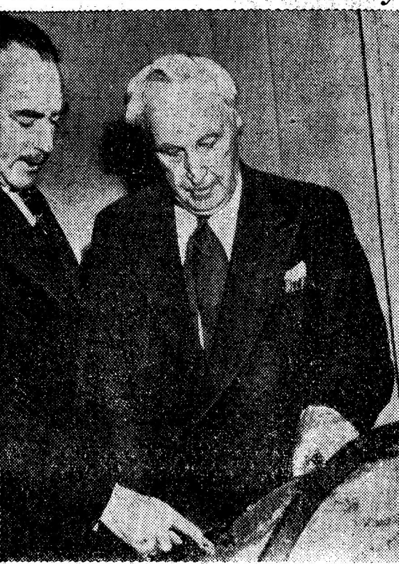
Under-Secretary of State Dean Acheson chats with Chairman Charles Eaton (R., N. J.) of the House Foreign Affairs Committee after indicating in his testimony that U. S. military intervention in Greece and Turkey is only the beginning.